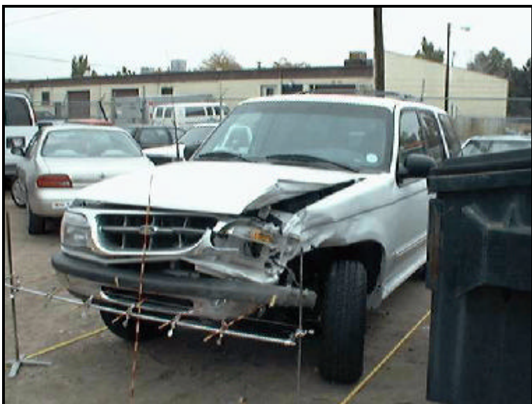
Figure 2. Exterior, Vehicle 2 (Ford Explorer)