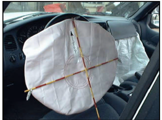
Figure 6. Interior, case vehicle. Driver's side air bag.

The front left air bag was housed in the steering wheel hub and was concealed by asymmetrical H-configuration cover flaps which were not damaged in the crash. The circular air bag was equipped with two tether straps and two vent ports. No contact evidence was found on the air bag and the bag was not damaged.