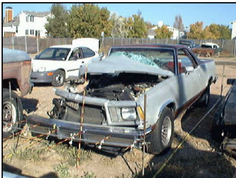
Figure 1. Exterior, Vehicle 1 (Chevrolet El Camino)

Vehicle 2, a 1998 Ford Explorer compact sport utility vehicle (case vehicle) driven by an 18 year old male (178 cm/70 in, 113 kg/250 lbs), was stopped in the eastbound left-turn lane. The driver was preparing to make a left turn at the intersection. It is unclear which phase the traffic signals were in for either driver. The driver was restrained by the available manual lap/shoulder restraint.