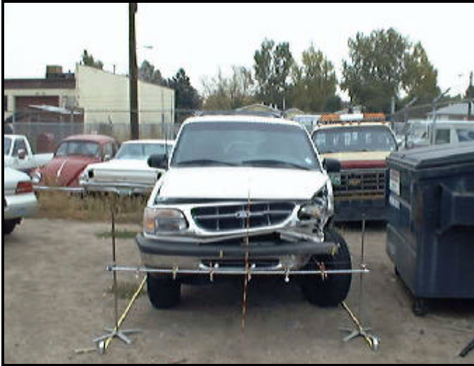
Figure 4. Exterior, Vehicle 2 (1998 Ford Explorer)