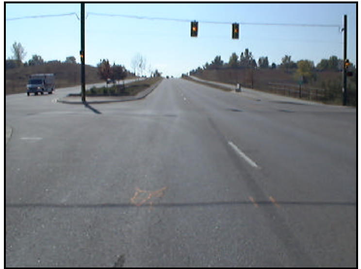
Figure 3. Crash scene, Vehicle 1 approach path.

A Delta V was calculated for Vehicle 2, utilizing WinSMASH, as 16 kmph (10 mph).