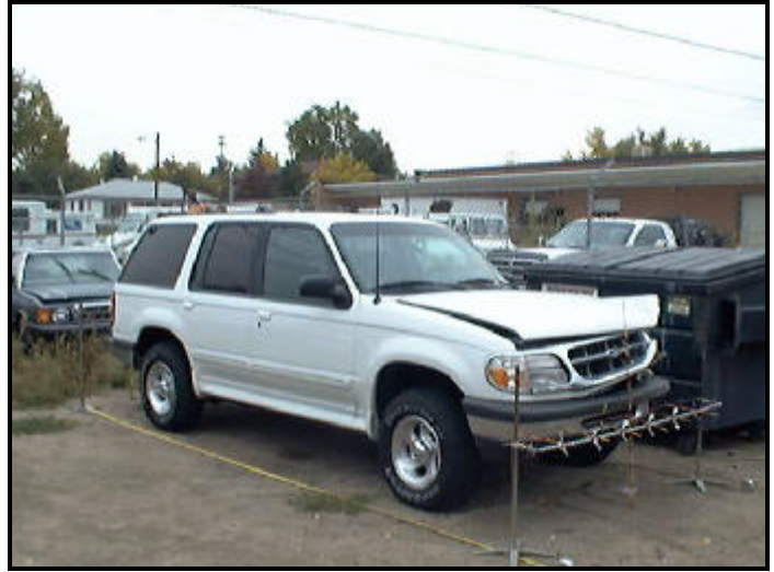
Figure 5. Exterior, Vehicle 2 (1998 Ford Explorer)