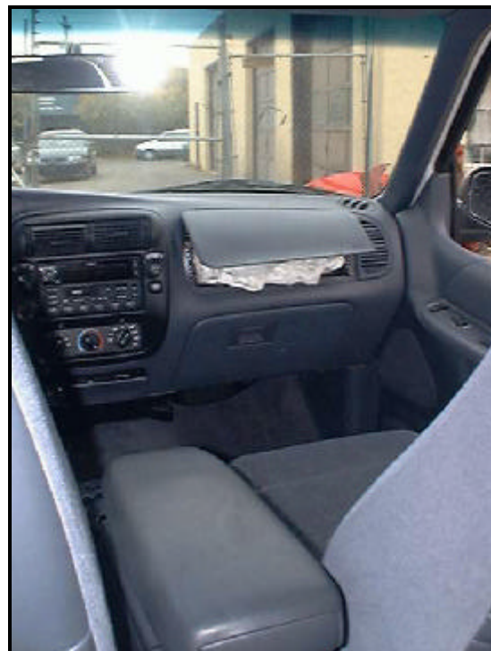
Figure 8. Interior, case vehicle