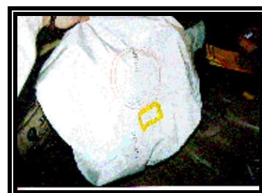
Figure 8: Driver air bag.