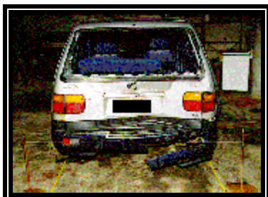
Figure 4: Rear view of the Mazda MPV

Inspection of the 1991 Mazda MPV revealed the vehicle had sustained 92.0 cm (36.3 in) of direct contact damage to the rear bumper (Figure 4). The damage began 12.7 cm (5.0 in) left of center and continued rightward to the right rear bumper corner. The measured crush profile of the bumper reinforcement bar was as follows: C1=0, C2=0, C3=10.8 cm (4.3 in), C4=16.5 cm (6.5 in), C5=16.5 cm (6.5 in), C6=16.5 cm (6.5 in). There was no measurable change in the right side wheelbase measurement. The right rear unitized structure deformed forward and was in contact with the right rear tire (Figure 5). The backlight disintegrated from the impact force. The CDC of the Mazda was 06-BZAW-2