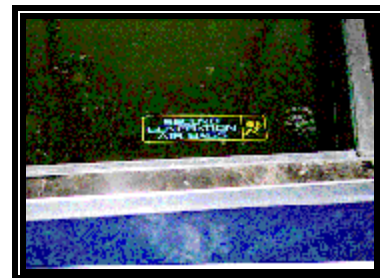
Figure 6: Second Generation Air bag sticker on the left window glazing.

The Lincoln was equipped with a Supplemental Restraint System (SRS) that consisted of "Second Generation" depowered air bags for the driver and right front passenger (Figure 6). The driver air bag module was located in the typical manner in the center hub of the tilt steering wheel (Figure 7). The steering wheel was positioned in the center of its adjustment range. There was no steering wheel rim deformation or movement of the steering column's shear capsules. The H-configuration air bag module opened as designed at the designated tear points during the deployment sequence. The width of the horizontal seam measured 19.3 cm (7.6 in). The height of the upper and lower flaps measured 19.8 cm (7.8 in) and 8.9 cm (3.5 in) respectively. A 5 cm x 5 cm (2 in x 2 in) scuff mark was located on the lower left corner of the upper cover flap. This scuff was attributed to contact with the steering wheel rim.