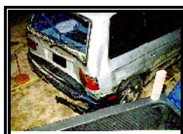
Figure 5: Right rear view of the Mazda.