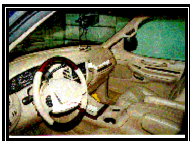
Figure 7: Front interior view.

The driver air bag was tethered by two 13 cm (5 in) wide straps. In its deflated state, the air bag measured 62.2 cm (24.5 in) in diameter. The face of the bag was stamped with the following identification number: 113712R. There was a light tan transfer mark 3.8 cm (1.5 in) in length located in the 6 o'clock sector, 11.4 cm (4.5 in) below the center of the bag. This contact was a possible fabric transfer from the driver's clothing. The air bag was vented by two 3.3 cm (1.3 in) diameter ports on the back side of the bag. The ports were located in the 11 and 1 o'clock sectors. The back side of the bag exhibited black scuff marks in the 10, 2 and 6 o'clock sectors attributed to interaction with the interior surfaces of the module cover flaps in the deployment sequence.