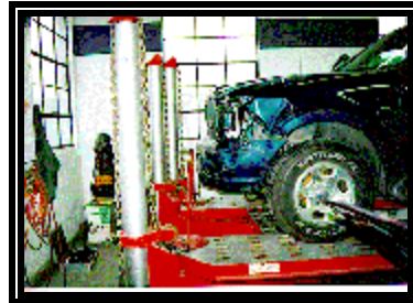
Figure 3: Left lateral view across the Lincoln's front plane.

Inspection of the 1991 Mazda MPV revealed the vehicle had sustained 92.0 cm (36.3 in) of direct contact damage to the rear bumper (Figure 4). The damage began 12.7 cm (5.0 in) left of center and continued rightward to the right rear bumper corner. The measured crush profile of the bumper reinforcement bar was as follows: C1=0, C2=0, C3=10.8 cm (4.3 in), C4=16.5 cm (6.5 in), C5=16.5 cm (6.5 in), C6=16.5 cm (6.5 in). There was no measurable change in the right side wheelbase measurement. The right rear unitized structure deformed forward and was in contact with the right rear tire (Figure 5). The backlight disintegrated from the impact force. The CDC of the Mazda was 06-BZAW-2