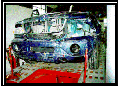
Figure 2: Close-up view of the Lincoln's damage frontal plane.

the left front bumper corner. The measured crush profile of the bumper reinforcement bar was as follows: C1=21.8 cm (8.6 in), C2=19.0 cm (7.5 in), C3=15.2 cm (6.0 in), C4=8.9 cm (3.5 in), C5=0, C6=0. Maximum crush occurred at C1. There was no measurable reduction in the left side wheelbase measurement. The left front fender deformed slightly rearward binding the front door at the hinge pillar. The Collision Deformation Classification (CDC) of the Lincoln was 12-FYEW-1. Speed reconstruction indicated the Lincoln was traveling approximately 30 mph at the time of the crash. The delta V of the Lincoln was calculated to be approximately 13 km/h (8 mph) by the damage only routine of the SMASH program. The delta V determined by SMASH appears to be underestimated based on SCI experience and forensic analysis of the damage pattern. A momentum calculation determined the delta V of the Lincoln was approximately 19 km/h (12 mph). The 19 km/h (12 mph) delta V is more consistent with the vehicular damage. As a result of the crash, the Navigator's depowered frontal air bag system deployed. Repair estimates for the Lincoln exceeded $8,000.