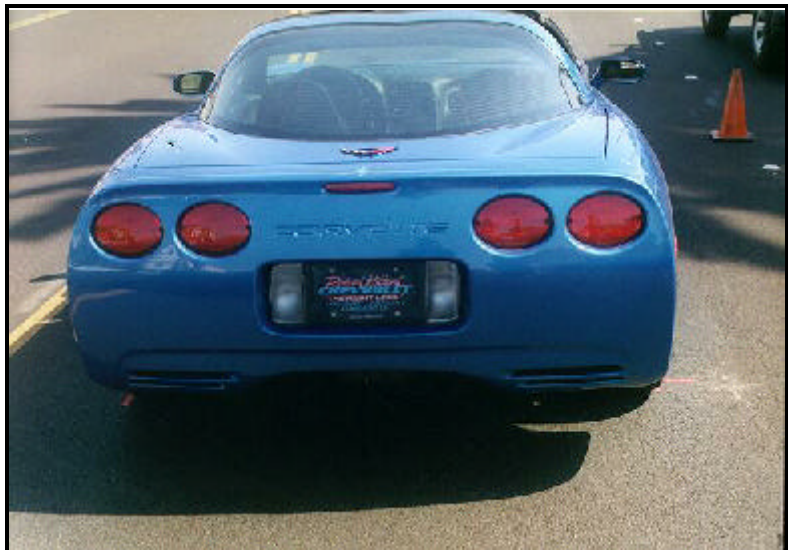
Figure 13. Exterior damage to third vehicle.

Description: 1998 Chevrolet Corvette VIN: 1G1YY22G4W5XXXXXX Odometer: Unknown Engine: Unknown Reported Defects: None noted on police report Cargo: Unknown Damage Description: Minor damage to its rear end consisting of small scratches. No prior damage was noted or claimed. CDC (Estimated from police photographs): Impact 2 - 06BZEW1 Delta V (Not calculated): Total Unknown Longitudinal Unknown Latitudinal Unknown Energy Unknown