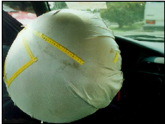
Figure 3. Driver's air bag—case vehicle.

base of the brain. There was massive swelling of the brain (AIS 3). There was marked swelling of the neck with a large abrasion (AIS 1) erythema going from one side of the external ear to the other side across the entire anterior neck and base of the chin area. This abraded area measured 17.15 cm (6.75 in.) x 6.35cm (2.5 in.). There was the presence of an abrasion (AIS 1) on the left angle of the mouth and a contusion (AIS 1) on the lower lip. The tongue showed a bite (AIS 2) at the tip, with hemorrhage in the deep muscle area. Hospital records also indicated a cerebral edema (AIS 3). The coroner ruled the cause of death to be the transection of the spinal cord with fracture due to blunt force trauma.