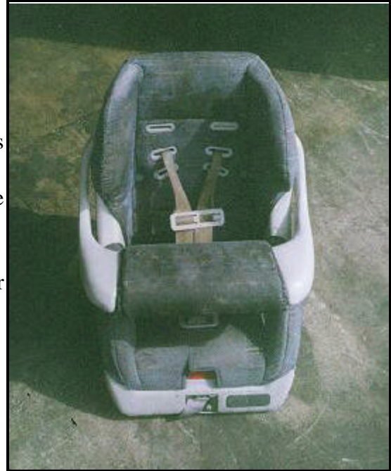
Figure 5. Child seat.

The case vehicle was equipped with driver's side and front right passenger's airbags. The driver's airbag was housed in the steering wheel hub and measured 59.0 cm (23.2 in.) in diameter. It had two vent ports and was not tethered. The dual module covers opened in a H-configuration and were not damaged. The maximum post deflated excursion measured 38.5 cm (15.2 in.). The driver's airbag had makeup transfer on the left-mid area. There were also black linear smudges that were probably module cover contacts, and a possible blood spot on the upper right area. The front right passenger's airbag is mid-mounted and housed within the instrument panel. It measured 50.0 cm (19.9 in.) by 51.0 cm (20.1 in.). It had two vent ports and was not tethered. The single hinged module cover appeared to have been contacted by the child seat. There was a 5.0 cm (2.0 in.) vertical white transfer near the left corner and appeared to be "warped". The front right passenger's airbag had black smudges on the right-center area and above the right vent port that were probably caused by contact with the module cover. The front right passenger airbag was also abraded about the front center. There was no evidence of skin transfer. The maximum post deflated excursion measured 55.0 cm (21.7 in.), and 39.5 cm (15.6 in.) from maximum excursion to the seat back.