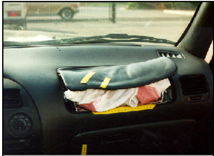
Figure 8. Transfer from child seat.