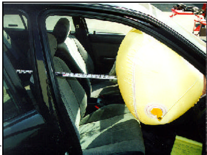
Figure 4. Front right passenger's air bag.

As indicated earlier, the 2-year-old child was in the front right seat position of the case vehicle seated in a forward facing child seat that was identified as an Evenflo Champion/Scout/Trooper Convertible Child Seat with a Series Adjust-A-Shield model number 224144P1 and was manufactured on December 29, 1995. The manufacturer's instructions indicate that the child seat has two adjustment positions. The reclined position is for use with the child seat rear facing with infants