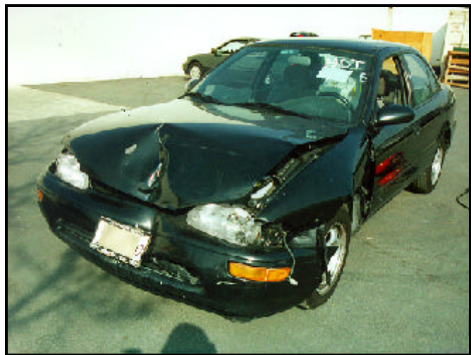
Figure 2. Exterior damage to case vehicle.

The case vehicle was approaching stopped traffic; the other vehicle and the third vehicle were both stopped directly in front of the case vehicle for the red traffic signal. The driver of the case vehicle reported problems with the vehicle's brakes 1 , but the mechanical inspection conducted by the police of