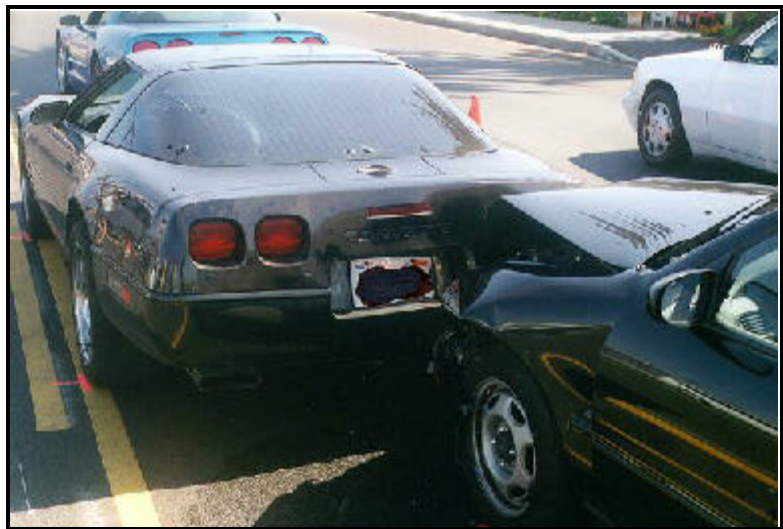
Figure 12. Exterior damage to other vehicle.

Delta V (Impact 1 vs case vehicle): (Impact 2 not calculated) Total 14.1 km/h ( 8.7 mph) Longitudinal 14.1 km/h ( 8.7 mph) Latitudinal 0.0 km/h (0.0 mph) Energy 10,706 joules ( 7,898 ft-lbs)