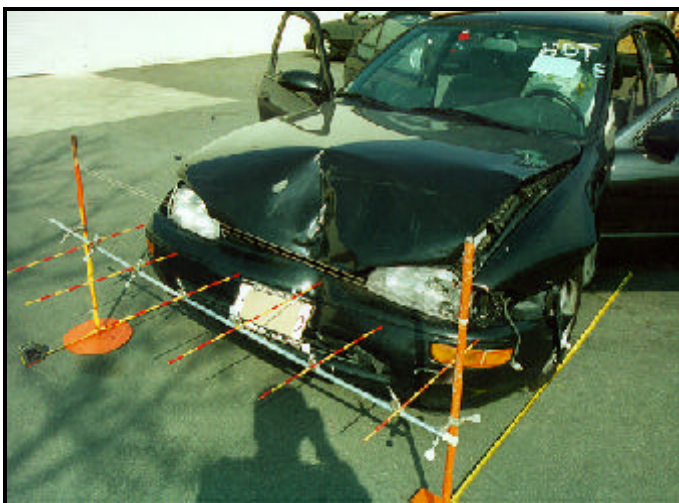
Figure 11. Exterior crush to case vehicle.

Description: 1995 Geo Prizm 4-door VIN: 1Y1SK5262SZXXXXXX Odometer: 79,297 kilometers (49,273 miles) Engine: 1.6 L V4 Reported Defects: None reported. Cargo: None at vehicle inspection Damage Description: Moderate damage to the front bumper, hood and grille area. The front left fender was induced outward. CDC: 12FYEW1 Delta V: Total 19.6 km/h ( 12.2 mph) Longitudinal -19.6 km/h (-12.2 mph) Latitudinal 0.0 km/h ( 0.0 mph) Energy 21,025 joules (15,510 ft-lbs)