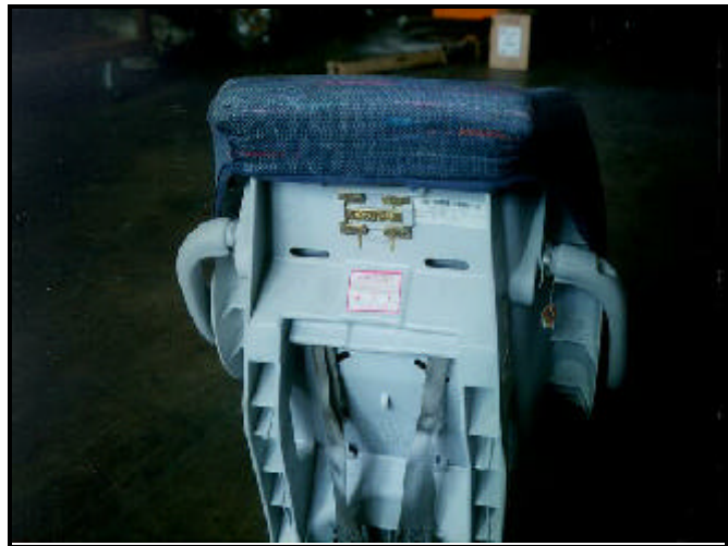
Figure 6. Improper harness slotting.

The police report concluded that the case vehicle’s front right seat was adjusted to the rear most track position. The lap and shoulder belt was used to anchor the child seat to the vehicle’s seat. There was a 30.5 cm (12.0 in.) long section of material transfer on the inboard