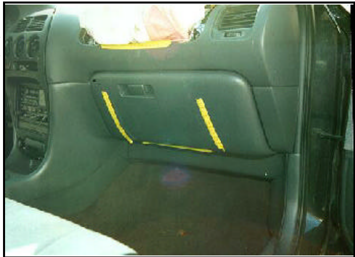
Figure 7. Transfer from child seat.

white transfer evidence on the lower right instrument panel area and similar colored transfer on the front right passenger's airbag module cover. The front right passenger's airbag module cover was also "warped". On impact with the rear end of the other vehicle, the front right passenger's airbag deployed. The front right passenger's airbag module cover probably struck the child seat; the police inspection of the child seat did not indicate any damage to the child seat. The deploying air bag came into contact with the anterior part of 2-year-old's neck and face. There was marked swelling of the neck with a large abrasion erythema going from one side of the external ear to the other side across the entire anterior neck and base of the chin area. This abraded area measures 17.15 cm (6.75 in.) x 6.35cm (2.5 in.). There was an abrasion on the left angle of the mouth and a contusion on the lower lip. The tongue showed a bite at the tip. As the air bag continued its unfolding pattern, the 2-year-old's head was rapidly accelerated rearward causing the fatal injuries of a complete transection of the upper cervical spinal cord with fractures of the second and fourth cervical vertebra with subdural and subarachnoid hemorrhages. The child came to final rest seated in the child seat.