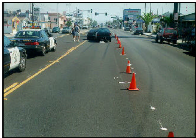
Figure 1. Scene of collision with vehicles at final rest.

This collision occurred in the southbound lanes of a state route south of an intersection in an unincorporated city of southern California in September 1998 at 1323 hours. The state route is a north-south, two way, straight, level newly paved asphalt roadway. The roadway runs in a northwest, southeast manner. Southbound lanes consists of two lanes separated by broken white lines. There is a two-way left turn lane in the middle of the roadway. There were no visual obstructions noted or claimed, and the weather was warm and dry at the time of the collision. The roadway was dry and free of defects, and the speed limit at this location is 64 km/h (40 mph).