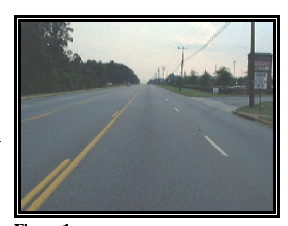
Figure 1: Westbound trajectory view of the crash scene.

without street lights. There were no adverse weather conditions; the road was dry. The crash occurred at the intersection of a 5 lane east/west undivided roadway and a 3 lane north/south private road. The private road intersected the primary roadway from the north and served as the entrance/exit to a shopping center adjacent to the roadway. The traffic lanes of the primary road were configured as two travel lanes in each direction with a center turn lane. There was an estimated +2 percent grade in the westbound direction. The traffic lanes of the private road were configured as a single entrance lane and two exit lanes (one eastbound/one westbound). A stop sign for traffic exiting from the private road controlled the