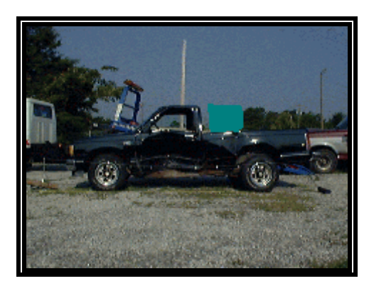
Figure 5 : Left side view of the 1988 Chevrolet S-10 pick-up.

in) relative to the pick-up box. The CDC of the vehicle was 10-LPEW-3. The total Delta V calculated by the Damage Only Algorithm of the WINSMASH program was 30.9 km/h (19.2 mph). The longitudinal and lateral components were -15.5 km/h (-9.6 mph) and 26.8 km/h (-16.6 mph), respectively. The barrier equivalent speed was 37.3 km/h (23.2 mph).