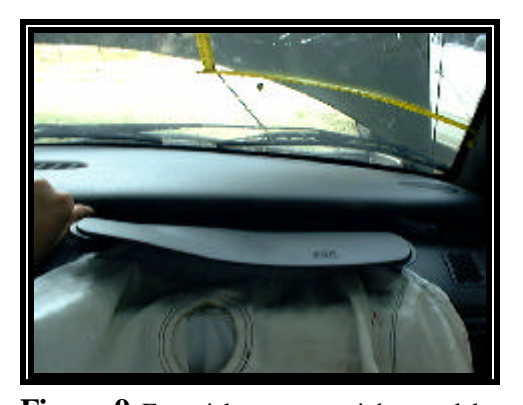
Figure 9: Front right passenger air bag module.

The front right passenger air bag module was configured as a top mount in the right aspect of the instrument panel, Figure 9 . The passenger air bag module cover flap measured 33 cm x 15 cm (13 in x 6 in), width by height. The single vinyl flap design was hinged on the forward edge of the module and rotated forward during deployment. The left aspect of the cover flap was deformed relative to the right aspect. This deformation occurred as a result of the altered deployment sequence. There was not any direct evidence of occupant contact on the cover flap.