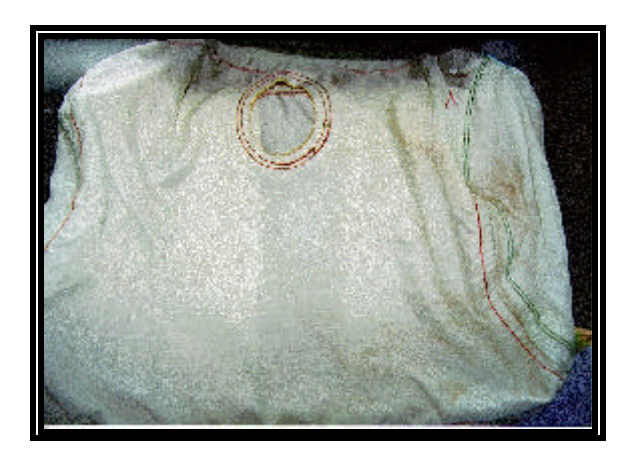
Figure 12: Top surface of the air bag.

The bottom surface and face of the air bag did not exhibit any contact evidence. On the right aspect of the air bag's top surface was a dark tissue transfer and a large area of melanin transfer, Figures 12 and 13 .. The melanin transfer also extended onto the outboard surface of the bag. The tissue transfer measured 10 cm x 2 cm (4 in x 0.8 in), laterally by longitudinally, and was located 6.4 cm (2.5 in) rearward of the aft edge of the air bag module. The melanin transfer was dispersed over an area that measured 15 cm x 30 cm (6 in x 12 in), laterally by longitudinally, on the air bag's top surface. The melanin transfer on outboard aspect of the air bag was dispersed over an area that measured approximately 15.2 cm x 19.1 cm (6.0 in x 7.5 in), width by height.