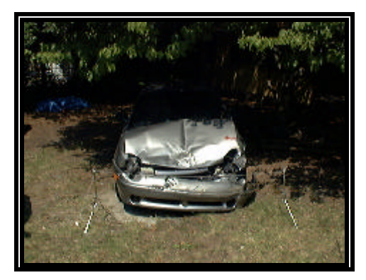
Figure 3 : Front view of the 1998 Plymouth Neon.

The Plymouth Neon sustained direct contact damage across the full 145 cm (57 in) frontal width of the vehicle. The damage was weighted more heavily to the vehicle's left side due to the lateral momentum of the pick-up. The measured crush profile was as follows: C1=21.1 cm (8.3 in), C2=21.6 cm (8.5 in), C3=14.5 cm (5.7 in), C4=9.4 cm (3.7 in), C5=6.9 cm (2.7 in), C6=3.8 cm (1.5 in). The Collision Deformation Classification (CDC) was 01-FDEW-1. The left front fender buckled rearward and slightly restricted the opening of the left front door. The forward aspect of the damaged left front inner fender was in contact with the left front tire. The left side wheelbase was foreshortened approximately 2.5 cm (1.0 in). The right side wheelbase dimension was unchanged. The hood buckled in the typical manner. All the doors were operational upon inspection and all window glazings were in-tact. A single fracture was located on the right side of the windshield. The fracture was linked to the altered deployment of the front right passenger air bag. The total Delta V calculated by the Damage Only Algorithm of the WINSMASH program was 28.3 km/h (17.6 mph). The longitudinal and lateral components were -27.3 km/h (-17.0 mph) and -7.3 km/h (-4.5 mph), respectively. The barrier equivalent speed was 20.7 km/h (12.9 mph). Figures 3 and 4 are front and left lateral views of the Plymouth Neon.