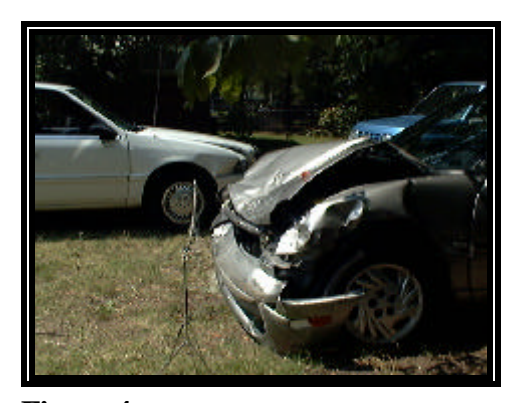
Figure 4 : Left lateral view across the front plane of the Neon.

The Chevrolet S-10 pick-up sustained 186.7 cm (73.5 in) of direct contact damage to the vehicle's left plane, Figure 5 . The damage began 35.8 cm (14.1 in) forward of the left rear axle and exteded forward to the leading edge of the left door. The measured crush profile of the vehicle was as follows: C1=24.1 cm (9.5 in), C2=27.3 cm (10.8 in), C3=33.0 cm (13.0 in), C4=43.2 cm (17.0 in), C5=32.4 cm (12.8 in), C6=10.4 cm (4.1 in). The maximum lateral deformation, located 11.4 cm (4.5 in) forward of C4 (166.9 cm (65.7 in) forward of the left rear axle), measured 48.3 cm (19.0 in). The impact bent the left frame rail of the pick-up, Figure 6 . The left wheelbase was foreshortened 3.0 cm (1.2 in). Both doors were jammed shut. The left window glazing was shattered. The cab was shifted laterally to the right 8.4 cm (3.3