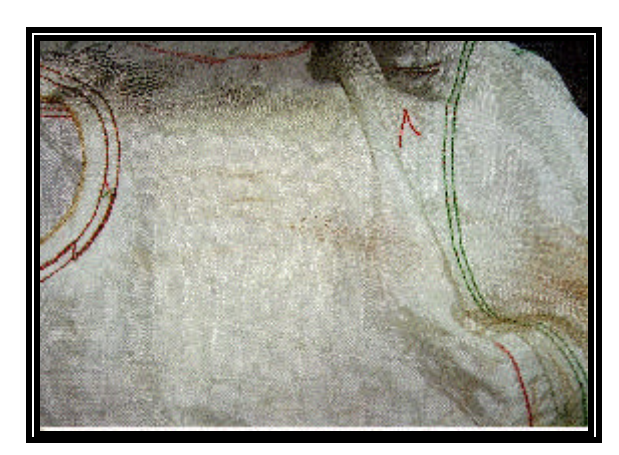
Figure 13 : Close-up view of the tissue and melanin transfer.