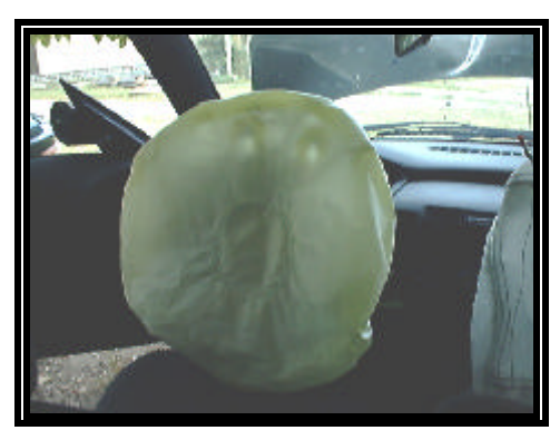
Figure 8: Driver air bag.

The driver air bag, Figure 8 , measured 63.5 cm (25.0 in) in its deflated state. The air bag was vented by two 2.5 cm (1.0 in) diameter vent ports located in the 11/1 o'clock sectors on the back side of the bag. The air bag was tethered by two 14.0 cm (5.5 in) wide straps. The face of the driver air bag was smudged in the lower left and lower right quadrants probably as a result of an altered deployment. The forward position of the driver probably impeded the normal deployment of the air bag and the smudges are resultant to a friction heating between the air bag fabric and the interior surfaces of the driver air bag module.