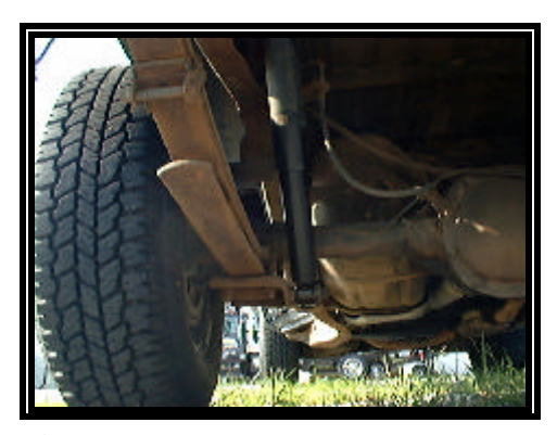
Figure 6: Rear undercarriage view along the left frame rail.

The police report indicated the Plymouth Neon was occupied by 10 individuals (4 front/6 rear). None of the occupants were restrained. Reportedly, the occupants of the Neon were returning home from a birthday party. The vehicle was driven by a 22 year old female. The front right seated passenger was a 25 year female. Seated on the lap of the front right passenger was a 5 year old female and a 4 year old male. The 4 year old male was fatally injured in the crash. The 25 year old female was the boy's mother. Investigation revealed conflicting reports regarding the seated positions of the 5 year old female and 4 year old male, however, the 4 year old male most likely was seated on the outboard aspect of the mother's lap. The left and center rear seated positions were occupied by 4 male children, ages 13, 8, 9 and 6 respectively. The right rear position was occupied by a 26 year old male. A 23 month old female was seated on the lap of the right rear occupant. In a conversation, the coroner indicated there were 11 occupants (4 front/7rear) in the vehicle. That information could not be confirmed.