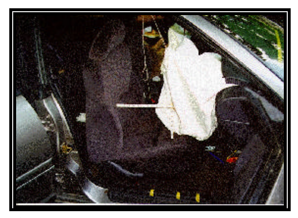
Figure 10 : Right lateral view of the front passenger air bag.