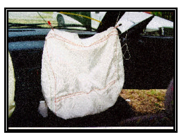
Figure 11: View of the face of the front passenger air bag.

The bottom surface and face of the air bag did not exhibit any contact evidence. On the right aspect of the air bag's top surface was a dark tissue transfer and a large area of melanin transfer, Figures 12 and 13 .. The melanin transfer also extended onto the outboard surface of the bag. The tissue transfer measured 10 cm x 2 cm (4 in x 0.8 in), laterally by longitudinally, and was located 6.4 cm (2.5 in) rearward of the aft edge of the air bag module. The melanin transfer was dispersed over an area that measured 15 cm x 30 cm (6 in x 12 in), laterally by longitudinally, on the air bag's top surface. The melanin transfer on outboard aspect of the air bag was dispersed over an area that measured approximately 15.2 cm x 19.1 cm (6.0 in x 7.5 in), width by height.