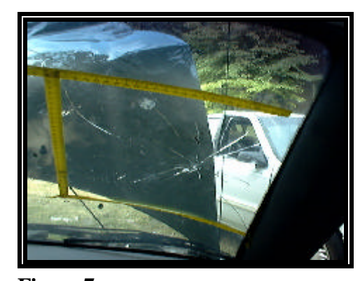
Figure 7 : View of the windshield fracture.

The driver knee bolster exhibited two scuffed areas associated to contact from the driver's knees/lower extremities. A scuffed area 10 cm x 12 cm (4 in x 5 in), width by height, was located