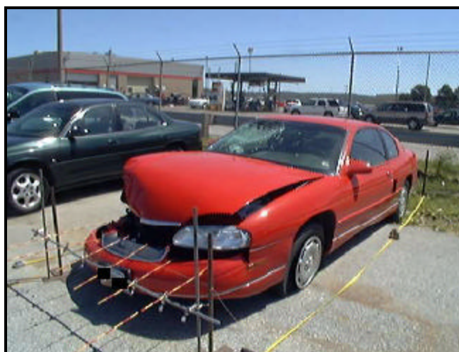
Figure 2. Exterior, Vehicle 2 (Chevrolet Monte Carlo)