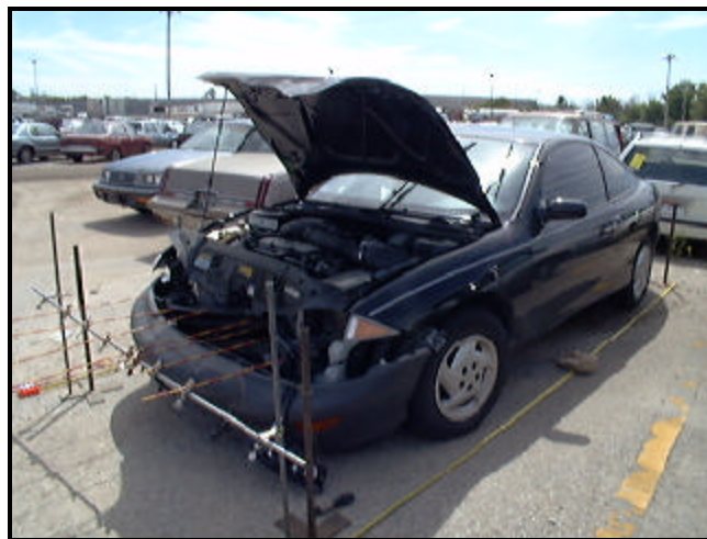
Figure 1. Exterior, Vehicle 1 (Chevrolet Cavalier)

Vehicle 2, a 1999 Chevrolet Monte Carlo 2-door coupe driven by a 48 year old male, was traveling north in the northbound left-turn lane approaching the intersection at an unknown speed. The driver was preparing to make a left turn at the intersection. The overhead traffic signal was in the green phase at this time. It is unknown if the driver was restrained. There were no other occupants in Vehicle 2.