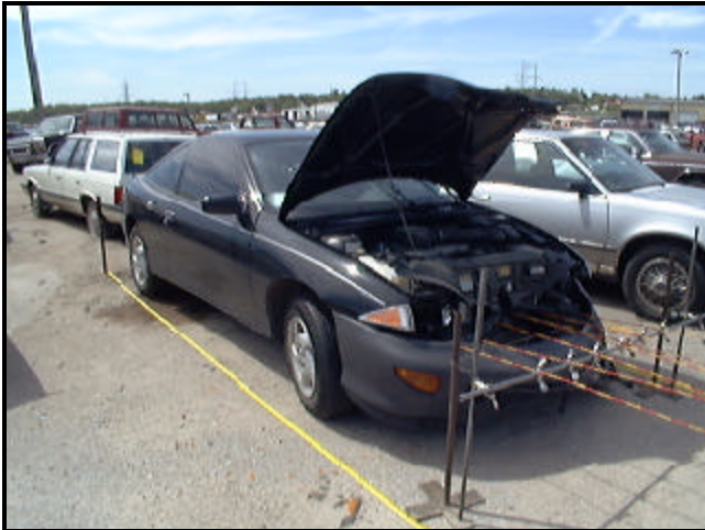
Figure 4. Exterior, Vehicle 1 (1999 Chevrolet Cavalier)