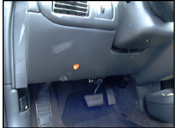
Figure 7. Interior, case vehicle. Knee bolster contact.

At impact, the occupants reacted to the 350 degree principle direction of force by moving forward and slightly left. The driver engaged the deploying driver's frontal air bag-causing the bilateral forearm and wrist abrasions. The driver's knees came into contact with the knee bolster-causing the bilateral knee contusions. A large scuff was found on the knee bolster (see Figure 7). The front right passenger moved sharply forward and impacted the front windshield header-causing the loss of consciousness and scalp contusion. The passenger's knees came into contact with the right instrument panel-causing the bilateral knee contusions and right knee abrasion. Both occupants sustained cervical strains most likely caused by impact forces rather than contact with any component of the vehicle's interior. Both occupants were transported from the scene to a local hospital where they were both treated and released.