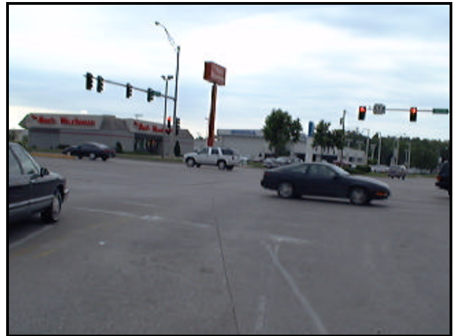
Figure 3. Crash scene. Vehicle 1 approach path.

Both vehicles were disabled due to damage sustained in the crash and were towed from the scene.