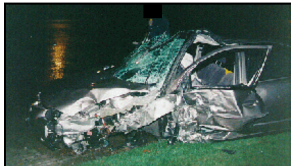
Figure 4: Left side of case vehicle at final rest (case photo #10)