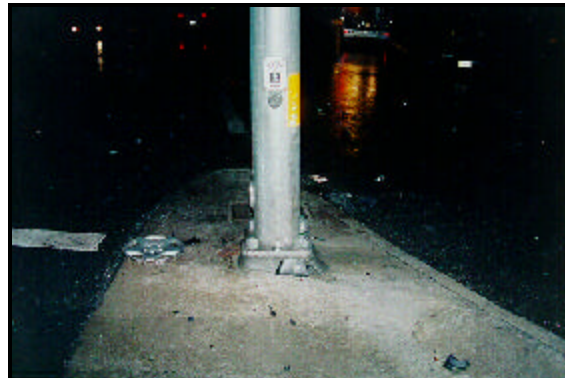
Figure 6: Traffic signal pole contacted by case vehicle; Note: broken section of foundation collar set back in place (case photo #03)

The case vehicle impacted a steel traffic signal support pole that was approximately 30 centimeters (12 inches) in diameter ( Figure 6 ). The pole's foundation consisted of four threaded rods and a collar set in concrete. The pole's base plate was set upon the collar and attached by nuts screwed down against a base plate. A small section of the collar was broken away ( Figure 2 above). There was abrading on the surface of the pole in the area of the impact, but there was no evidence that the pole was damaged or that its foundation was disturbed, other than the fractured collar.