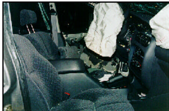
Figure 5: Case vehicle's front seat row, viewed from right (case photo #12)