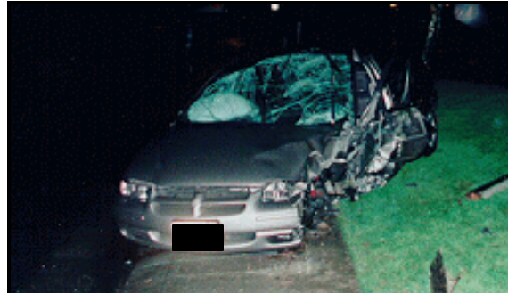
Figure 3: Front of case vehicle at final rest (case photo #09)