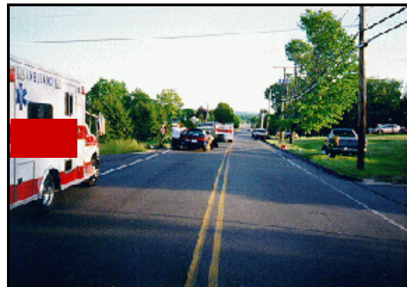
Figure 1: Southerly view of crash scene; Note: case vehicle at final rest left-of-center (case photo #01)

The collision occurred in the northbound lane. The front of the case vehicle impacted the front of vehicle #2, causing the case vehicle's driver and front right passenger air bags to deploy. Vehicle #2's driver and front right passenger air bags also deployed. Neither vehicle rotated post-crash but they rebounded such that they were separated by a measured distance of 4.3 meters (14 feet), with the case vehicle facing south at final rest and vehicle #2 facing north ( Figure 2 ). Investigating officers estimated the travel speed for the case vehicle at 56 km.p.h. (35 m.p.h.) and estimated the travel speed for vehicle #2 at 64 km.p.h. (40 m.p.h.).