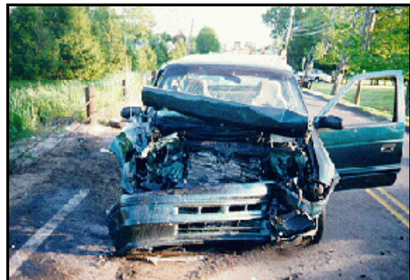
Figure 6: Vehicle #2's front damage; Note: maximum crush just right of the front left corner (case photo #07)

Vehicle #2's driver (35-year-old female; unknown race/ethnicity, height, and weight) was wearing her available, active, three-point, lap-and-shoulder, safety belt system. Her pre-crash seat adjustments, steering wheel position, and posture are not known. She sustained a police-reported "B" injury (fractured left clavicle) and was transported from the scene by ambulance to a medical facility. Her front right passenger (9-year-old female; unknown race/ethnicity, height, and weight) was wearing her available, active, three-point, lap-and-shoulder, safety belt system. She sustained police-reported "B" injuries (fractured right radius and ulna) and was transported from the scene by ambulance to a medical facility. The second seat left passenger (3-year-old female; unknown race/ethnicity, height, and weight) was wearing her available, active, three-point, lap-and-shoulder, safety belt system. She sustained police-reported "C"