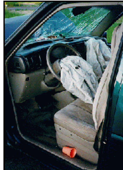
Figure 5: Vehicle #2 driver's seat area; Note: both front air bags deployed (case photo #13)

Vehicle #2's driver (35-year-old female; unknown race/ethnicity, height, and weight) was wearing her available, active, three-point, lap-and-shoulder, safety belt system. Her pre-crash seat adjustments, steering wheel position, and posture are not known. She sustained a police-reported "B" injury (fractured left clavicle) and was transported from the scene by ambulance to a medical facility. Her front right passenger (9-year-old female; unknown race/ethnicity, height, and weight) was wearing her available, active, three-point, lap-and-shoulder, safety belt system. She sustained police-reported "B" injuries (fractured right radius and ulna) and was transported from the scene by ambulance to a medical facility. The second seat left passenger (3-year-old female; unknown race/ethnicity, height, and weight) was wearing her available, active, three-point, lap-and-shoulder, safety belt system. She sustained police-reported "C"