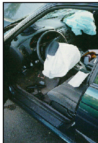
Figure 4: Case vehicle driver’s seat area; Note: no obvious contact marks on air bag or steering wheel (case photo #12)

The following discussion is based on the Police Crash Report’s narrative section, the death certificate, police on-scene photographs, and occupant kinematic principles. It is suspected that the case vehicle’s driver may have fallen asleep. There were no indications that this driver attempted any avoidance maneuvers prior to the crash. The impact caused the case vehicle’s driver and front right passenger air bags to deploy ( Figure 4 ). As that impact was a central, head-on collision, the driver moved forward and it is possible that the deploying air bag caught his lower chin and neck with sufficient force to cause a fracture-dislocation of cervical vertebra C2, with associated contusion of the spinal cord. He continued forward a sufficient distance to deflate the air bag and come into contact with the steering wheel, causing fractured ribs (aspect unknown). He then rebounded and was found slumped in his seat to the left at final rest.