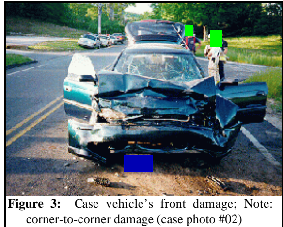
Figure 3: Case vehicle's front damage; Note: corner-to-corner damage (case photo #02)

The case vehicle was an all-wheel-drive, 1998 Subaru Legacy, four-passenger, five-door station wagon (VIN: 4S3BK4353W7-----) equipped with a 2.2 liter gasoline engine and a four-speed automatic transmission with a console-mounted shift lever. It was not equipped with four-wheel anti-lock brakes. The wheelbase for the case vehicle was 263 centimeters (103.5 inches). An odometer reading of 8,819 kilometers (5,480 miles) was reported by investigating officers. The case vehicle was towed from the scene due to disabling damage.