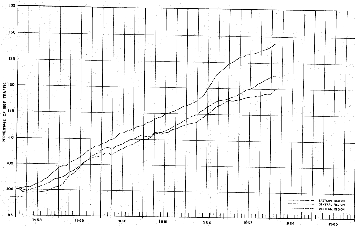
FIGURE 3--TRAVEL ON MAIN RURAL ROADS BY 12-MONTH PERIODS ENDING EACH MONTH, AS PERCENTAGE OF TRAFFIC IN THE CALENDAR YEAR 1957