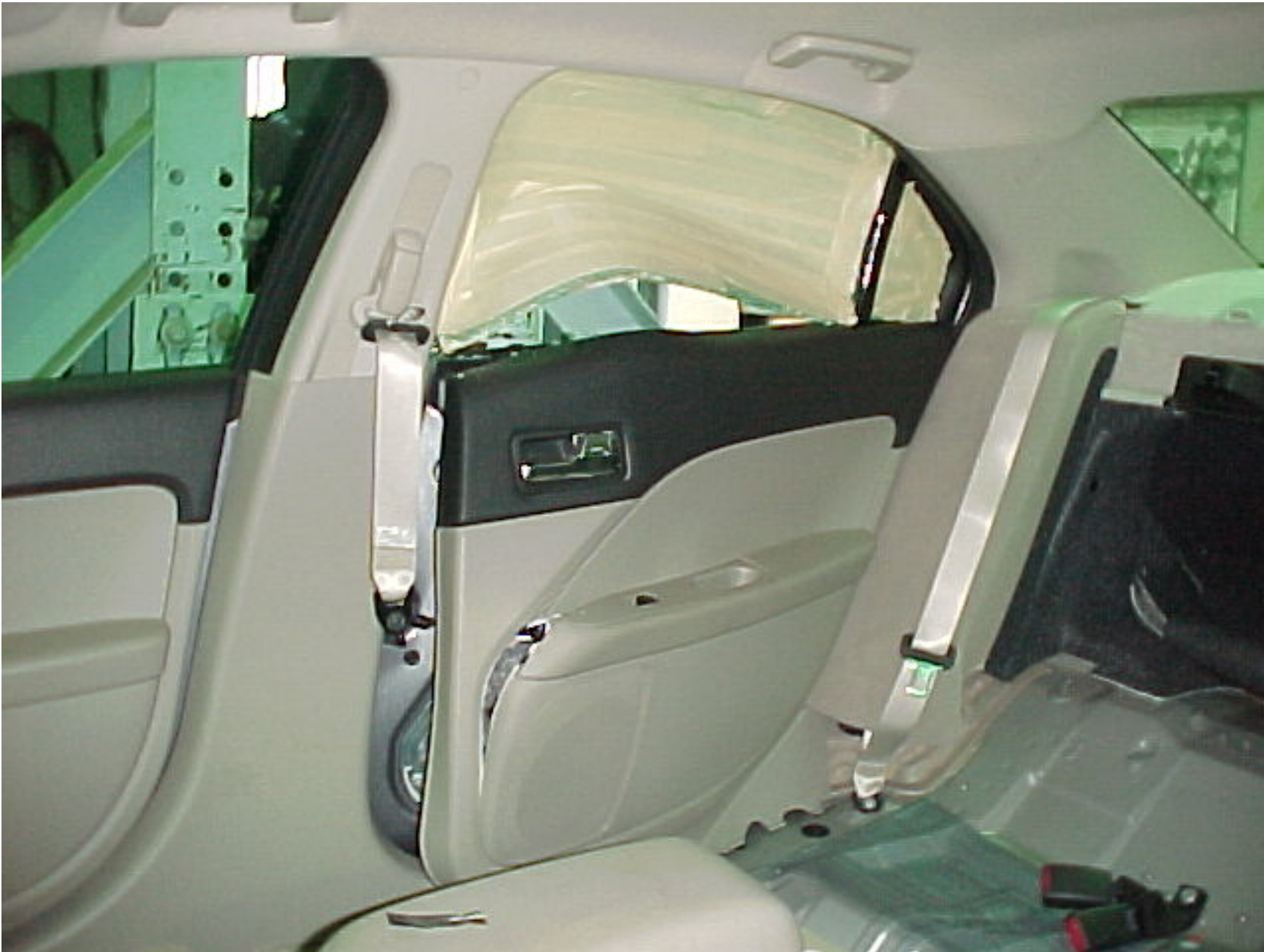
2006 FORD FUSION NHTSA NO. C60202 FMVSS NO. 214