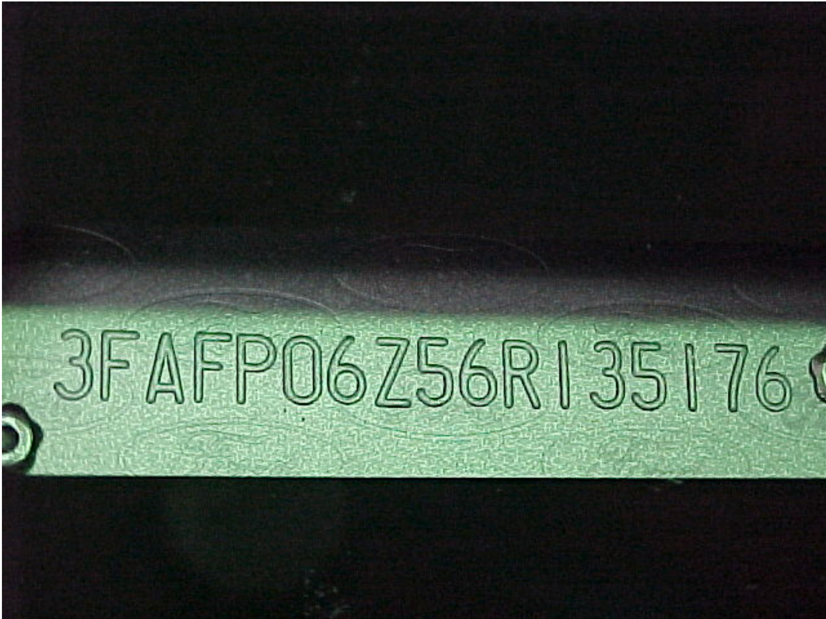
2006 FORD FUSION NHTSA NO. C60202 FMVSS NO. 214