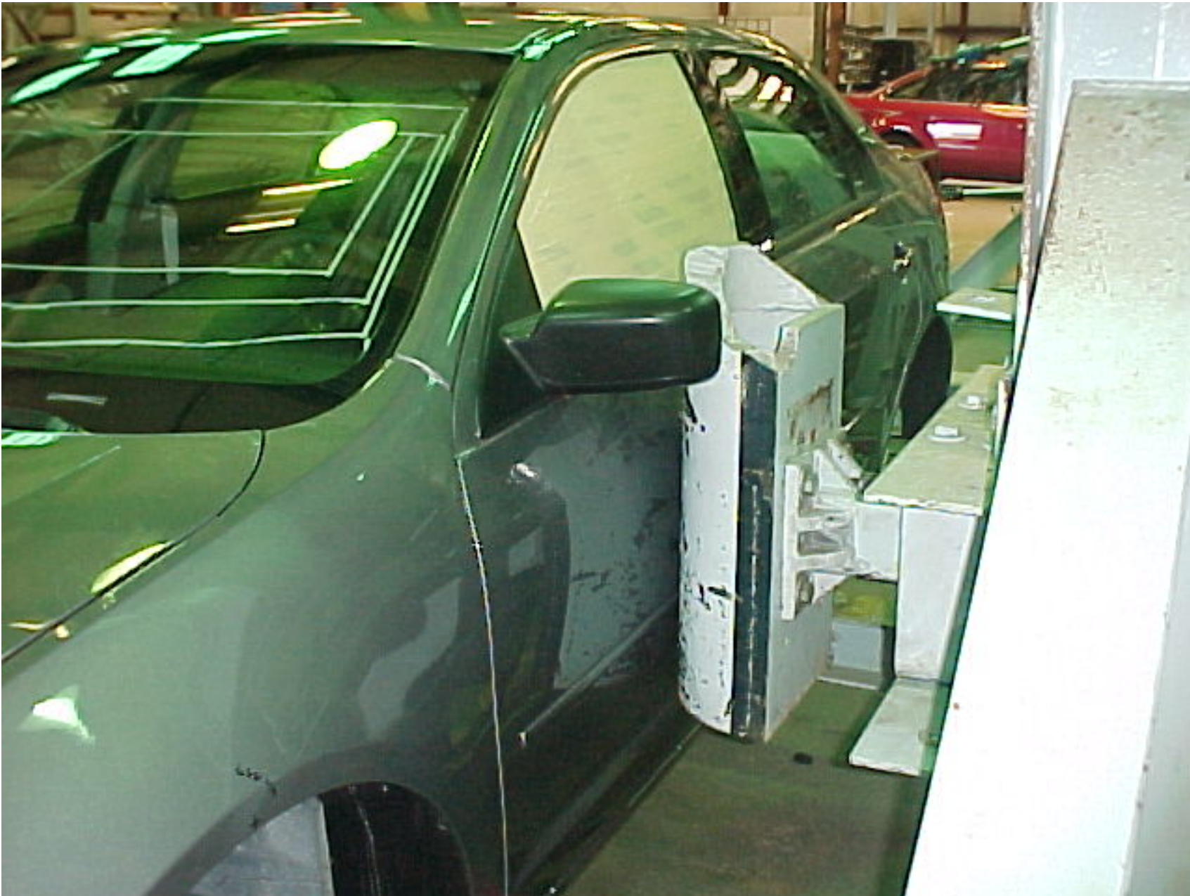
2006 FORD FUSION NHTSA NO. C60202 FMVSS NO. 214