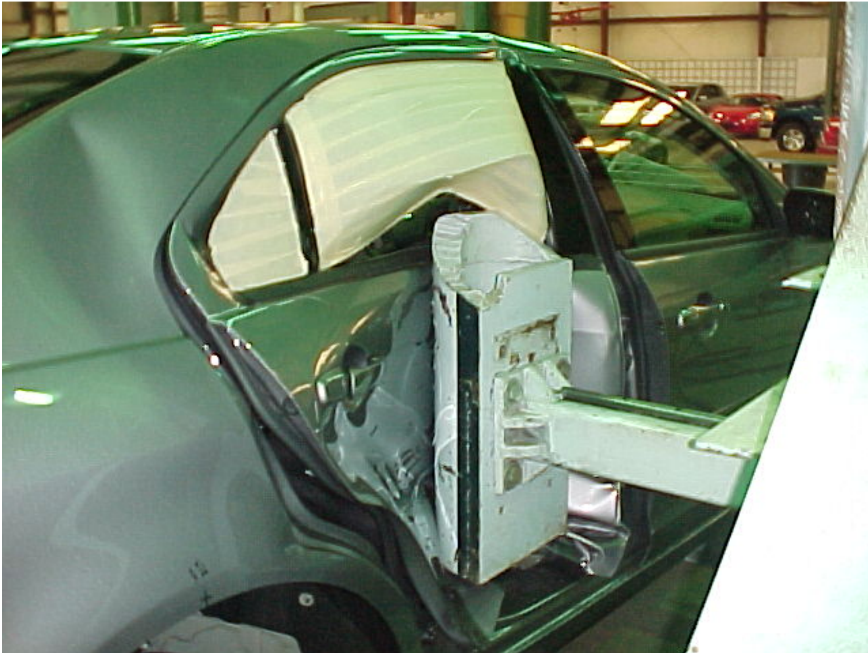
2006 FORD FUSION NHTSA NO. C60202 FMVSS NO. 214