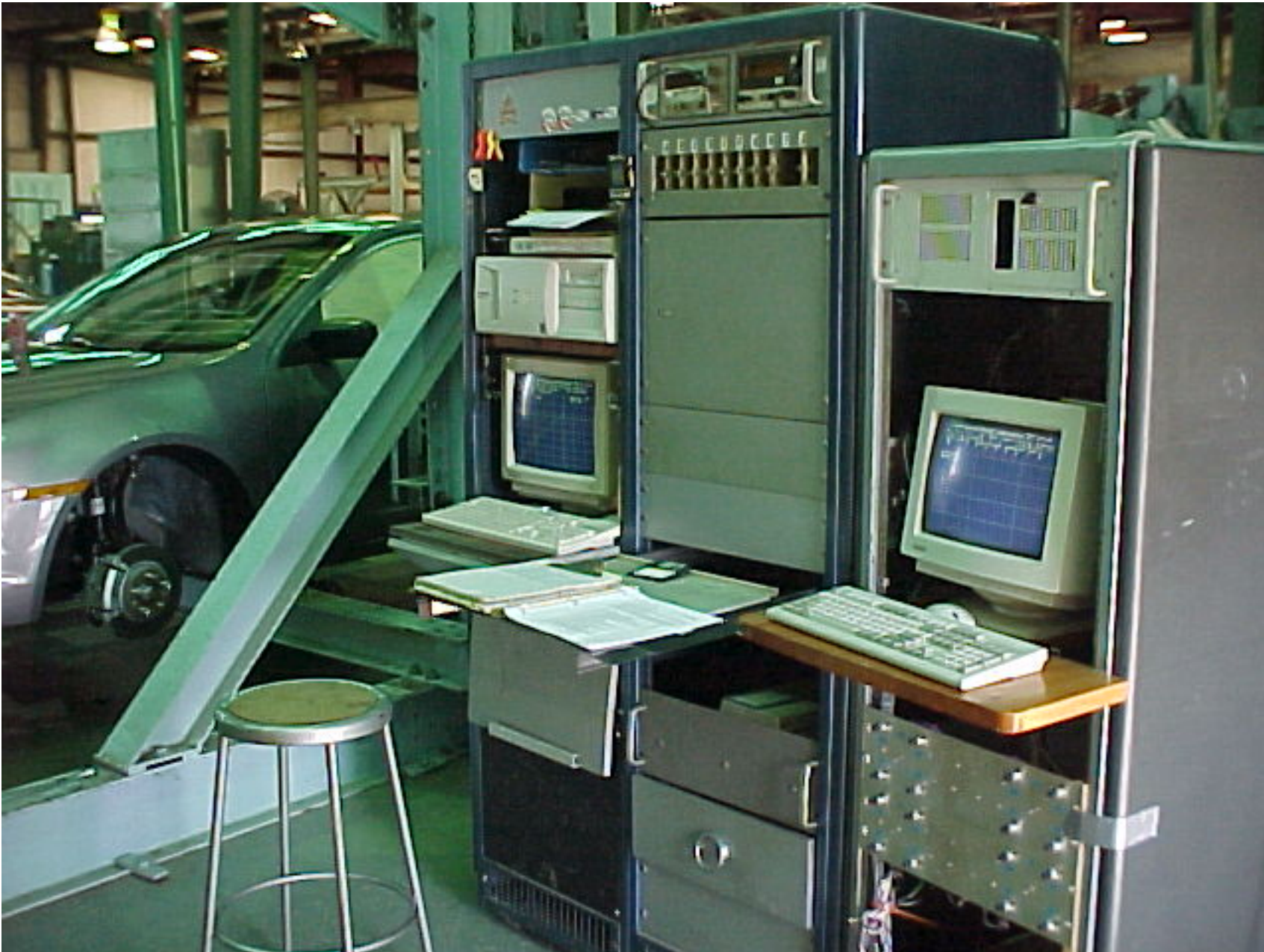
2006 FORD FUSION NHTSA NO. C60202 FMVSS NO. 214