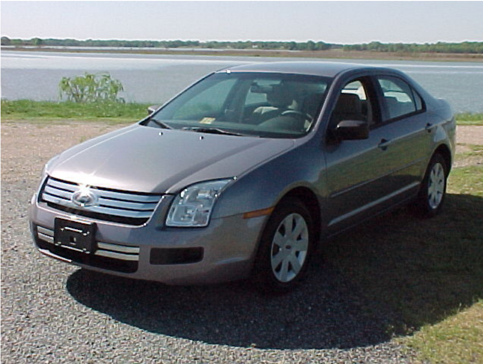
2006 FORD FUSION NHTSA NO. C60202 FMVSS NO. 214