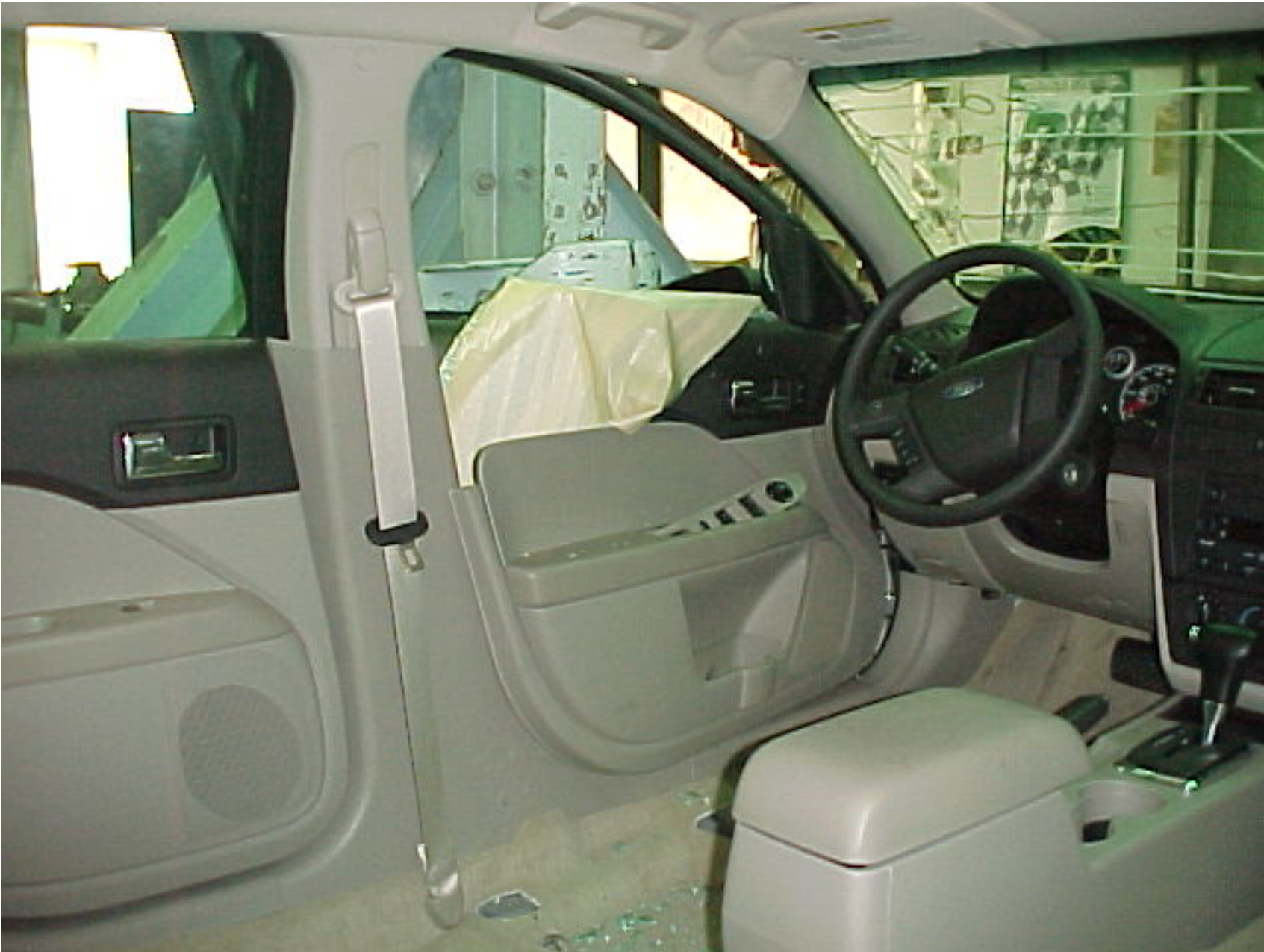
2006 FORD FUSION NHTSA NO. C60202 FMVSS NO. 214