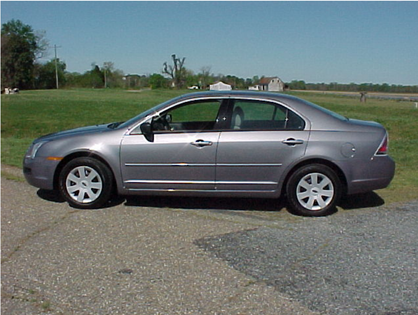
2006 FORD FUSION NHTSA NO. C60202 FMVSS NO. 214