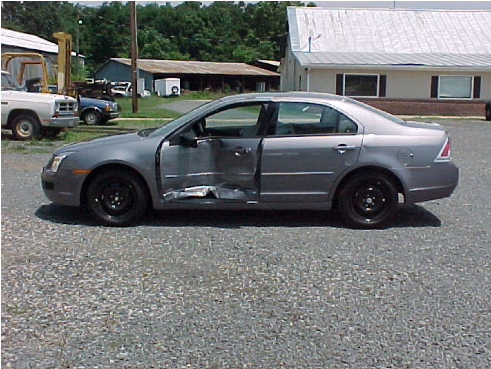
2006 FORD FUSION NHTSA NO. C60202 FMVSS NO. 214