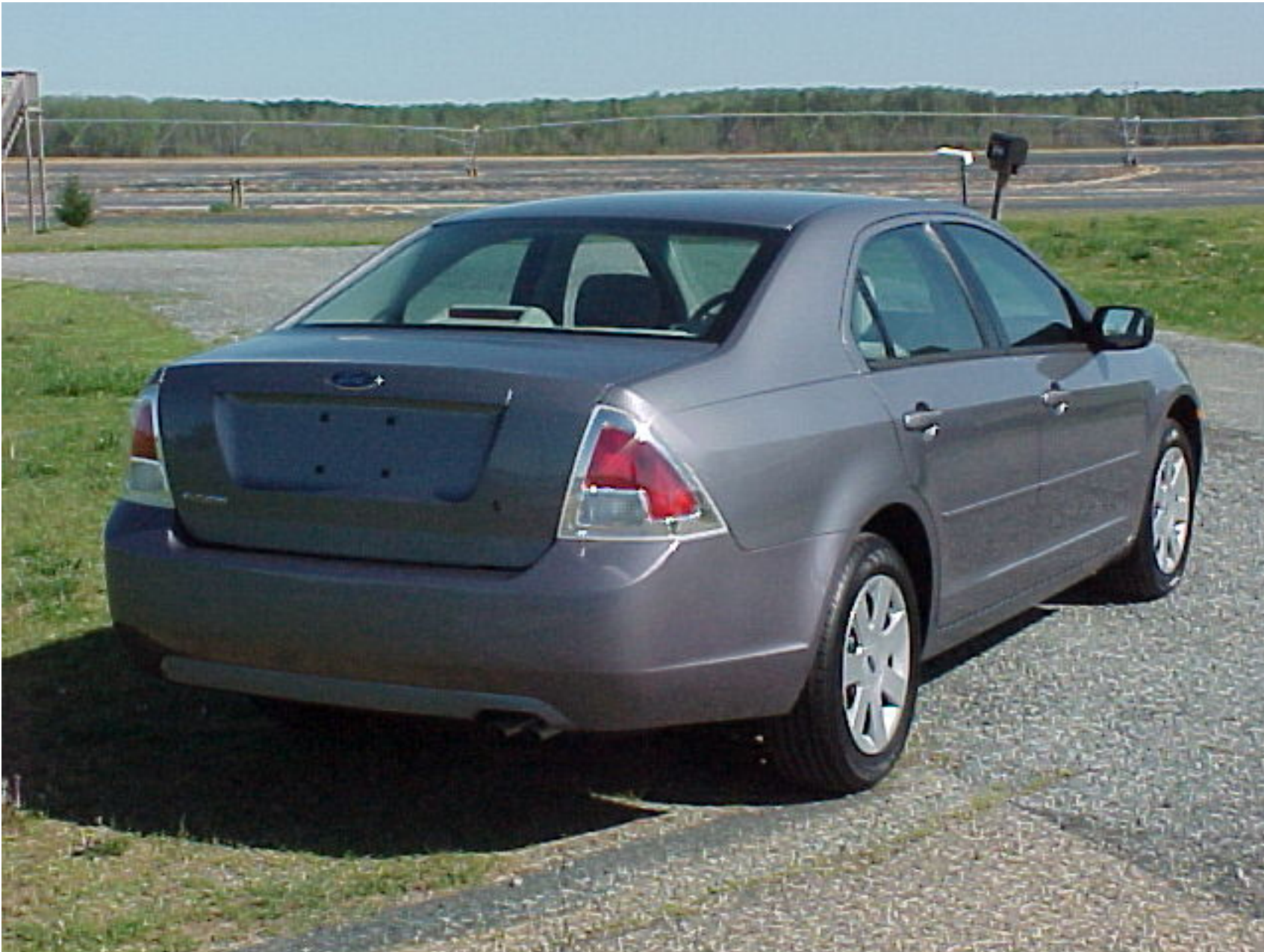
2006 FORD FUSION NHTSA NO. C60202 FMVSS NO. 214