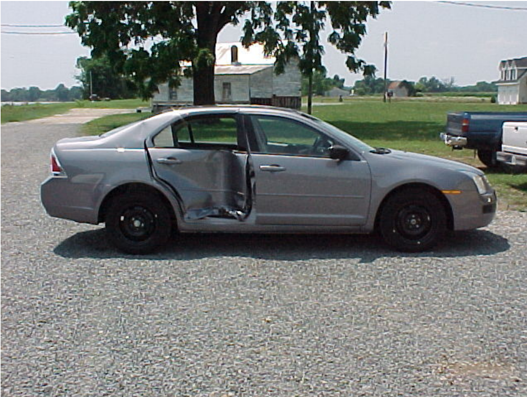
2006 FORD FUSION NHTSA NO. C60202 FMVSS NO. 214