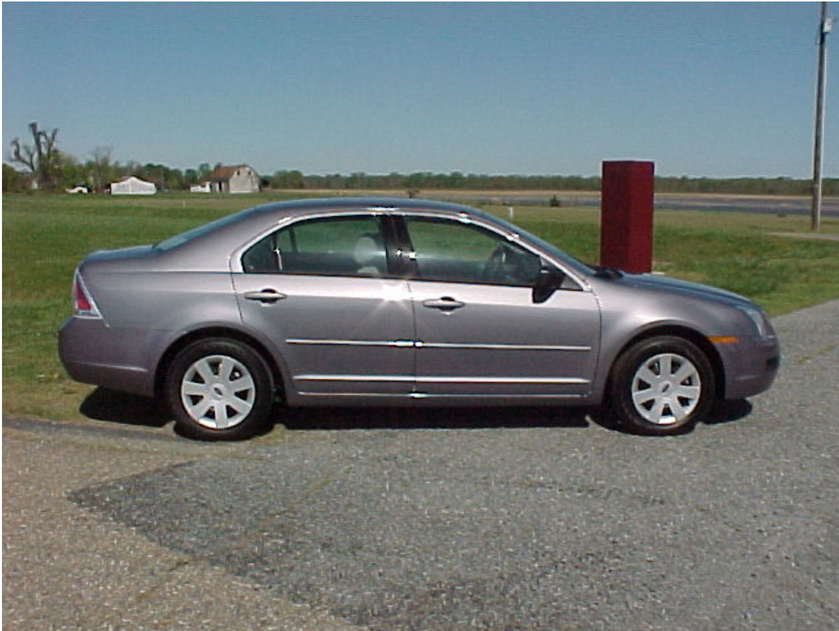
2006 FORD FUSION NHTSA NO. C60202 FMVSS NO. 214