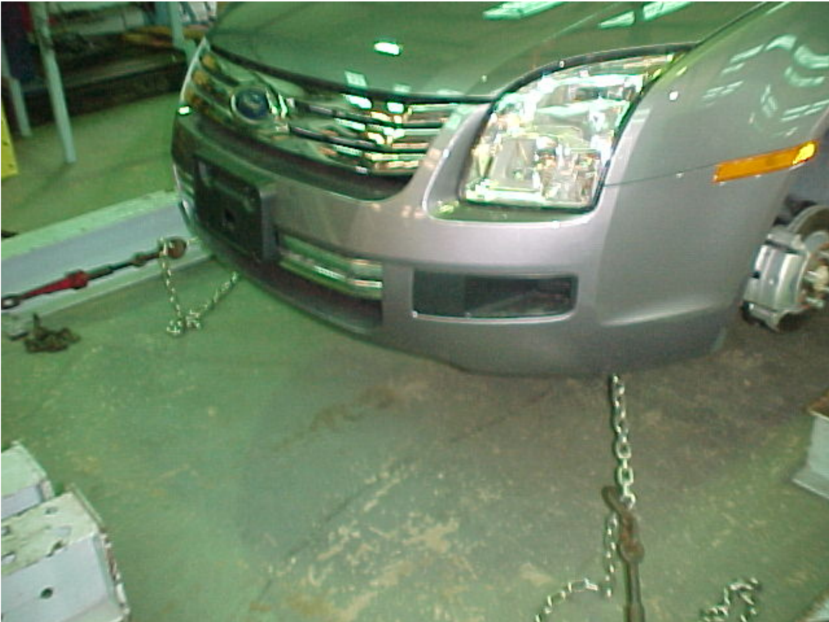
2006 FORD FUSION NHTSA NO. C60202 FMVSS NO. 214