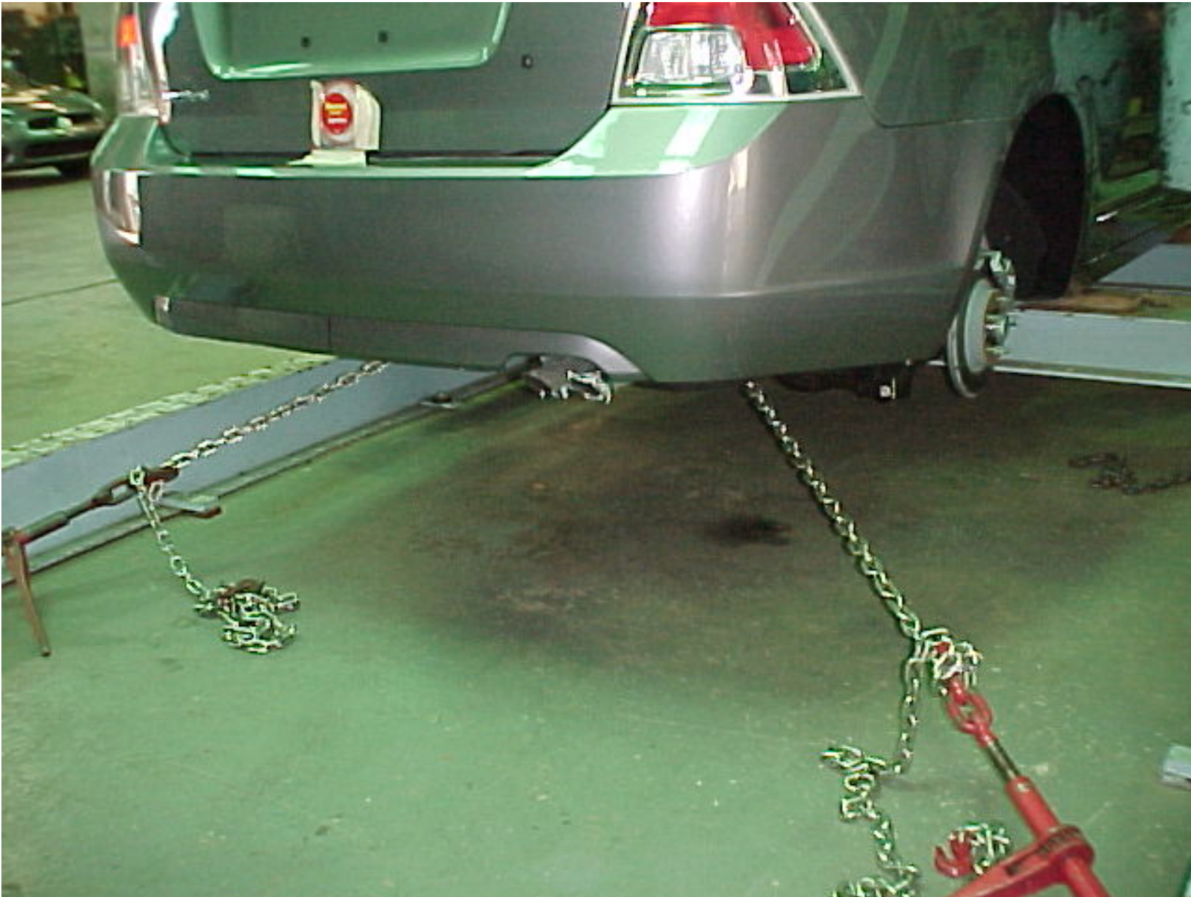
2006 FORD FUSION NHTSA NO. C60202 FMVSS NO. 214