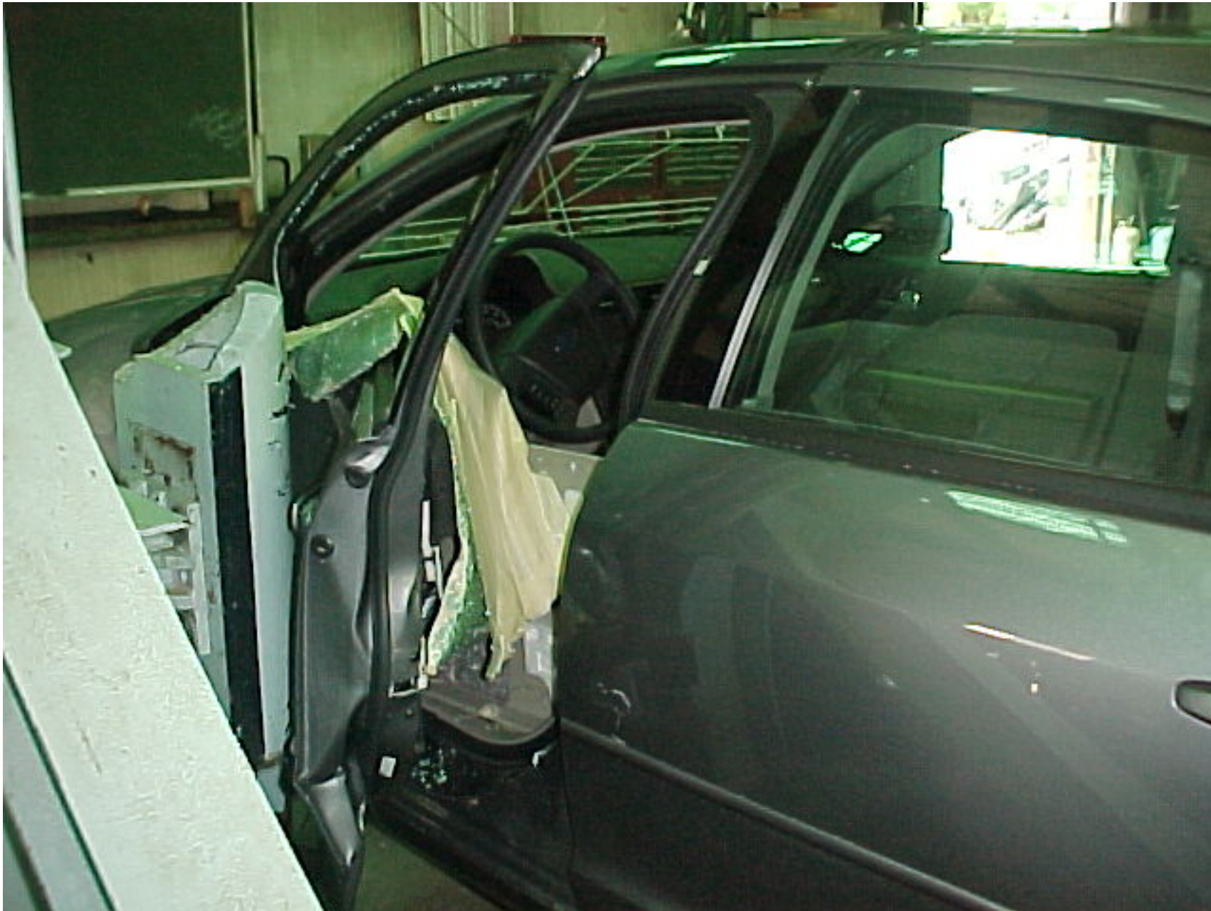
2006 FORD FUSION NHTSA NO. C60202 FMVSS NO. 214