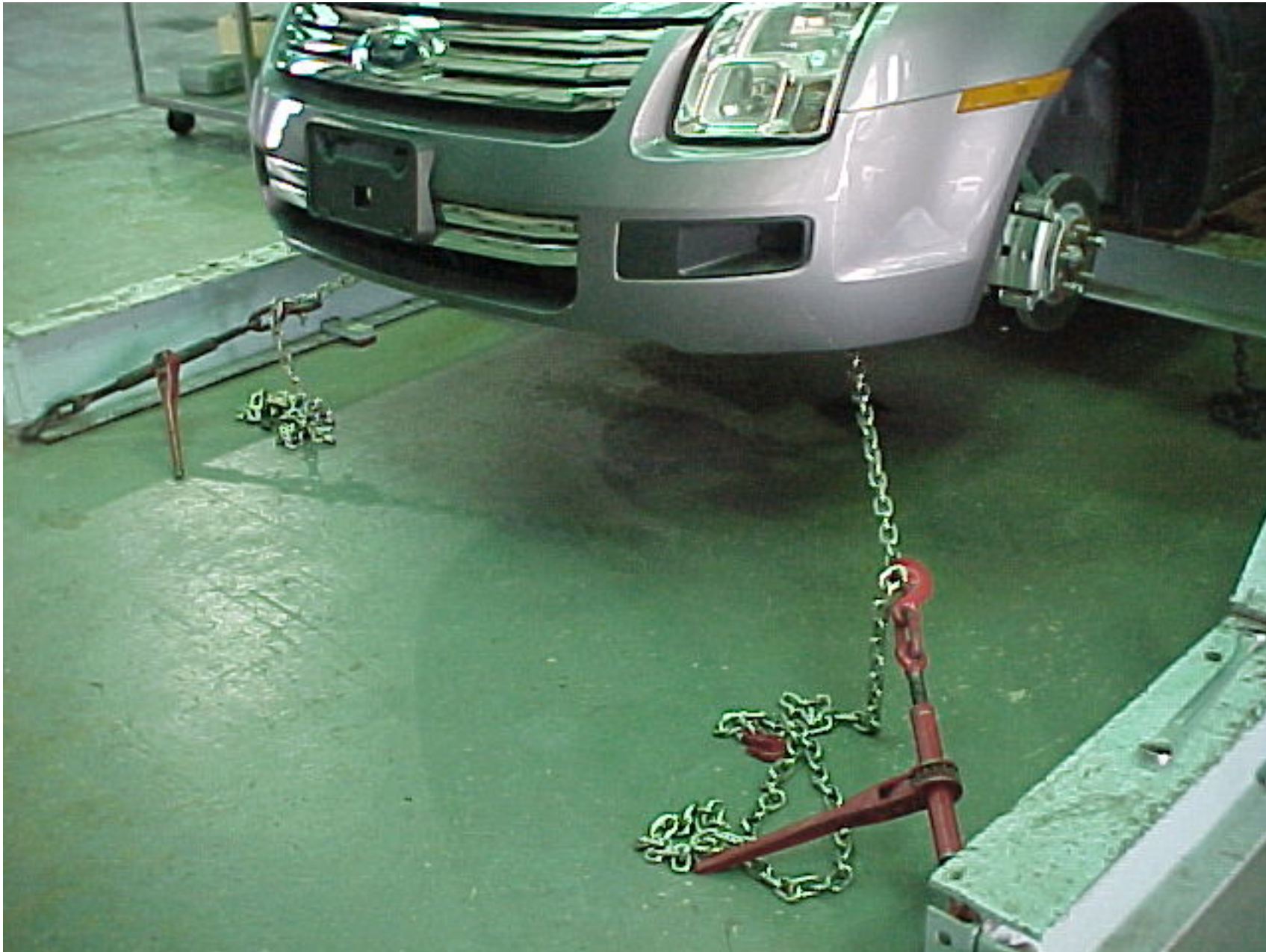
2006 FORD FUSION NHTSA NO. C60202 FMVSS NO. 214