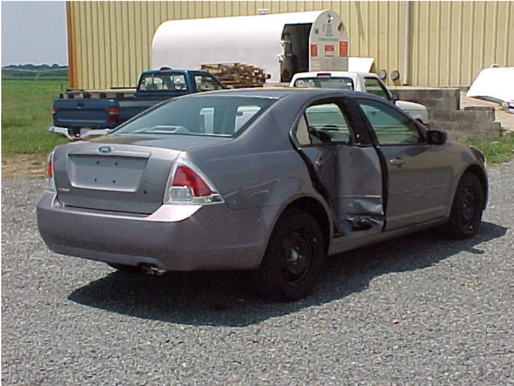
2006 FORD FUSION NHTSA NO. C60202 FMVSS NO. 214