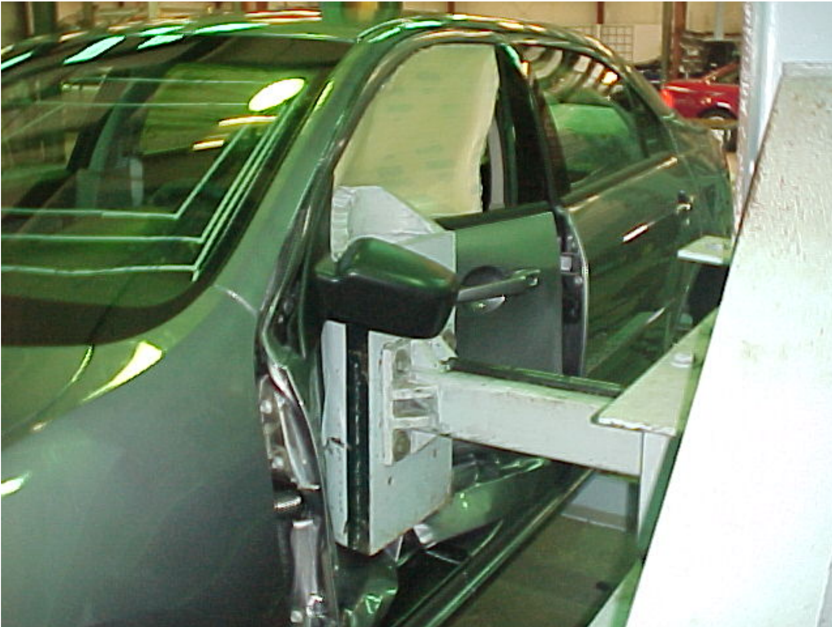
2006 FORD FUSION NHTSA NO. C60202 FMVSS NO. 214