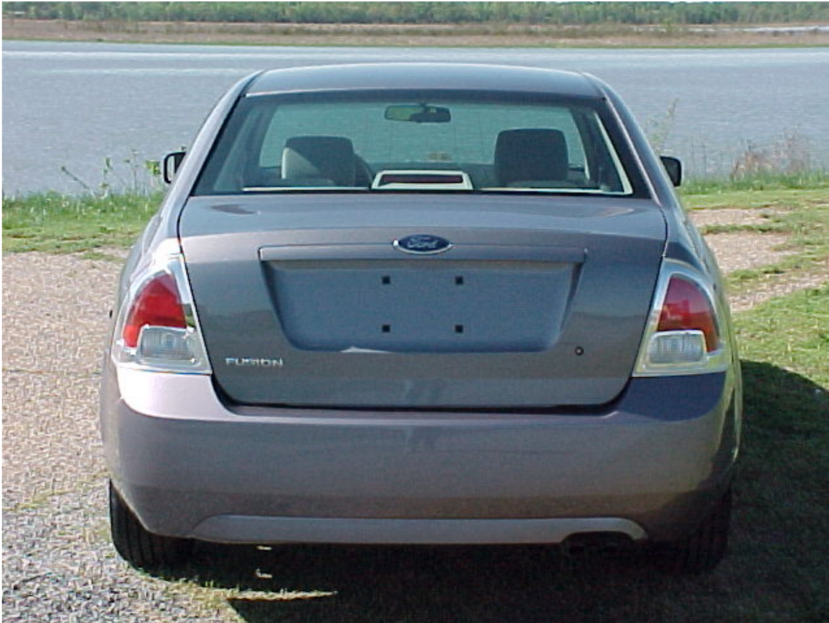
2006 FORD FUSION NHTSA NO. C60202 FMVSS NO. 214