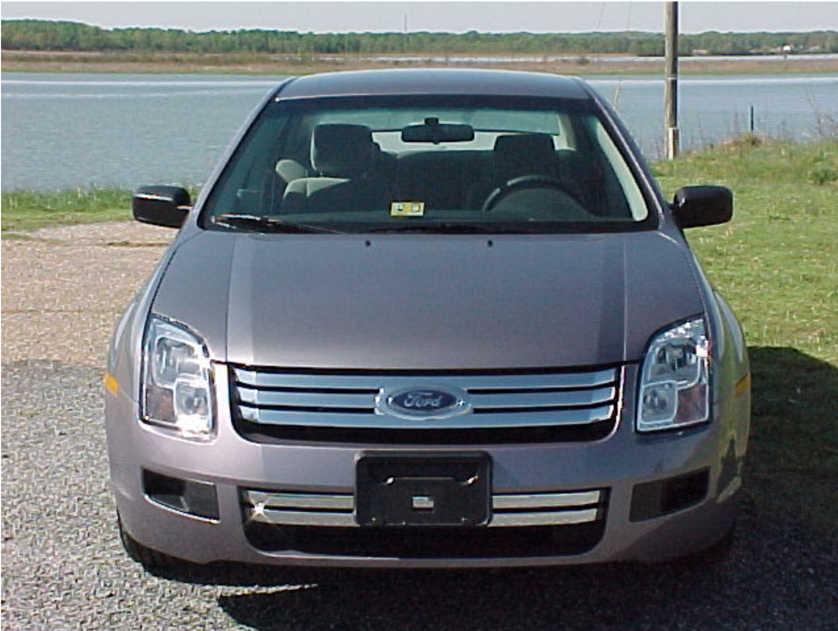
2006 FORD FUSION NHTSA NO. C60202 FMVSS NO. 214