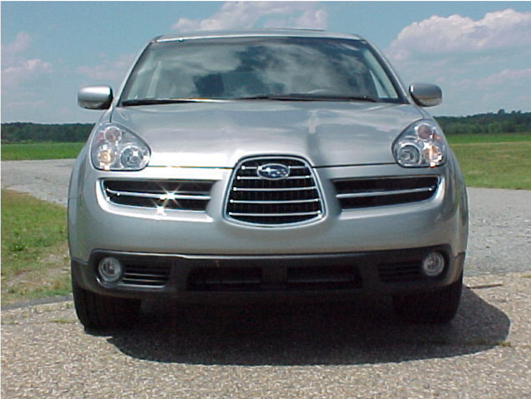
2006 SUBARU B9 TRIBECA NHTSA NO. C65501 FMVSS NO. 214S