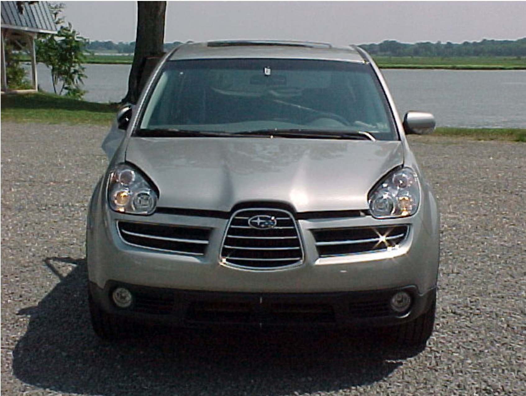
2006 SUBARU B9 TRIBECA NHTSA NO. C65501 FMVSS NO. 214S