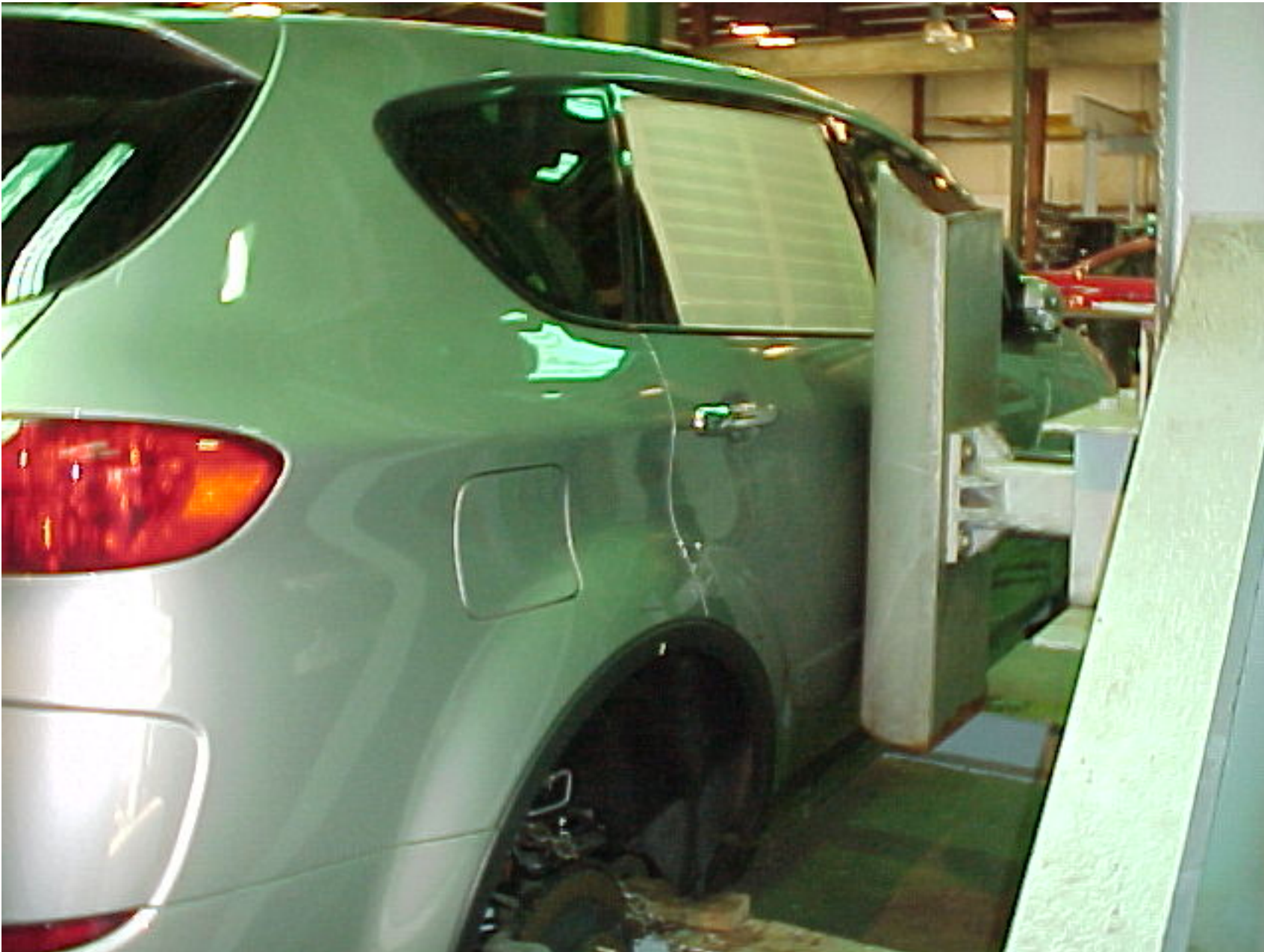
2006 SUBARU B9 TRIBECA NHTSA NO. C65501 FMVSS NO. 214S