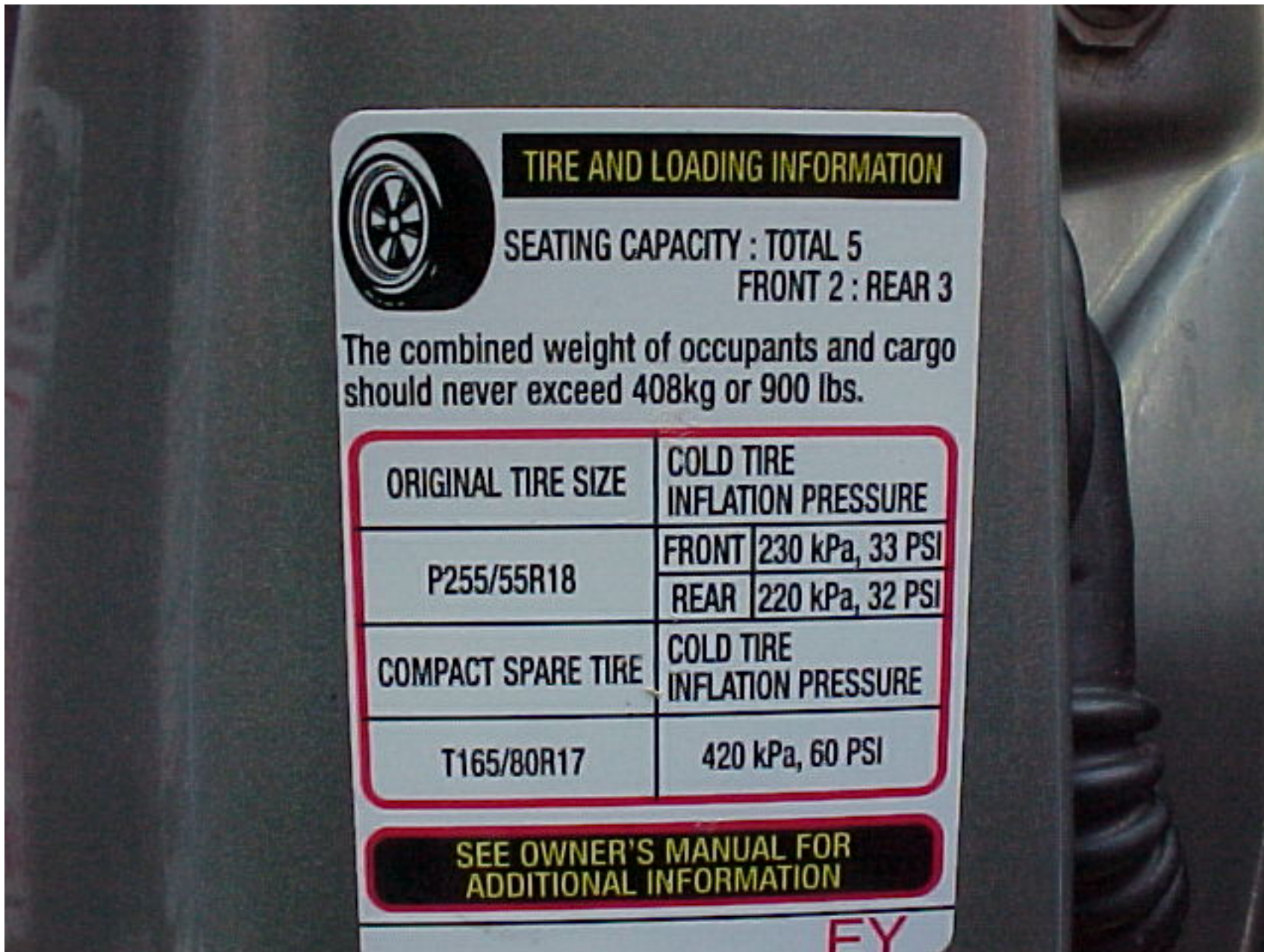
2006 SUBARU B9 TRIBECA NHTSA NO. C65501 FMVSS NO. 214S