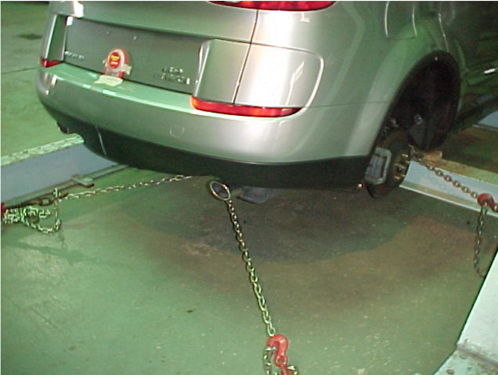
2006 SUBARU B9 TRIBECA NHTSA NO. C65501 FMVSS NO. 214S