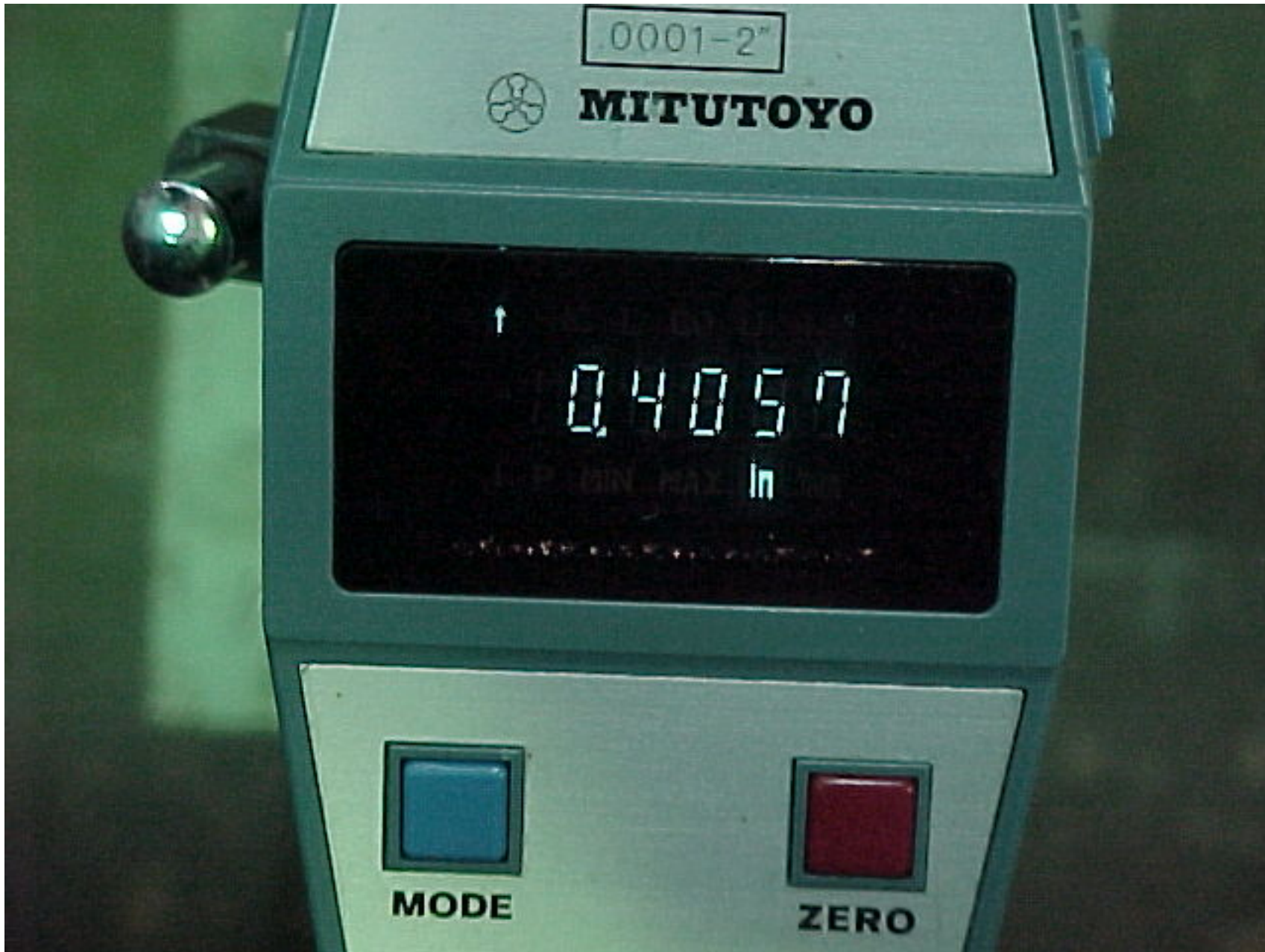
2006 SUBARU B9 TRIBECA NHTSA NO. C65501 FMVSS NO. 214S