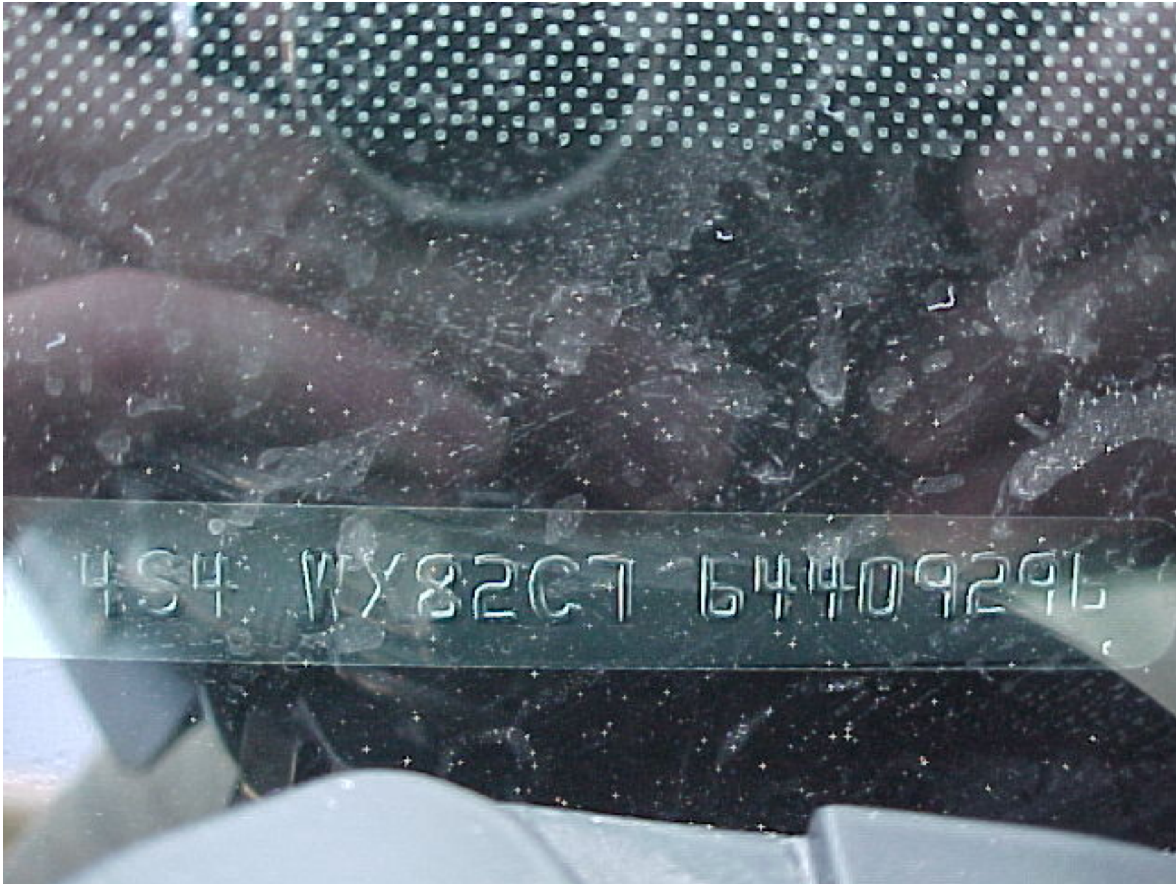
2006 SUBARU B9 TRIBECA NHTSA NO. C65501 FMVSS NO. 214S