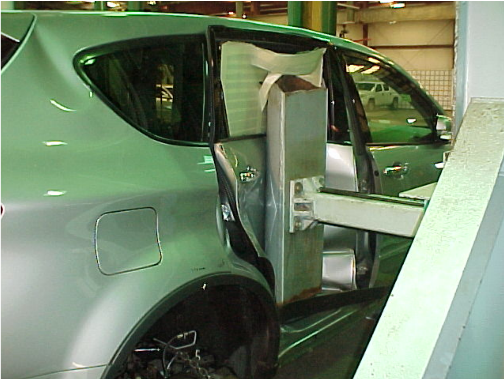
2006 SUBARU B9 TRIBECA NHTSA NO. C65501 FMVSS NO. 214S