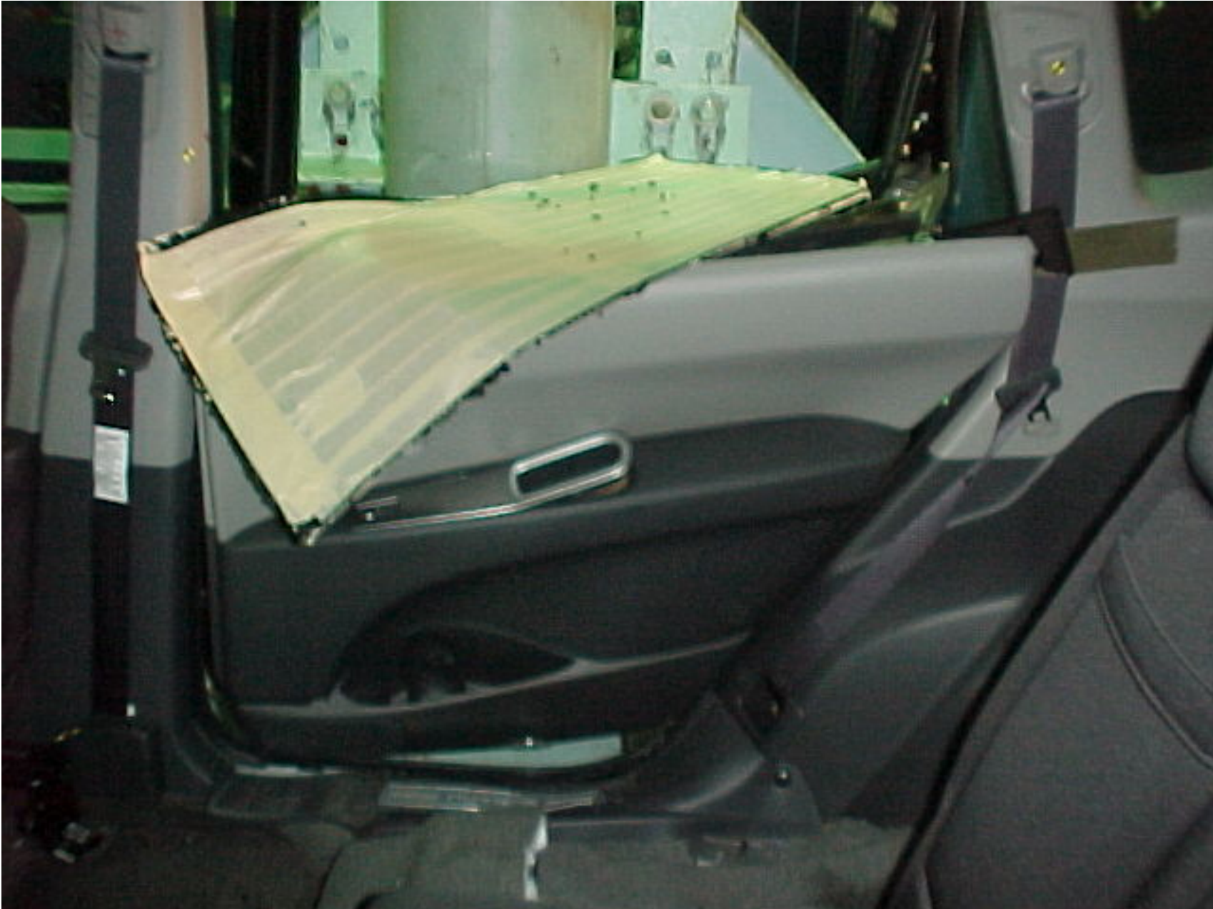
2006 SUBARU B9 TRIBECA NHTSA NO. C65501 FMVSS NO. 214S