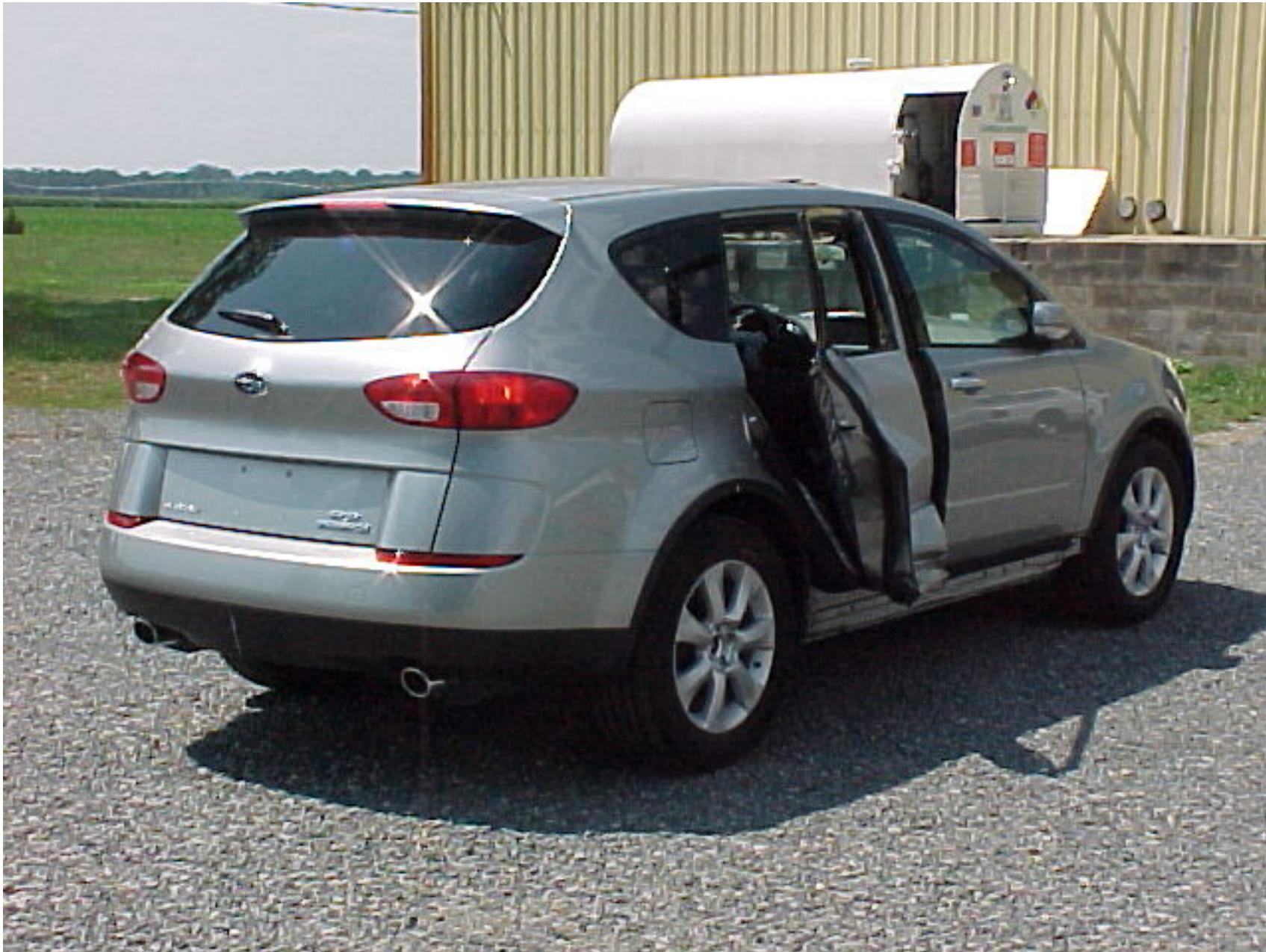
2006 SUBARU B9 TRIBECA NHTSA NO. C65501 FMVSS NO. 214S