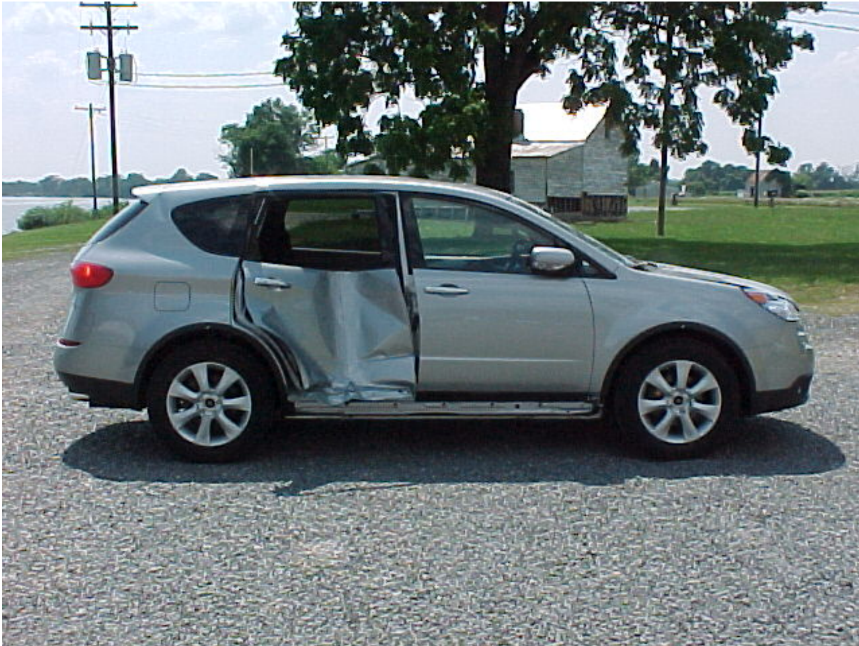
2006 SUBARU B9 TRIBECA NHTSA NO. C65501 FMVSS NO. 214S