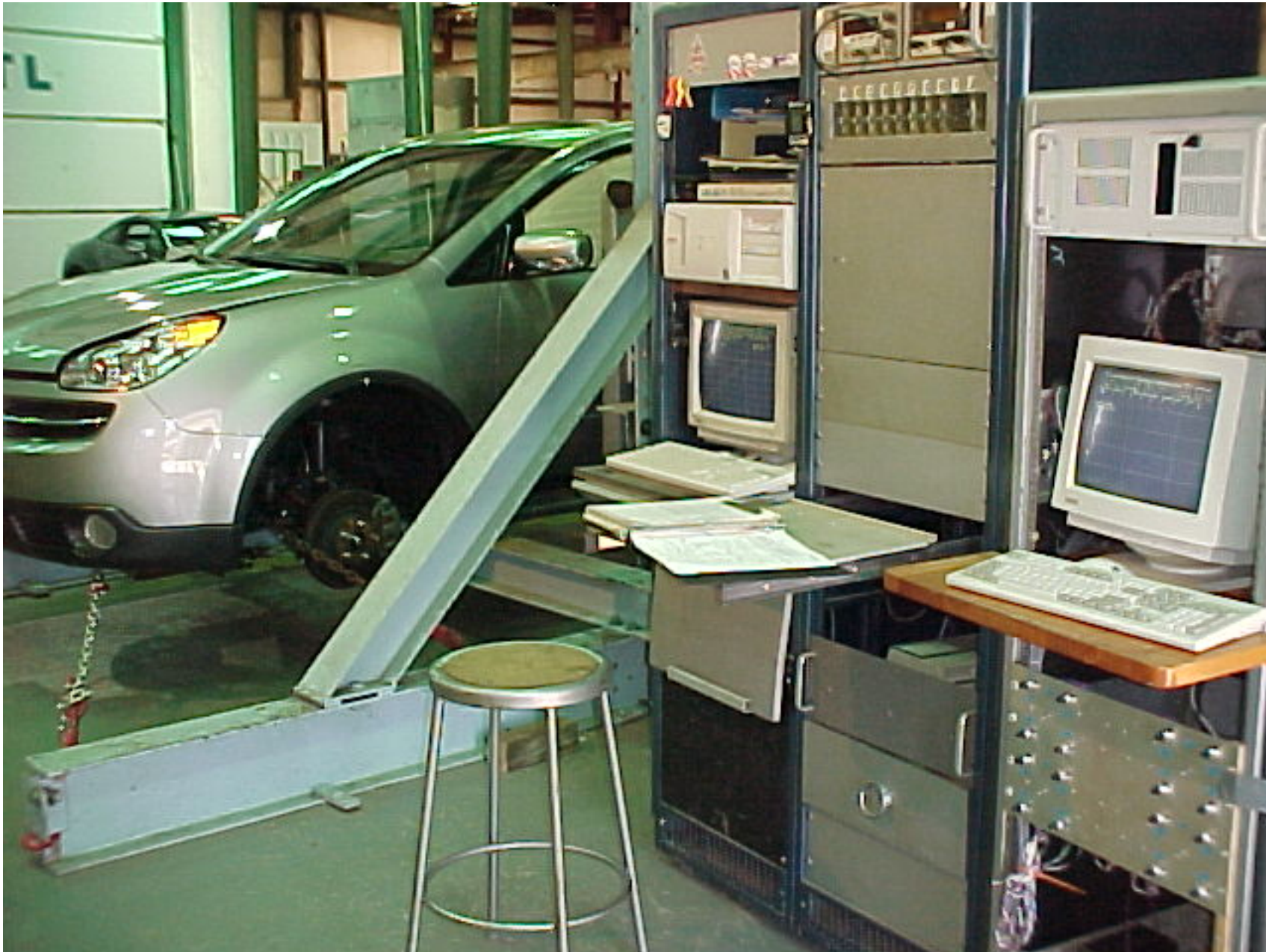
2006 SUBARU B9 TRIBECA NHTSA NO. C65501 FMVSS NO. 214S