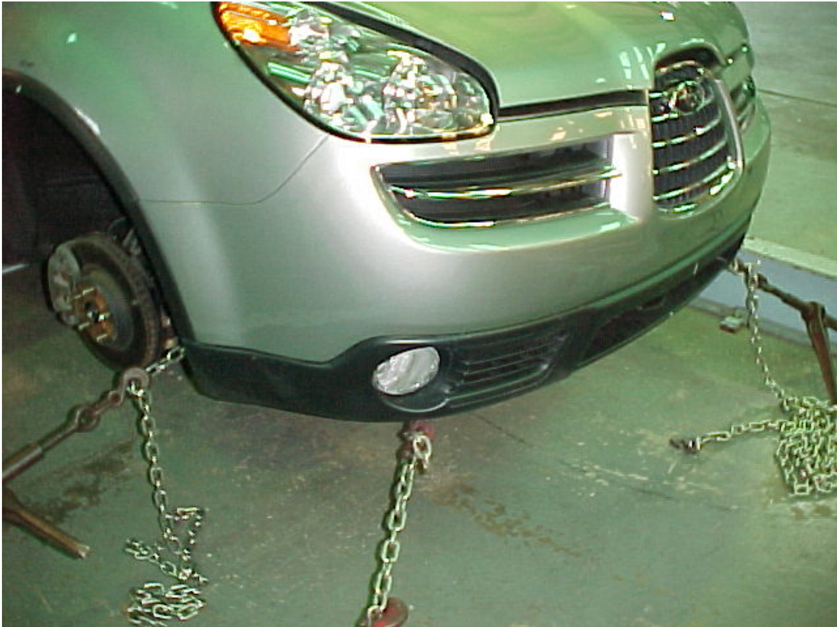
2006 SUBARU B9 TRIBECA NHTSA NO. C65501 FMVSS NO. 214S