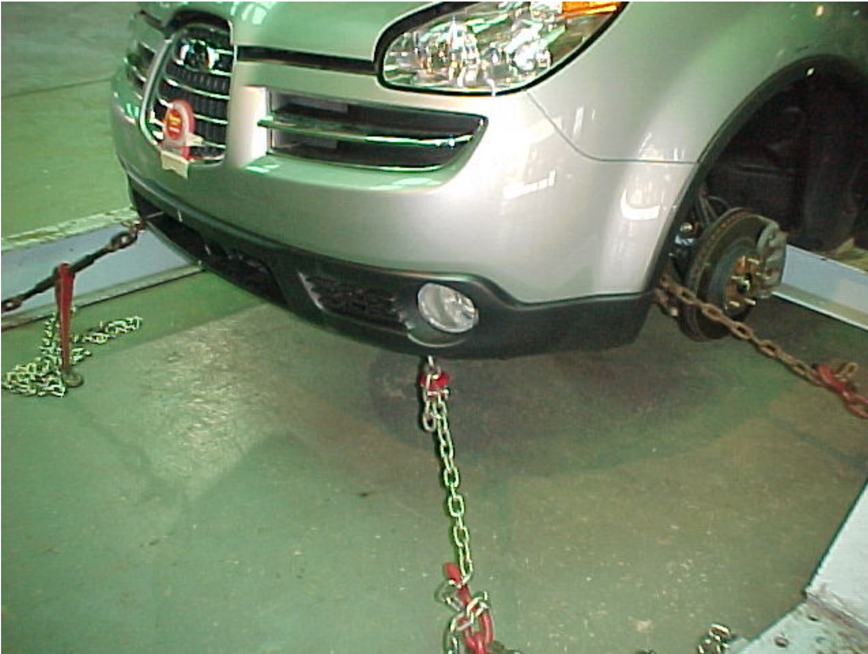
2006 SUBARU B9 TRIBECA NHTSA NO. C65501 FMVSS NO. 214S