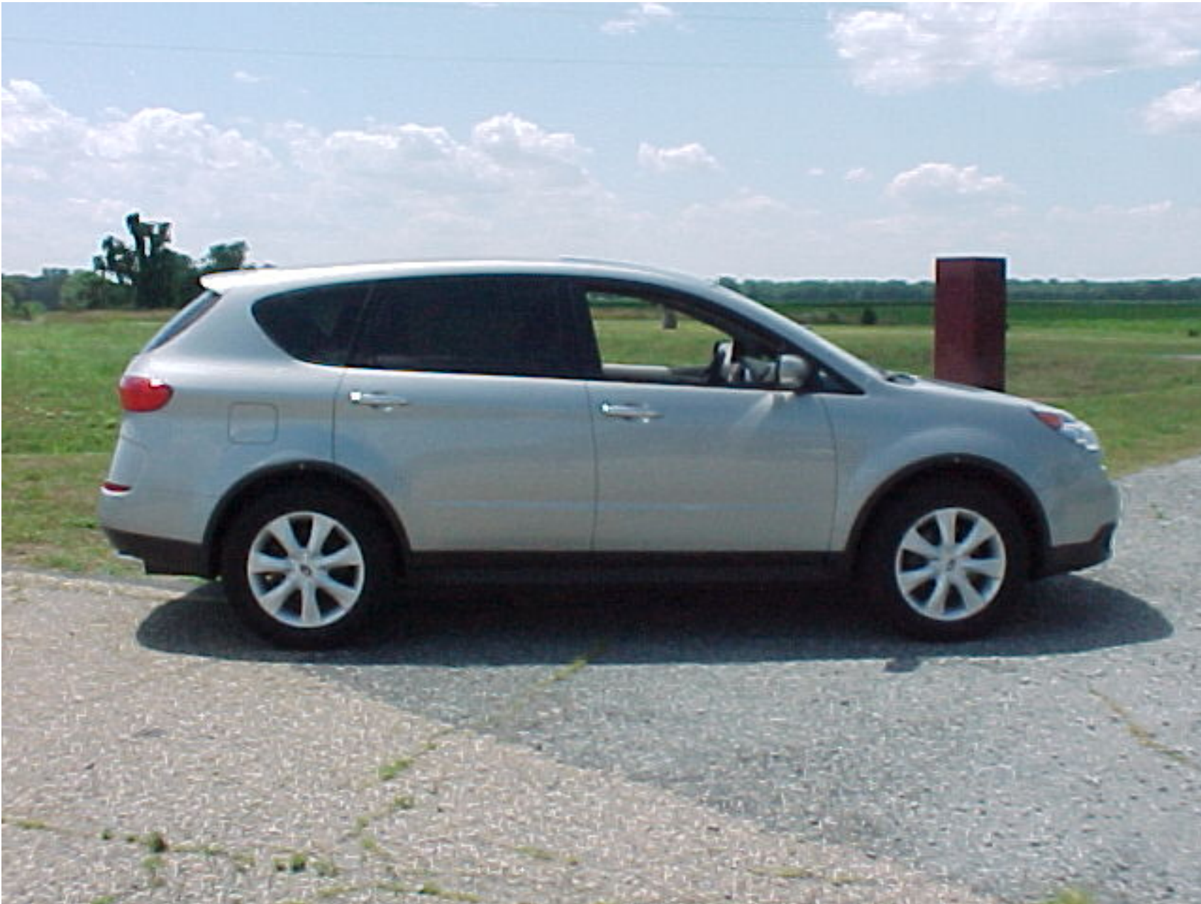
2006 SUBARU B9 TRIBECA NHTSA NO. C65501 FMVSS NO. 214S