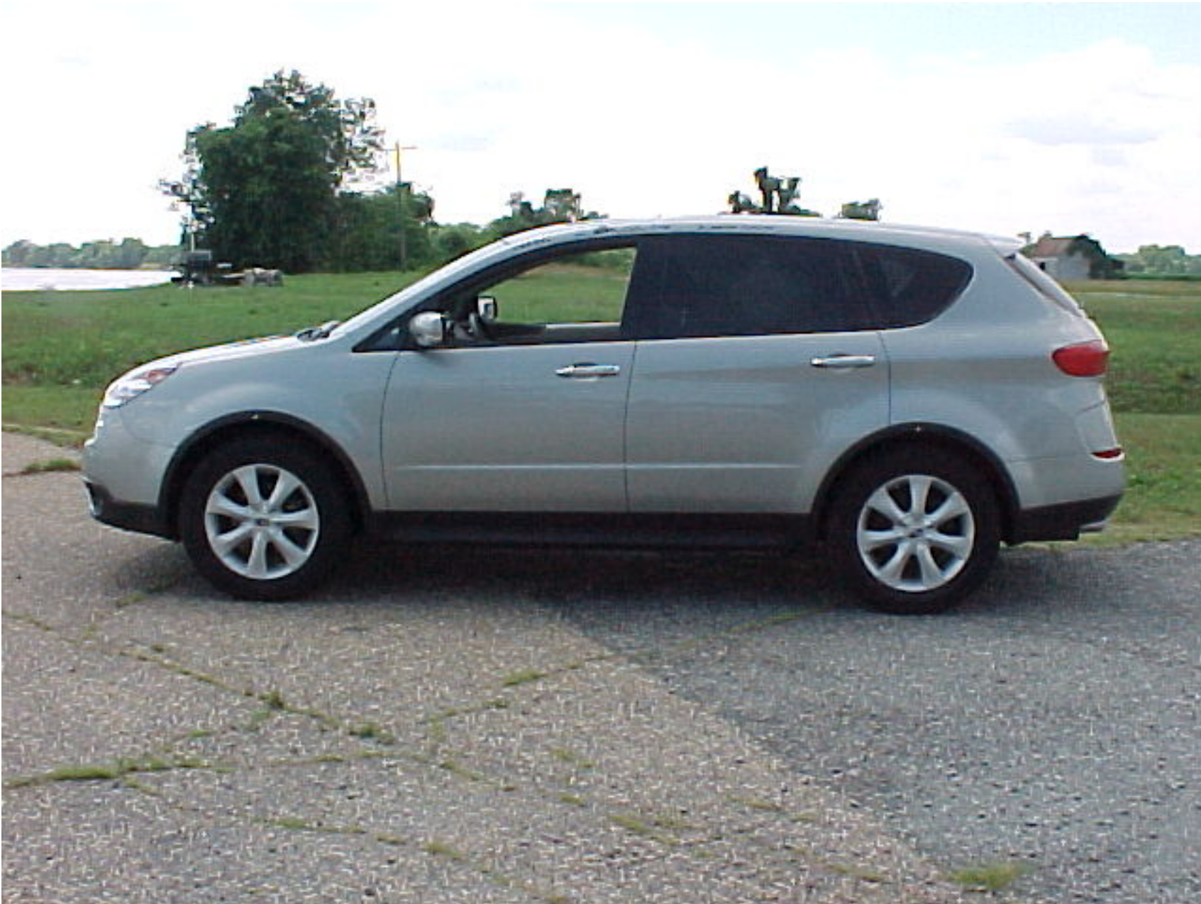
2006 SUBARU B9 TRIBECA NHTSA NO. C65501 FMVSS NO. 214S