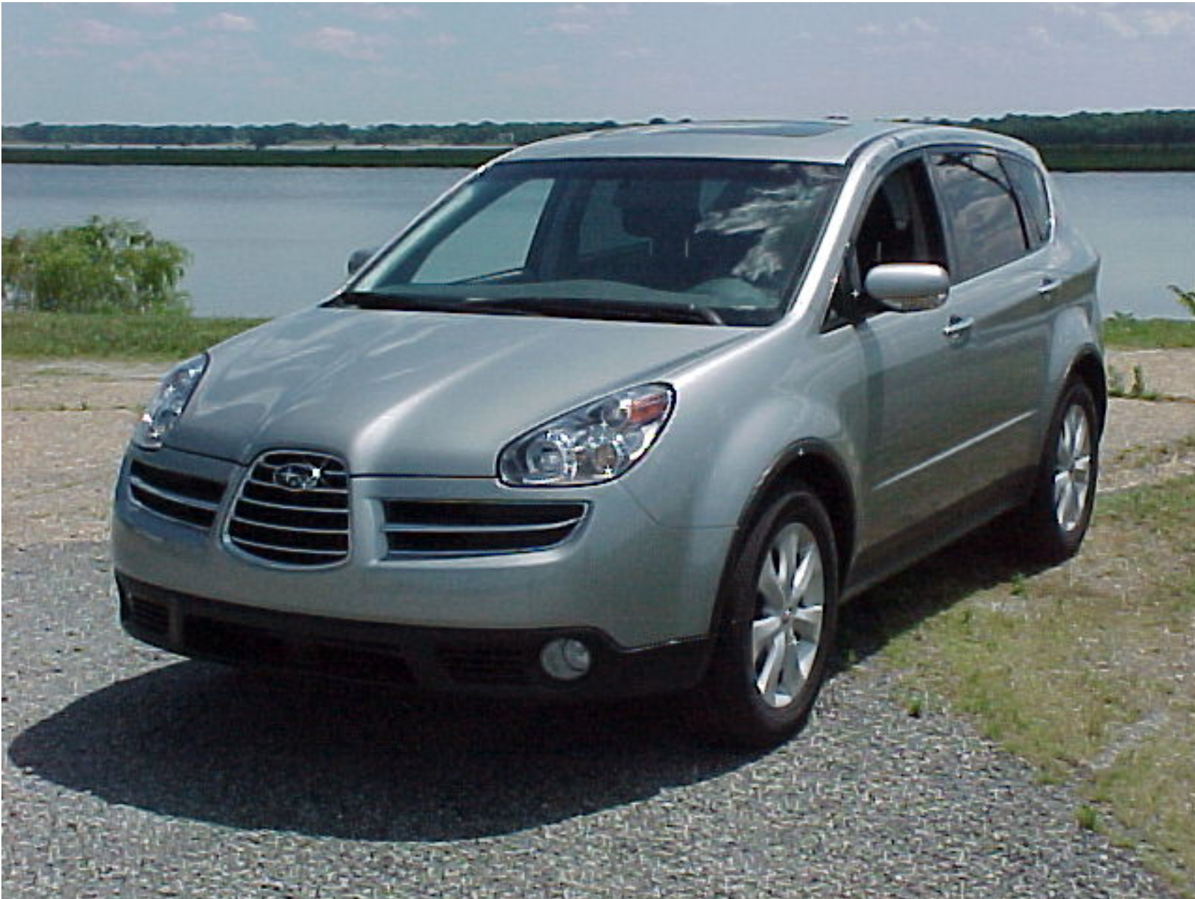
2006 SUBARU B9 TRIBECA NHTSA NO. C65501 FMVSS NO. 214S