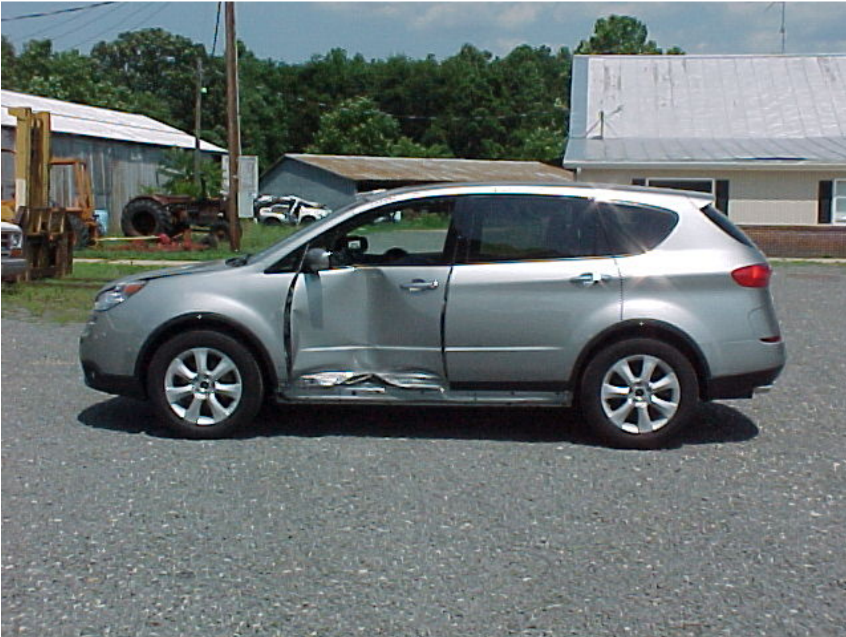
2006 SUBARU B9 TRIBECA NHTSA NO. C65501 FMVSS NO. 214S