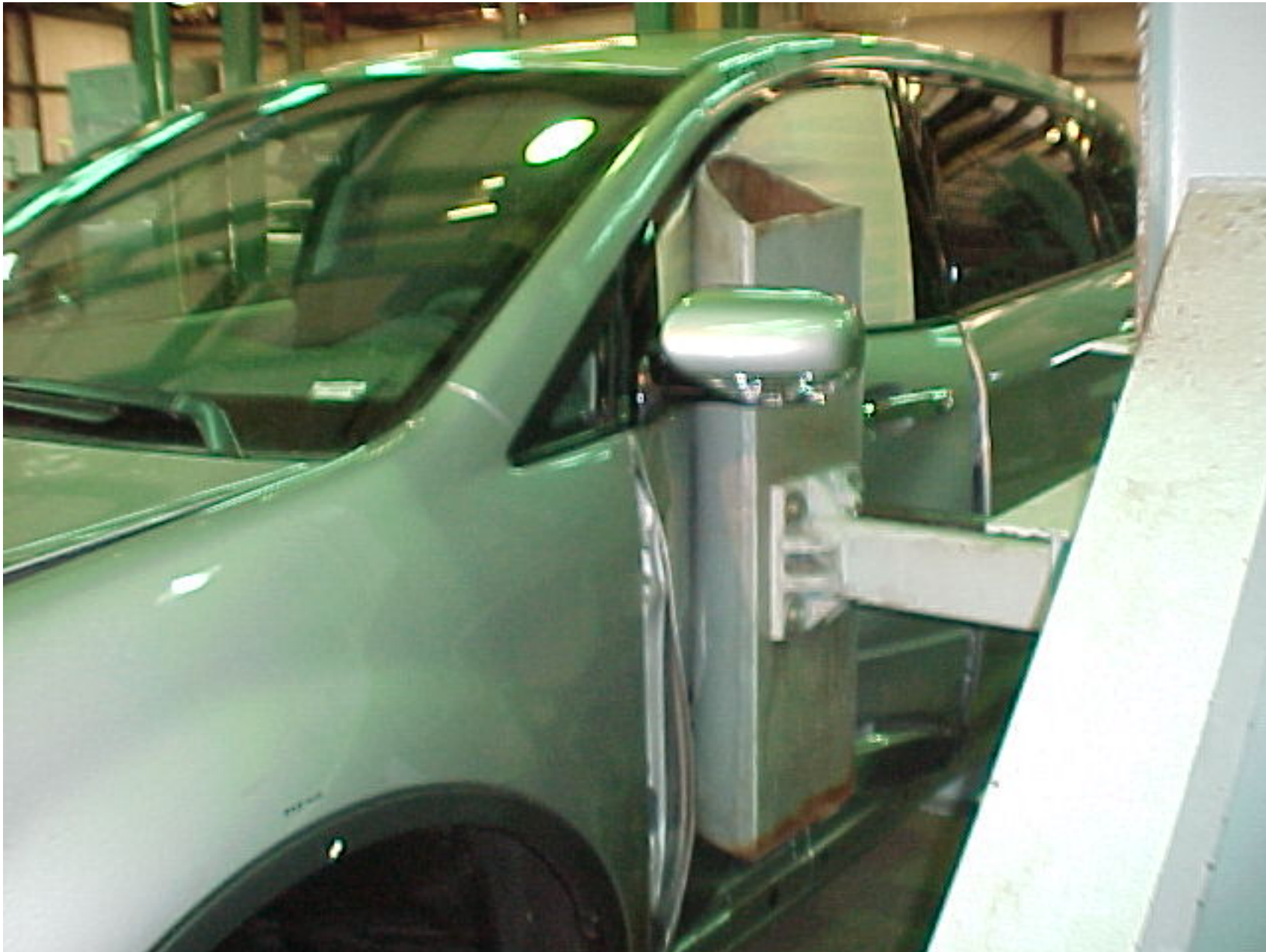
2006 SUBARU B9 TRIBECA NHTSA NO. C65501 FMVSS NO. 214S