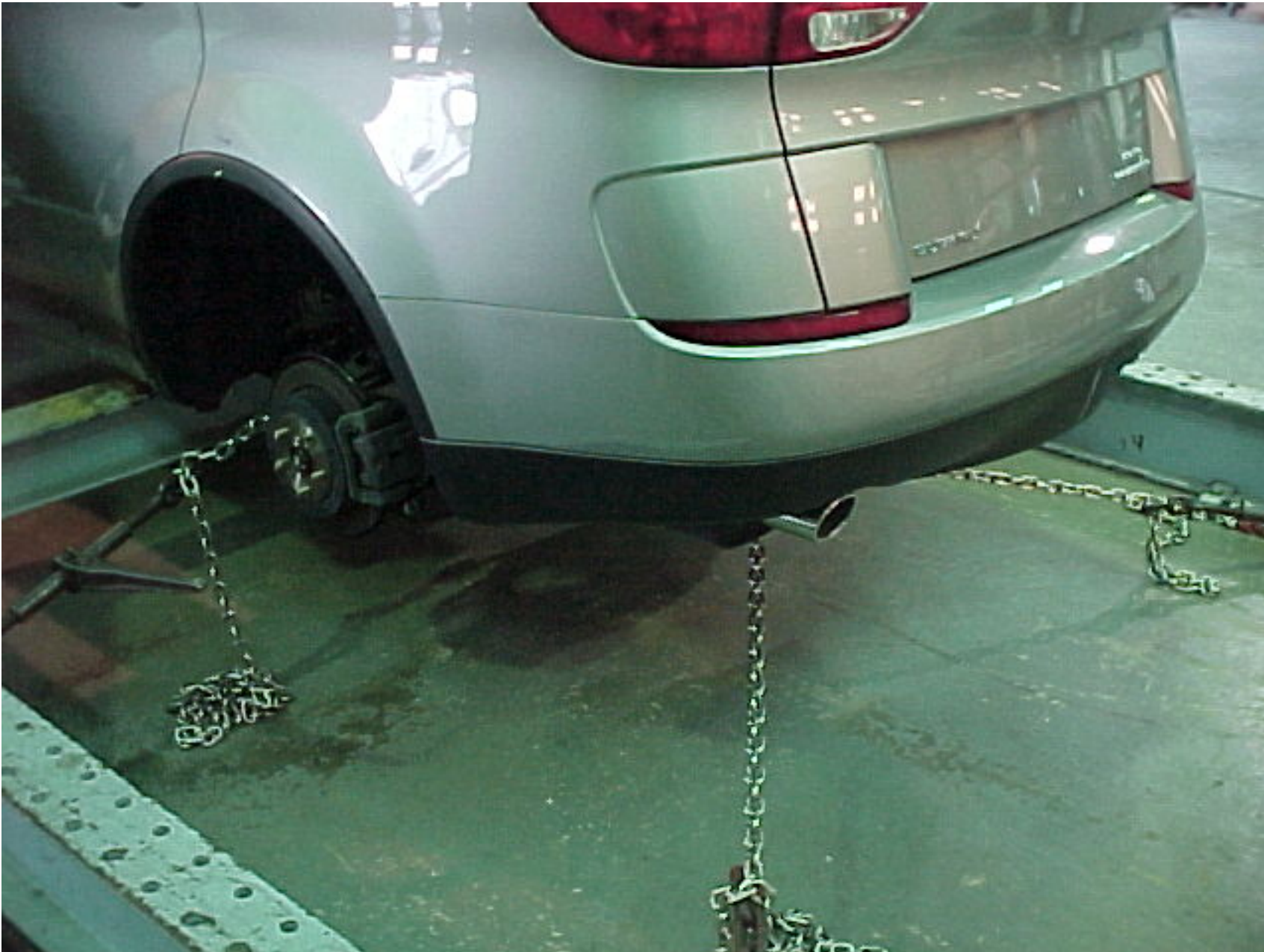
2006 SUBARU B9 TRIBECA NHTSA NO. C65501 FMVSS NO. 214S