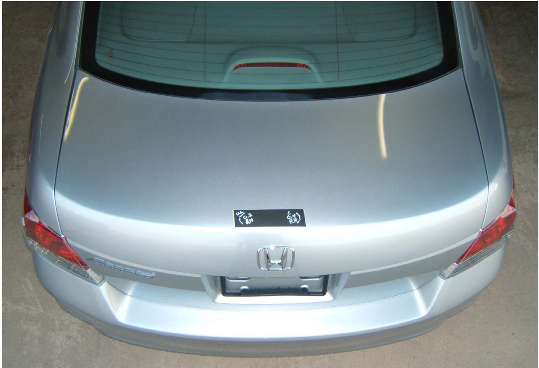
2008 HONDA ACCORD NHTSA NO. C85306 FMVSS NO. 401