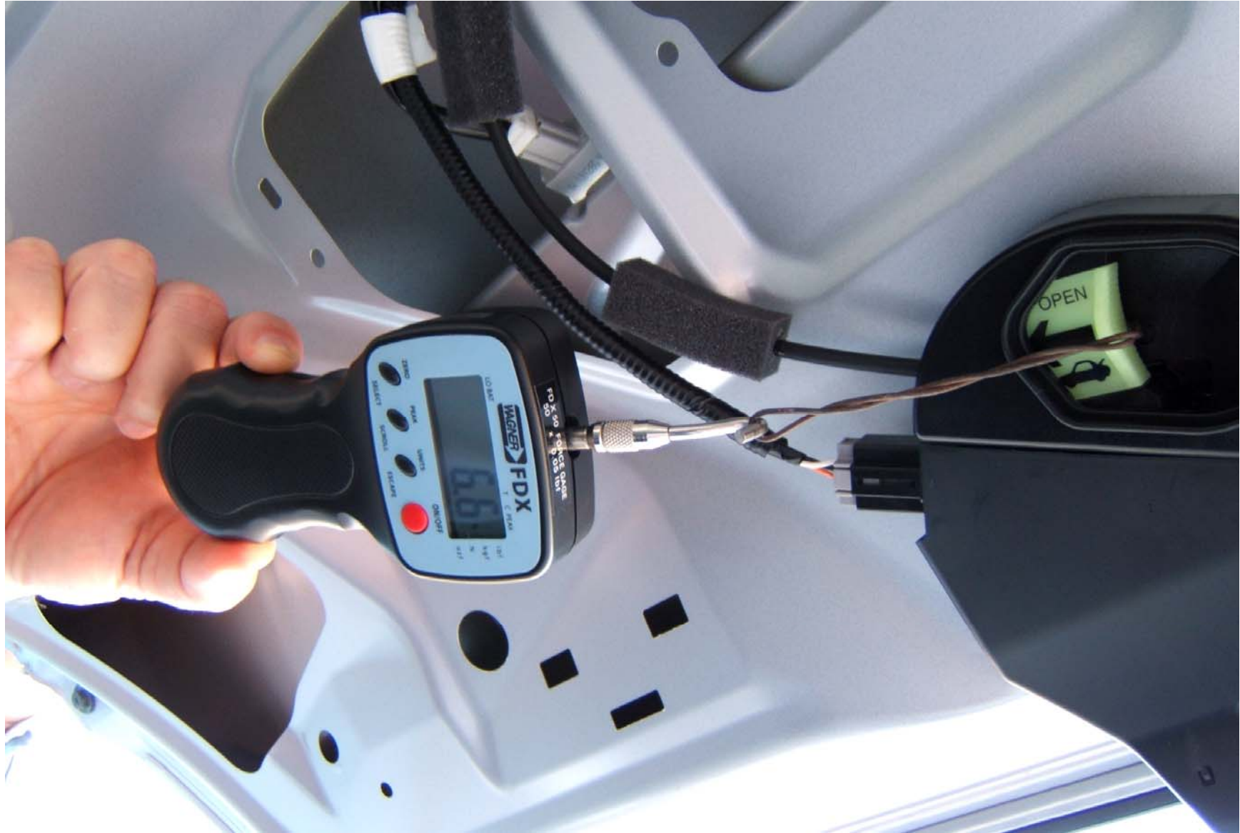
2008 HONDA ACCORD NHTSA NO. C85306 FMVSS NO. 401