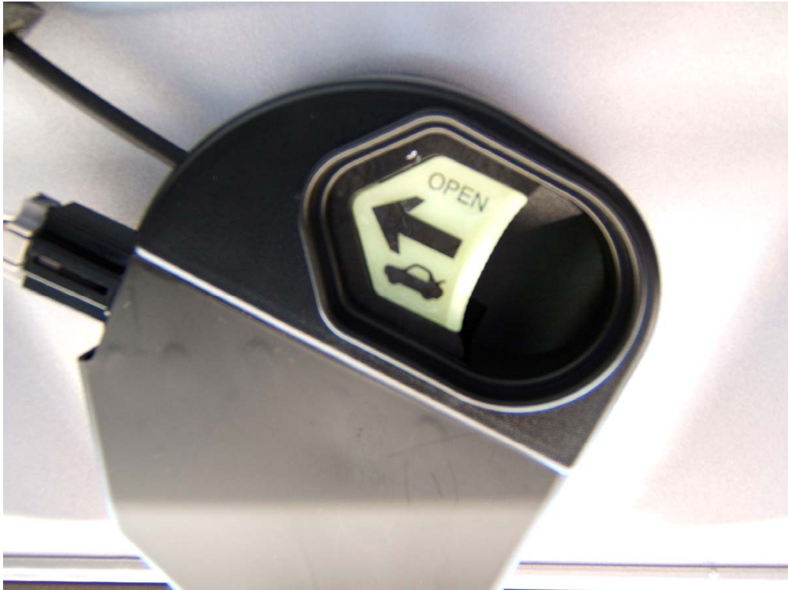
2008 HONDA ACCORD NHTSA NO. C85306 FMVSS NO. 401