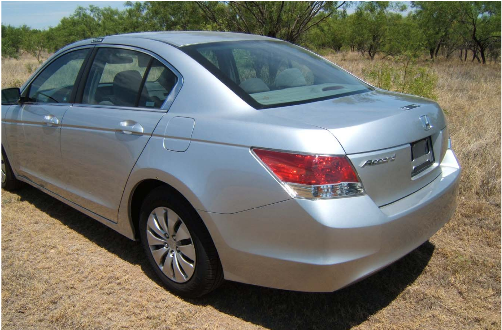
2008 HONDA ACCORD NHTSA NO. C85306 FMVSS NO. 401