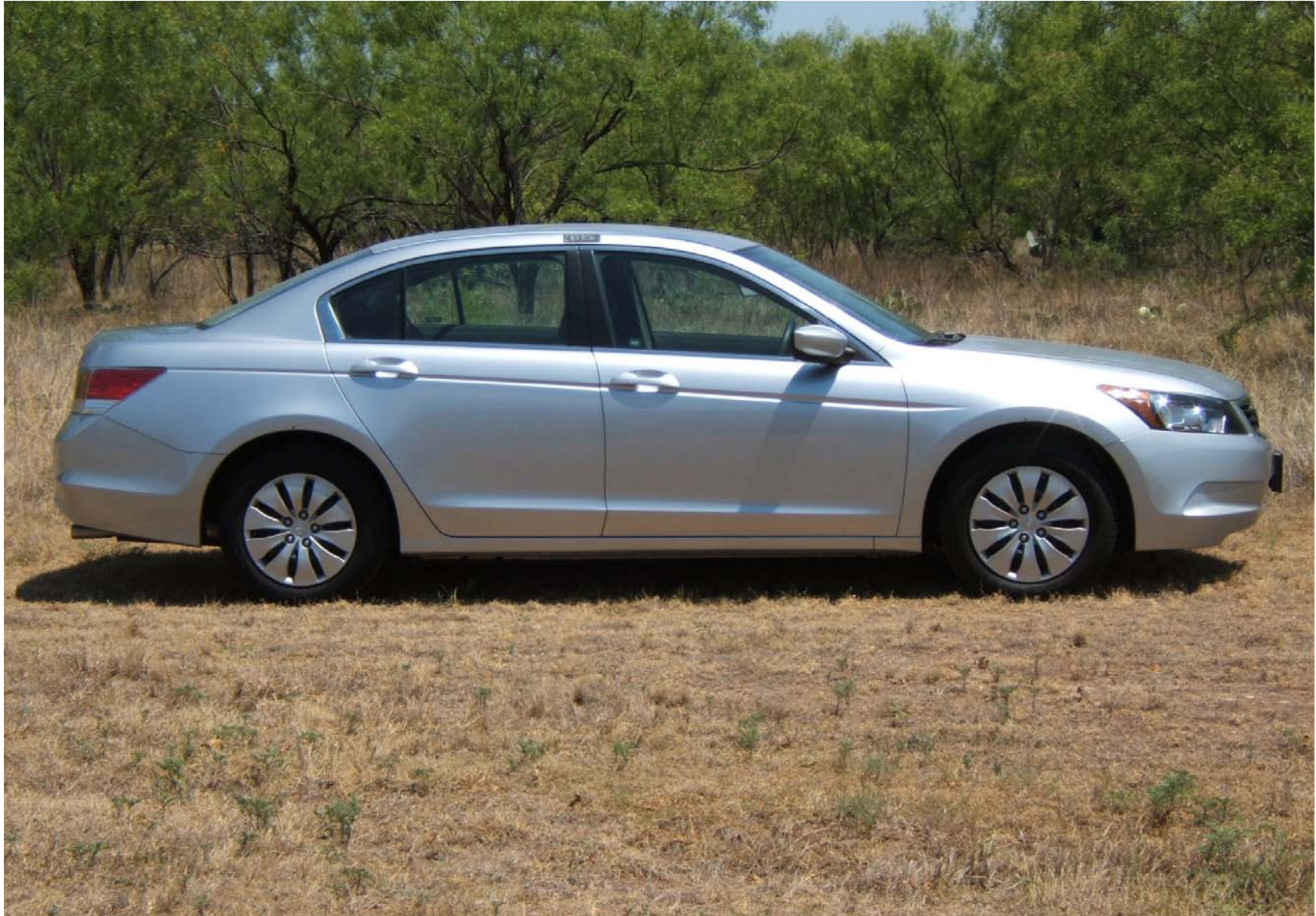
2008 HONDA ACCORD NHTSA NO. C85306 FMVSS NO. 401