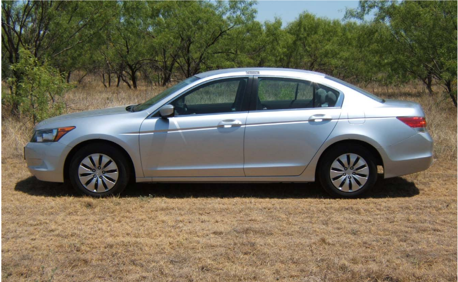
2008 HONDA ACCORD NHTSA NO. C85306 FMVSS NO.401