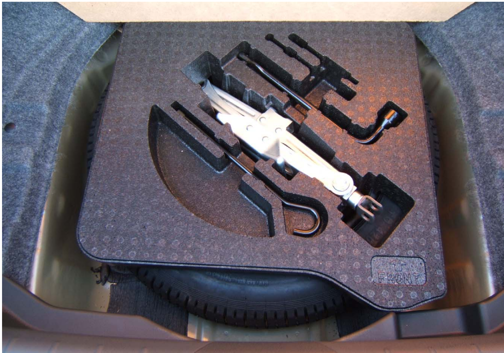
2008 HONDA ACCORD NHTSA NO. C85306 FMVSS NO. 401