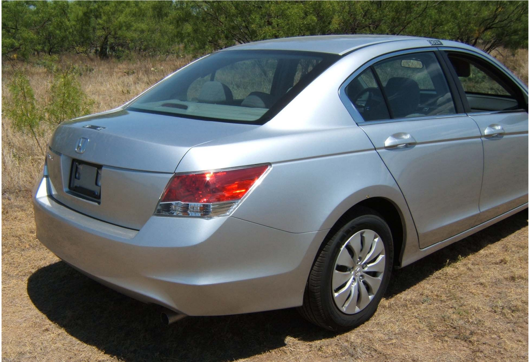
2008 HONDA ACCORD NHTSA NO. C85306 FMVSS NO. 401