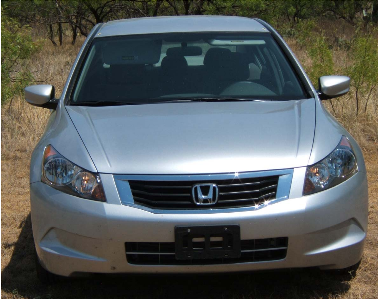
2008 HONDA ACCORD NHTSA NO. C85306 FMVSS NO.401