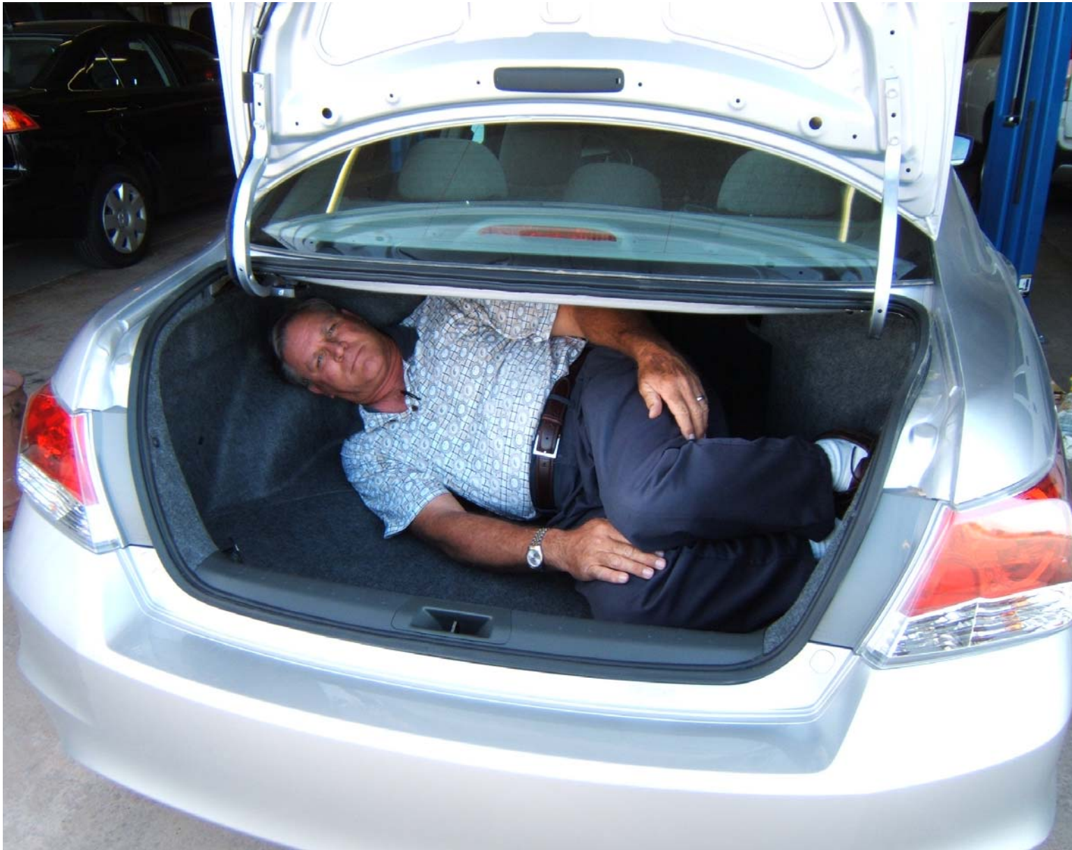
2008 HONDA ACCORD NHTSA NO. C85306 FMVSS NO. 401