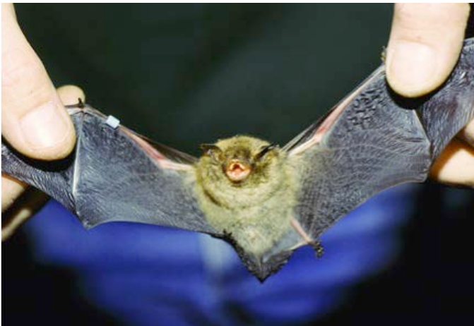
The Indiana bat ( Myotis soldalis) is protected under the ESA.

To streamline the environmental review process, KYTC and the Federal Highway Administration's (FHWA) Kentucky Division Office worked with the USFWS to develop a standard approach for biological surveys and assessments that would reduce the time and expense of consultations, provide more options for compliance with the ESA, and also contribute to the USFWS's statewide conservation and recovery goals for the Indiana bat. A Programmatic Biological Assessment (PBA) as well as a Programmatic Conservation Memorandum of Agreement (MOA) now guide a more efficient environmental review process for the Indiana bat throughout Kentucky and focus valuable resources toward the species' conservation.