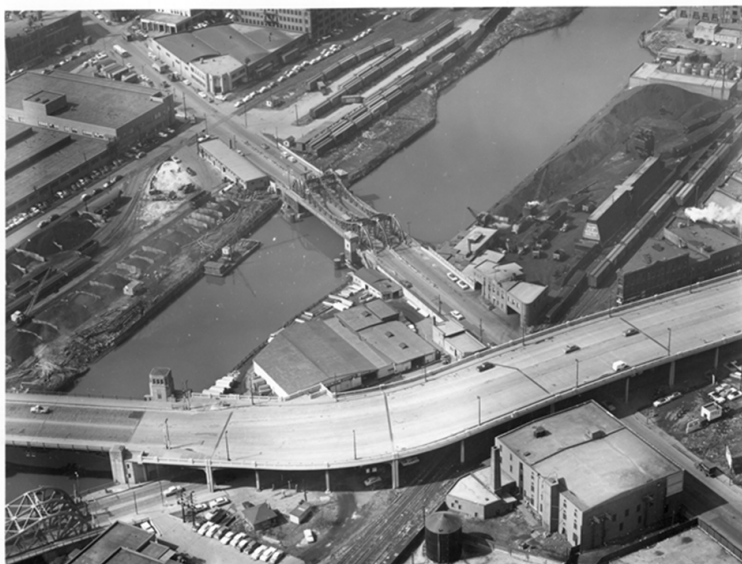
The East Division Street Bridge, shown here in 1956, had been in operation since its construction in 1903.

This spring, the East Division Street Bridge over the North Branch Canal in Chicago was spared seven months of daily repairs due to the innovative thinking and quick work of the Federal Highway Administration (FHWA), the Chicago Department of Transportation (CDOT), the Illinois Department of Transportation (IDOT), the State Historic Preservation Office (SHPO), and the United States Coast Guard (USCG). The East Division Street Bridge, one of Chicago's 44 historic and iconic bascule-style lift bridges, was built in 1903 and, by this spring, bore serious structural problems and could support only five-ton vehicles—preventing even ambulances or fire trucks from crossing. At the same time, the bridge carried an average of 20,000 vehicles per day and provided a vital connection in the West Loop area of downtown Chicago, so the city could not risk the impacts to traffic that would result from a prolonged closure. CDOT and IDOT originally began working with USCG to secure National Environmental Policy Act (NEPA) approval. By transferring lead agency status from USCG to FHWA and expediting interagency coordination, these agencies shortened the environmental review process by seven months.