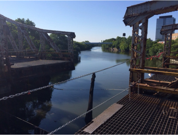
The East Division Street Bridge was demolished and replaced during the summer of 2014.