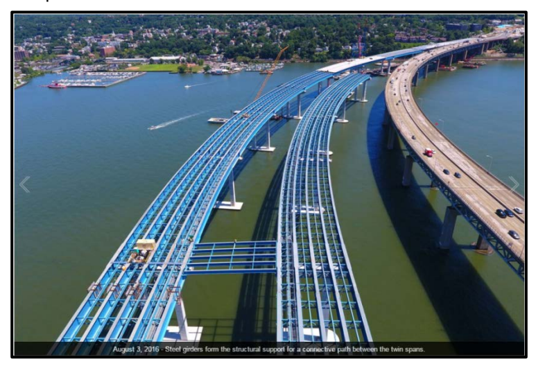
Tappan Zee Bridge under construction