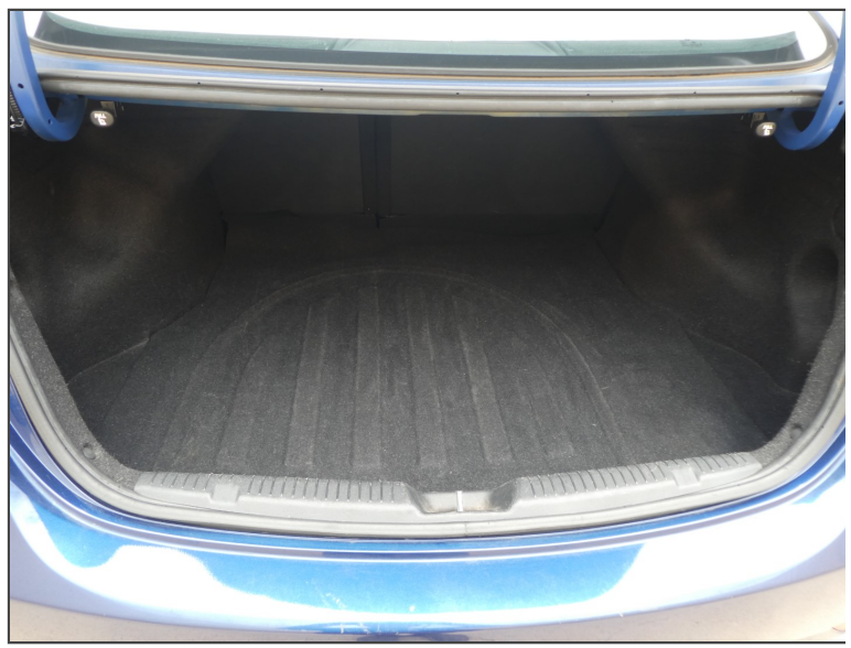
Interior Rear Seat Trunk