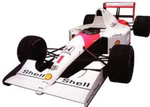
From Fujimi: McLaren MP4/6 kit 1/20 This kit depicts the car that Ayrton Senna drove to victory in the 1991 Japan Grand Prix.