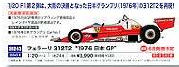
Hasegawa 1/20 Ferrari 312T2 1976 Japan Grand Prix #HSG20243

Among the Revell new releases coming this year will be a new tool version of the Rommel's Rod custom.