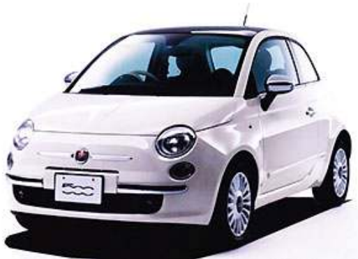
From Fujimi: Fiat 500 kit 1/24

The 48 th Shizuoka Hobby Show was held May 14-17 in Japan. Here are a few interesting new releases. See www.hlj.com for more news from the show.