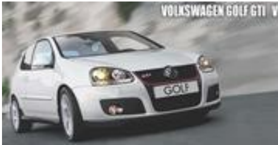
Subject: 2008 VW Golf GTI Manufacturer: Fujimi Kit# 123158 Scale: 1/24 By Chuck Herrmann