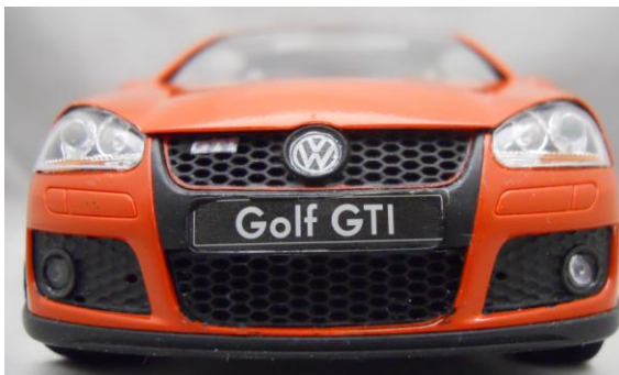
Subject: The 2008 model year was the fifth generation GTI from VW. The GTI is the sporty performance version of the Golf/Rabbit.

Kit: This is a curbside kit, typical of this style of modern Japanese designed kits. The body is molded white, the rest of the parts are grey with chrome and clear plastic. Everything comes packaged in separate plastic bags in a sturdy bow with nice box art – I would have preferred some different angles of the car on the box to help with the build. This kit is not too easy to come by in the U.S. My usual shop was unable to obtain one, so I picked mine up while on vacation, at Hammer Hobbies in Springfield, IL. This has been the only shop I have seen it.