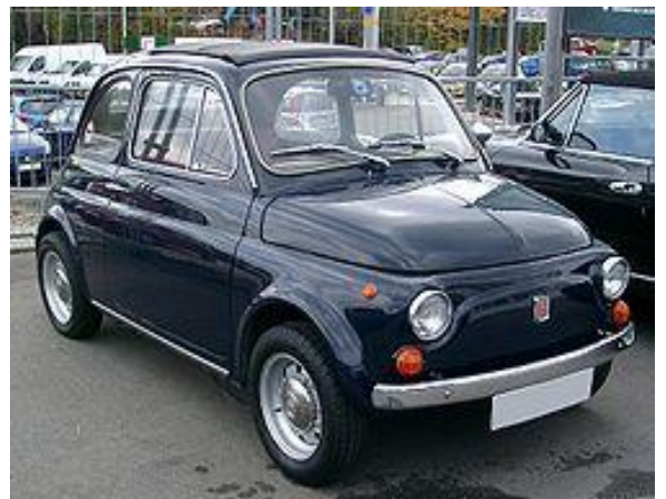
The original Fiat 500.

This is a nice kit, typical of Fujimi lately. It’s another kit with of lot’s of possibilities and would make a great start for a race car project. While you don’t need the F1 GP version, I think I’ll build mine with the kit decals. I highly recommend this kit.