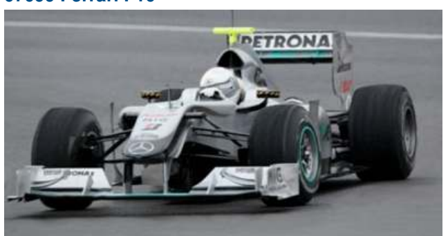
07098 Mercedes-Benz GP W01

And by year end there should be a new 1/24 kit of the latest Mercedes supercar, the SLS AMG, available as well.