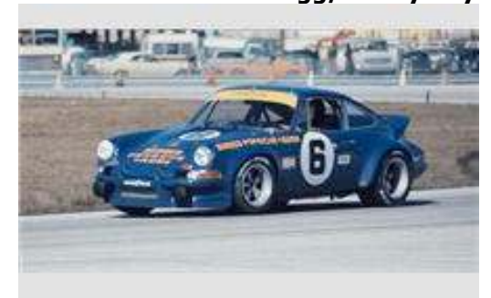
DNF: #6 Donahue/Follmer