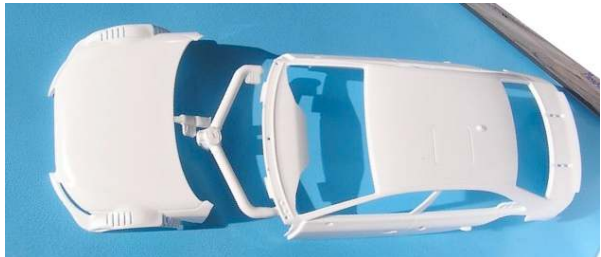
First the body- The molding on this kit is very smooth and thin. It needs little sanding prep for