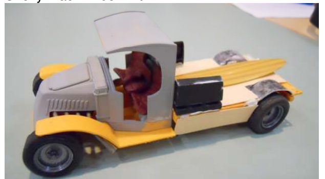
Chuck Herrmann: The Batcoupe (an Aluma Coupe/Batmobile kit bash – see front cover

Dave Edgecomb: a first look at the Island Collectibles resin Porsche 911 HSR (see the review elsewhere this issue), also a Revell 57 Chevy Black Widow kit.