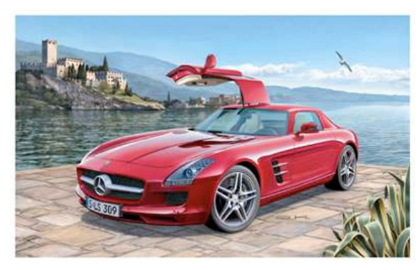
07100 Mercedes SLS AMG

And by year end there should be a new 1/24 kit of the latest Mercedes supercar, the SLS AMG, available as well.