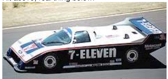
GTR Auto Modelers Newsletter

MODEL FACTORY HIRO has announced a new 1/20 Full Detail Gurney Eagle T1G Grand Prix 1967/68 kit, due in Mid-March 2011. For both kits, check your usual on line sources, including www.mshobbies.com., who passed along these updates.