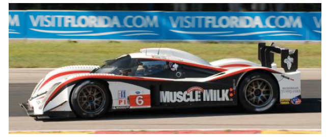
Overall race winner, Lola Aston Martin.

Up the hill for the last time, this was the last lap battle for the overall win.