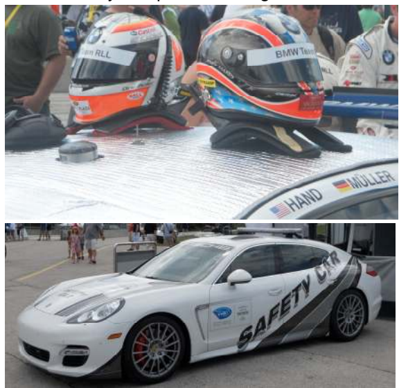
Porsche Panamera safety car.

Despite a light car count in the prototype class we were treated to great racing, as the overall race was won by the closet margin in ALMS history, just .112 seconds! The Muscle Milk Aston Martin Lola and the Dyson Lola Mazda exchanged the lead all day. And the GT classes also saw very competitive racing.