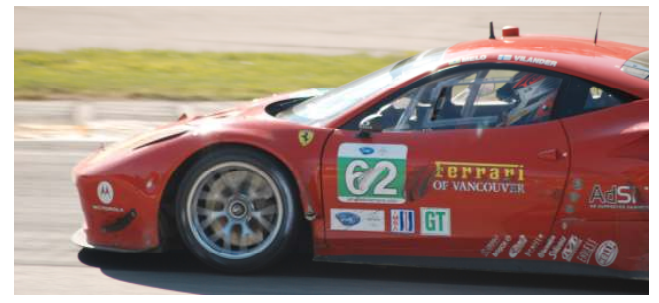
GT Winning Ferrari