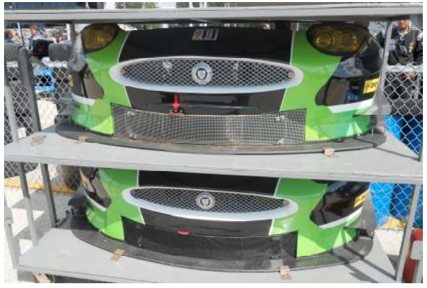
Spare noses in the Jaguar pit area.