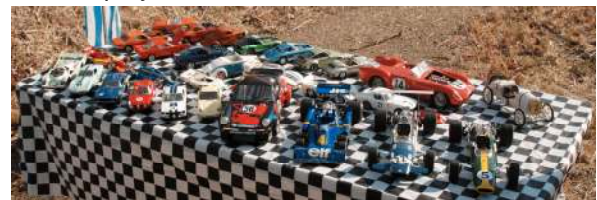
GTR Models on display