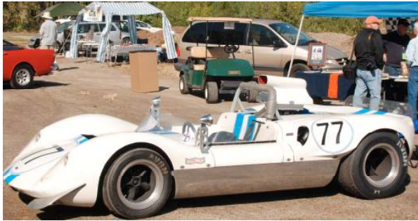
McKee Can Am race car (GTR tent in background)