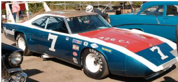
Ramo Stott's Plymouth Superbird stocker.