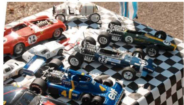
Ron Spannraft's large scale models drew a lot of favorable response all day.