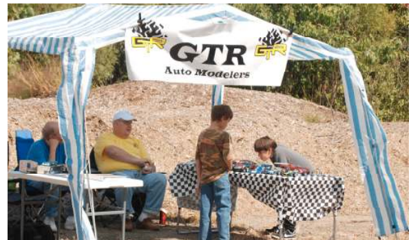
GTR's display tent

It was a beautiful fall day, the GTR tent was set up on what used to be inside of the final corner, the famous Monza Wall banked turn. There were show cars and displays there and out along the old front straight, there were over 100 cars on display. We had a lot of visitors throughout the day who reminisced about building models from when they were younger, and a few potential new members stopped by.