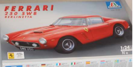
Tim Leicht: the latest reissue of the Modeler's Chaparral 2D,...