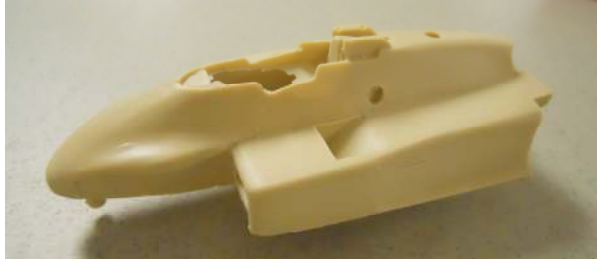
also a built up Revell Germany 1/24 Jordan F1 car.