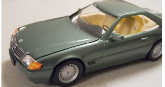
And a Revell Germany Porsche 911 Carrera kit.