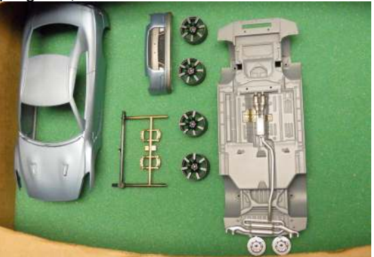
Revell Germany Mercedes 300 SL,