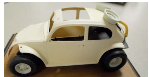
and the new Meyers Manx kit – see First Look elsewhere this issue.