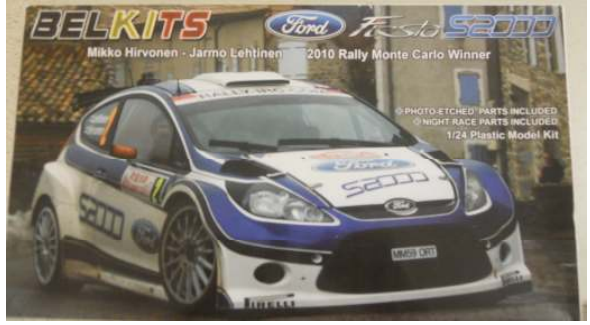
GTR Auto Modelers Newsletter