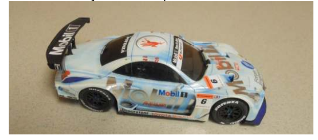
4 of 8