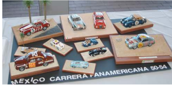
Special Carrera Panamericana display.