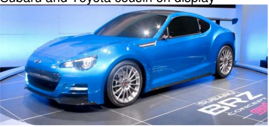
Toyota 86, in US Scion FR-S