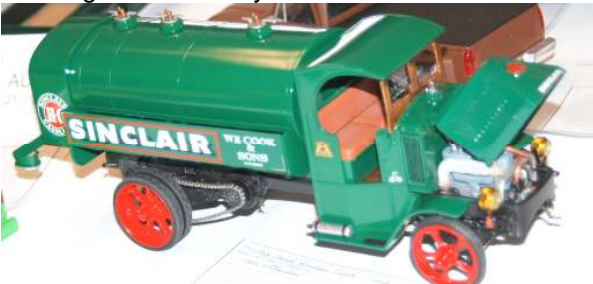
Wining Truck entry