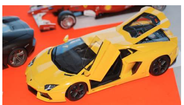
There were three of the new Lamborghini Aventador models in the show.