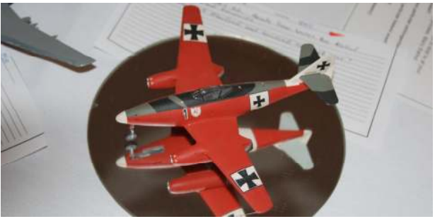
Thanks to the IPMS/Mad City Modelers for hosting this event.