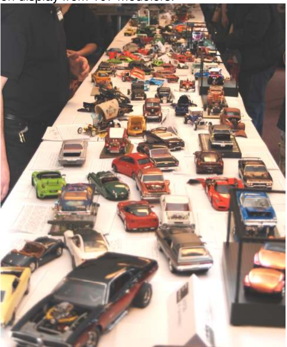
I counted just over 100 automotive entries, they had to add a table to accommodate them all.

Turnout was good, as there were 517 entries on display from 107 modelers.