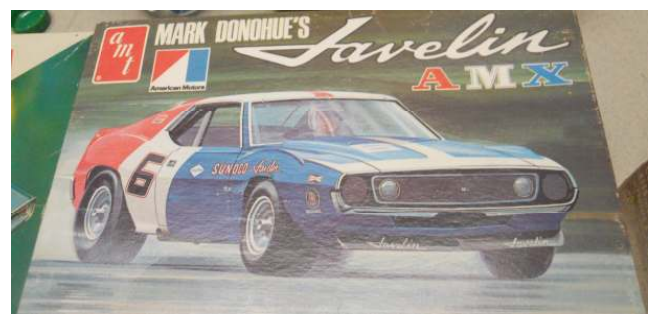
The most notable was this AMT 1970 Trans AM racing Javelin. This also was released as a JoHan kit.

He also had the new Revell Rat Roaster kit which was discussed at length.