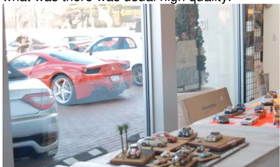
Check out the view beyond the window!

This features a small but extremely high quality contest for racing and GT style subjects. The model count was down a bit this year but what was there was usual high quality.