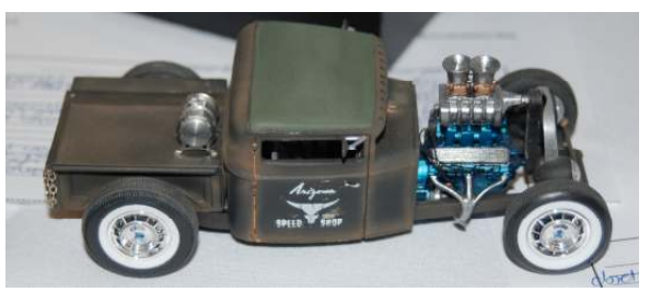
Winning Custom Entry