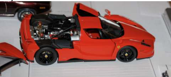
Best Street Automotive