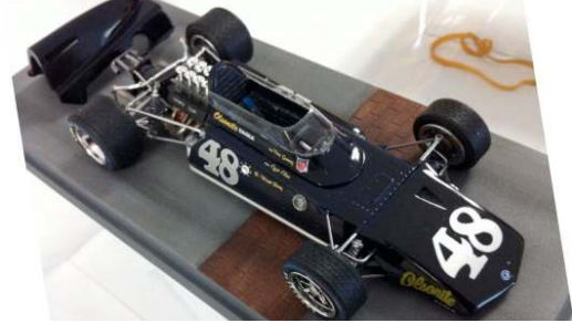
Model: Indy Eagle In Memory of Bill Lastovich