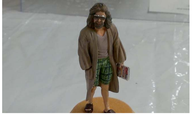
Just relaxing at the NNL