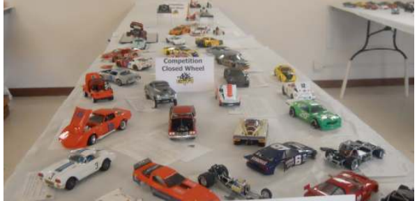
Competition Closed wheel Class table