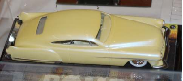
Custom Class Award Winner