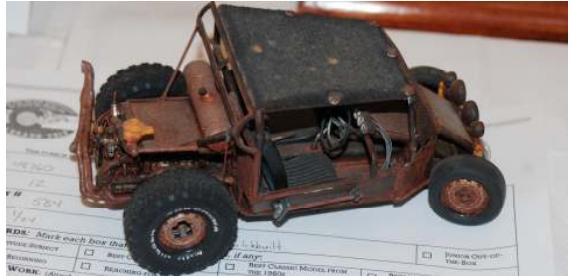
Rat Rod Buggy, from a Tamiya kit.