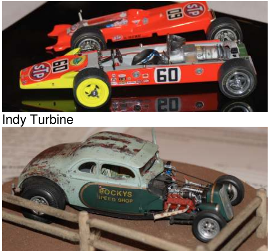
1<sup>st</sup> Place pre-48 Street Rods

Here are some photos of models on the tables. The winners will be featured in an upcoming IPMS Journal .