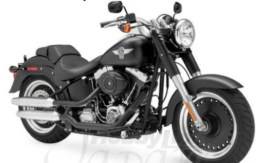
Retail is about $150 for this big boy! Maybe more in the US.

Also, they have announced the first all new big scale (1/6) motorcycle kit in 17 years. The Harley Davidson Fat Boy Lo Kit 16041