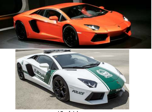
13 of 14