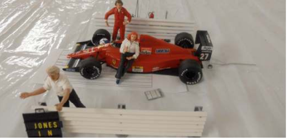
Ferrari F1 Pit Diorama