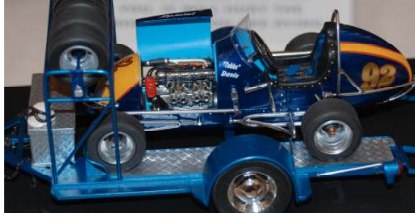
Heavily modified Monogram Midget, the old 1/16 scale issue!