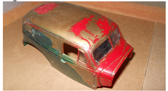
The first sample was an old Revell 1939 Chevy Sedan Delivery that had multiple coats of

At the Attack of the Plastic model contest and swap in Delavan WI in July, the GTR club vendor table was located next to the table for the distributor of Blue Magic, a paint stripping product. We got to talking, they needed something to demo their product so I pulled out some stuff from a parts bag I had just purchased to let them show how Blue Magic worked.