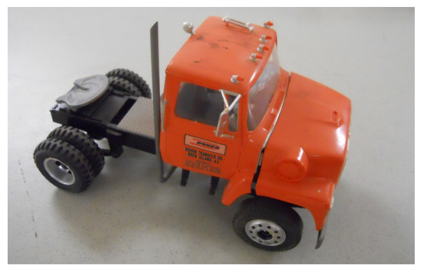
a Ford Aeromax in progress,