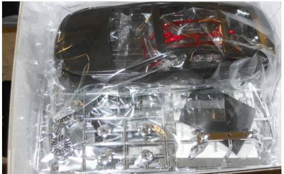
Also, a 1960 Studebaker Silver Hawk resin body by Missing Link.