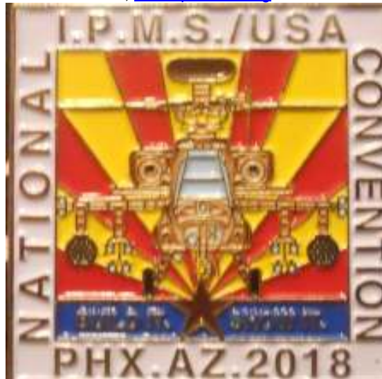
2018 Convention Lapel Pin

GTR is a proud member of the IPMS organization. GTR is a local chapter, in Region 5, of IPMS/USA. We need five current IPMS/USA members to remain a chapter. The annual recharter process is coming up soon. So we encourage those who have lapsed to renew their IPMS/USA membership, or if you have never been a member enroll now! Details can be found at their web site, www.ipmsusa.org .