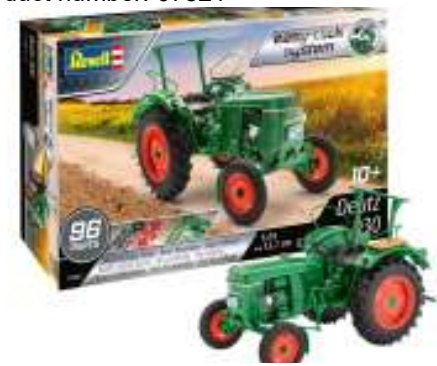
AMT New Stuff