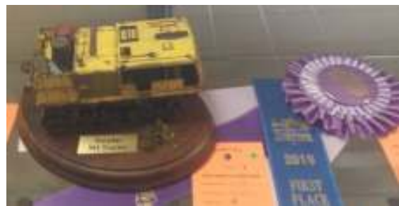
Above was the Best in Show winner in the non-automotive contest.