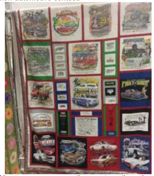
Here were some other automotive themed artworks, including the quilt above and the beadwork below.