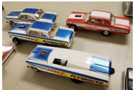
Dave Green has multiple Melrose Missile cars – a Super stock, the Model King altered wheelbase, the no-top roadster as well as California Flash