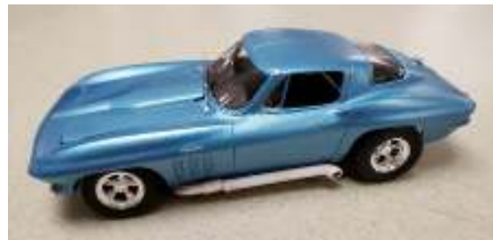
A Revell '65 Corvette in Mulsane Blue lacquer

Doug had a few Corvettes. This one is an Accurate Miniatures Grand Sport in Compuware livery. Car still sits too high but the hood louvers are way too cool.