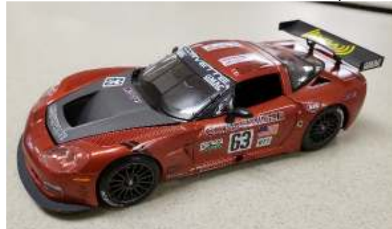
The latest C6 race Corvette from Revell. This is a phantom color [Sunset Metal Red lacquer] in Compuware livery. Hood is painted to simulate Carbon Fiber.