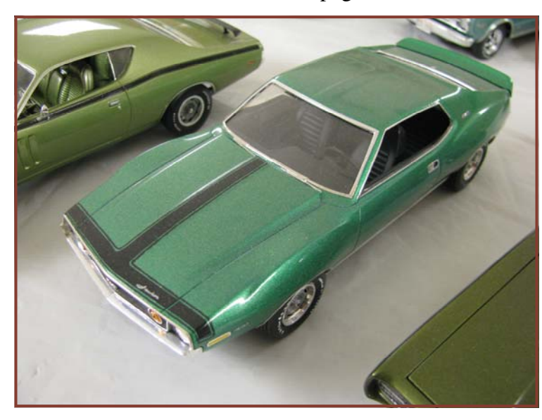
...continued from page 4