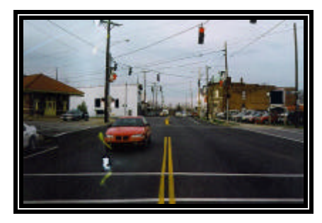
Figure 3. Northbound approach for the truck