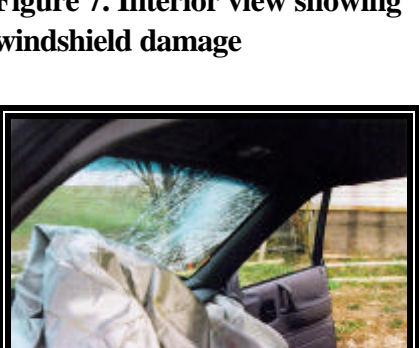
The front right passenger's air bag deployed from a top mounted module located in the right upper-instrument panel with a single cover flap design hinged at the forward aspect. The cover flap was rectangular in shape. Blood was identified on the front left aspect of the air bag in the police photographs.