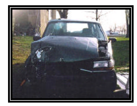
Figure 1. 1994 Plymouth Voyager

This remote investigation focused on a 1994 Plymouth Voyager ( Figure 1 ) equipped with frontal air bags for the driver and front right passenger positions that deployed as a result of a frontal collision with the right side of the power unit of a tractor, semi-trailer. The Voyager was occupied by a 31-year-old female driver and an 8-year-old male front right child passenger. The driver of the Voyager stated that both occupants were restrained by the manual 3-point lap and shoulder belts, however restraint usage could not be confirmed. The 8-year-old child may have been seated forward on the front right seat cushion and was displaced forward from precrash braking. At impact, both occupants initiated forward