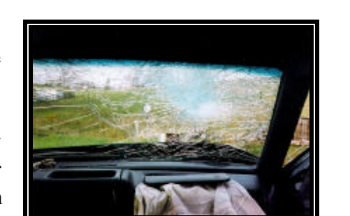
Figure 7. Interior view showing windshield damage