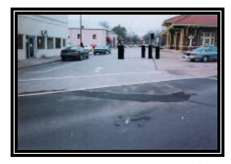
Figure 4. Westbound view of the point of impact with the gouge mark and tire mark visible