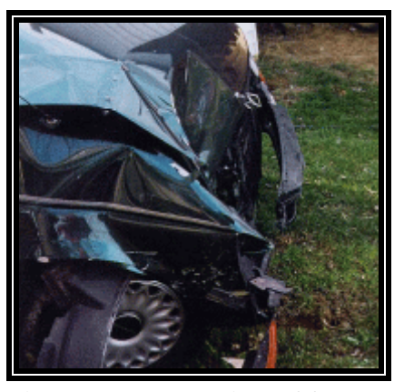
Figure 5. Lateral view of frontal damage

The 1994 Plymouth Voyager sustained moderate damage as a result of the impact with the truck (Figure 5). The front plastic bumper fascia was completely separated from the vehicle, and was fractured laterally in the center and fractured vertically approximately 46 cm (18") to the right of the centerline on the top aspect. Multiple abrasions were also noted on the right corner of the front bumper fascia. The bumper beam was fractured approximately 46 cm (18") to the right of the centerline, and the portion to the right of the fracture was completely separated. The lower radiator support was crushed rearward behind the bumper beam approximately 10 cm (4") on the front left and center aspects. The upper radiator support and radiator core were both crushed rearward. The maximum crush was estimated to be 25 cm (10") and located at C5, approximately 46 cm (18") to the right of the centerline (Figure 6). The hood was displaced to the right approximately 30 cm (12"), and buckled at the designated fold points. The right front fender was crushed rearward against the right front wheel and was displaced to the right. It appeared that the right front wheel was restricted in the police photographs. The right headlamp assembly was fractured and displaced. The Collision Deformation Classification (CDC) for this impact was 11-