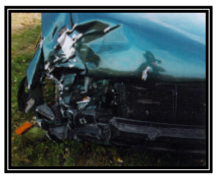
Figure 6. Frontal damage showing maximum crush