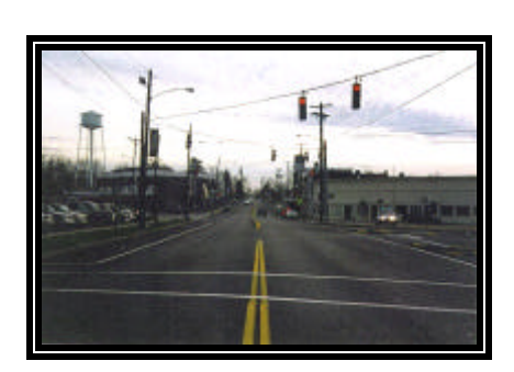
Figure 2. Southbound approach for the Voyager

It was not known how the driver of the Voyager exited the vehicle. The police reported that she did not sustain injury. The 8-year-old male child passenger was found in the vehicle in the front right position by the first responding police officer. It was not known how he was removed from the vehicle, although rescue personnel found him lying on the roadway next to the vehicle. He was treated at the scene by rescue