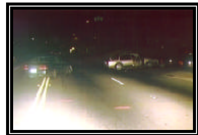
Figure 3. Crash site showing final rest positions