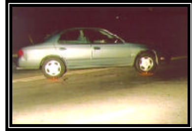
Figure 1. 1994 Nissan Altima

This remote investigation focused on a 1994 Nissan Altima ( Figure 1 ) which was equipped with air bags for the driver and front right positions that deployed as a result of a frontal impact with a 1989 Oldsmobile 98 Regency. The Altima was occupied by a 26-year-old female driver, a 16-year-old female front right passenger, a 6-year-old male on the lap of the front right passenger, and three male children in the rear seat ranging from 2 to 16 years of age. The 2-year-old was reportedly restrained in a child safety seat, however, the remaining occupants were unrestrained. The driver of the Oldsmobile initiated a left turn across the path of the Altima and the front right area of the