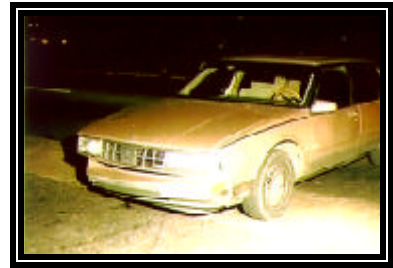
Figure 6. Frontal damage to Oldsmobile 98 Regency

The 1989 Oldsmobile Regency sustained minor frontal damage as a result of the impact with the Nissan Altima. The Regency was equipped with Energy Absorbing Devices (EAD's) behind the front bumper. The status of the EAD's could not be determined from the available police photographs. The direct damage began approximately 65 cm (25.6") to the right of the centerline and extended laterally to the right bumper corner ( Figure 6 ). The combined direct and induced damage involved the entire frontal width of the vehicle. The front right bumper corner was crushed downward and rearward. The maximum crush was estimated to be 25 cm (10") and was located at C6 at the front right bumper corner. The entire bumper fascia was displaced to the left. The right front fender was slightly buckled inward from rearward displacement. The CDC for the impact with the Altima was 01-FREE-2. Six crush measurements along the bumper were estimated from the police photographs and were as follows: C1 = 2 cm (1"), C2 = 5 cm (2"), C3 = 10 cm (4"), C4 = 15 cm (6"), C5 = 20 cm (8"), C6 = 25 cm (10").