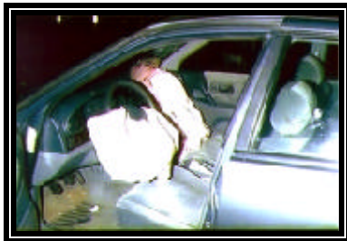
Figure 7. Frontal air bag system in the Nissan Altima

The 1994 Nissan Altima was equipped with frontal air bags for the driver and front right passenger positions ( Figure 7 ) that deployed as a result of the impact with the 1989 Oldsmobile Regency. The driver's air bag was housed in the center of the steering wheel with a single cover flap design hinged at the top aspect. The air bag was vented by two ports located at the 11 and 1 o'clock positions.