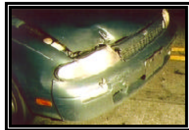
Figure 4. Frontal damage to the Nissan Altima

The 1994 Nissan Altima sustained minor frontal damage as a result of the impact with the Oldsmobile Regency. The direct contact damage began approximately 20 cm (8") to the right of the centerline and extended laterally along the frontal plane to the right bumper corner ( Figure 4 ). The combined direct and induced damage involved the entire frontal plane of the vehicle. The bumper fascia was abraded and crushed rearward on the right side from direct contact ( Figure 5 ). The maximum crush was estimated to be 8 cm (3") and was located at C6 on the front right bumper corner. The right headlamp assembly was displaced. The grille was separated on the right side. The hood was displaced rearward and buckled on the right side. A depression and abrasions were noted on the hood above the right edge of the grille from engagement against the front right corner of the Regency. The Collision Deformation Classification (CDC) for the impact with the Regency was 12-FREW-1. Six crush