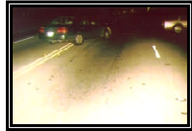
Figure 2. On-scene photograph showing skid marks from the Altima

The 26-year-old female driver of the 1994 Nissan Altima was operating the vehicle on the inboard northbound lane of a four-lane roadway. Police reported that the driver of the 1989 Oldsmobile 98 Regency was intoxicated. The inattentive driver of the 98 Regency was operating the vehicle in the southbound inboard lane and initiated a left turn across the path of the Nissan. The driver of the Nissan realized the impending event and applied the brakes in full lockup. Skid marks were noted in the Nissan's trajectory in the on-scene police photographs ( Figure 2 ). Estimated lengths of the skid marks were approximately 15 m (50').