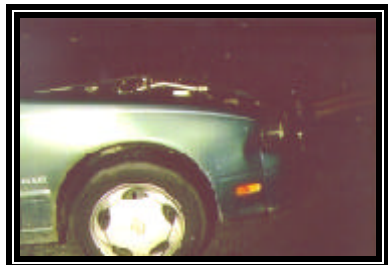
Figure 5. Right side view of frontal damage