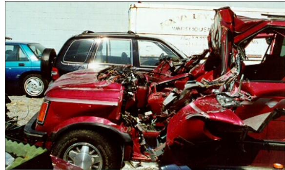
Figure 6: Case vehicle's greenhouse area; Note: A-pillar failure and top of dash torn away

The case vehicle was equipped with a driver (only) air bag which was located in the steering wheel hub. The case vehicle's driver air bag did not deploy.