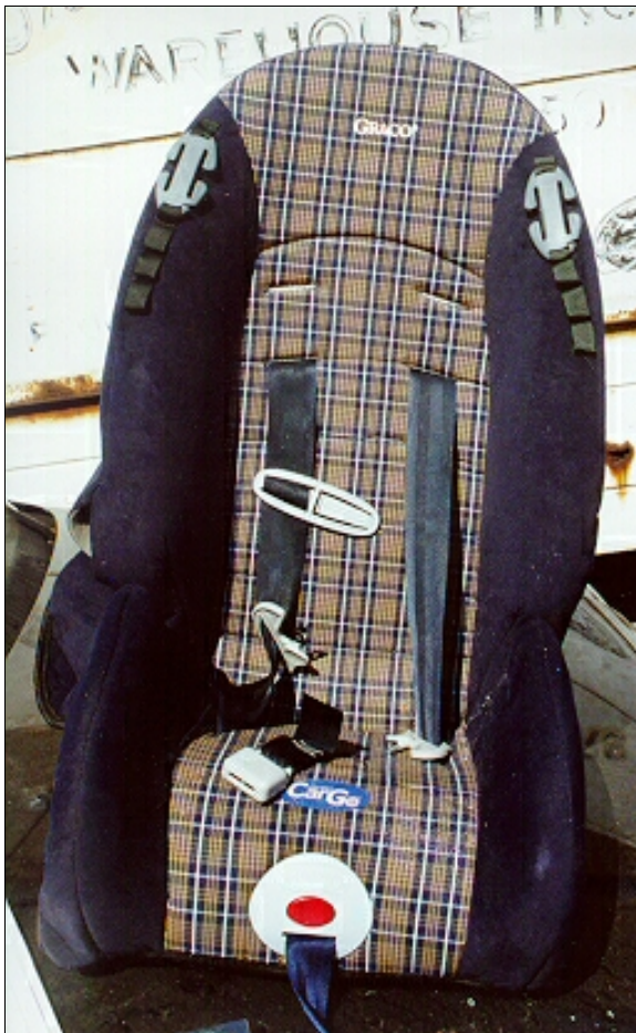
Figure 9: Front of Graco FFCSS used by case vehicle's second seated left passenger

Only the left-seated 4-year-old female's FFCSS was available to be inspected, because she got out of the seat when she was removed from the case vehicle and the seated stayed in the minivan ( Figures 9 and 10 ). (The right-seated 2-year-old male was removed from the case vehicle and was transported to the hospital in his FFCSS, which was discarded by the hospital.)