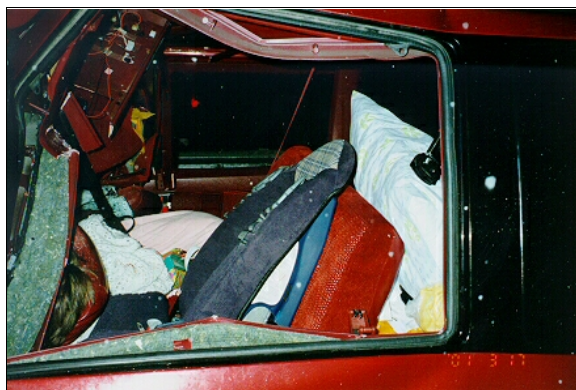
Figure 12: On-scene view of case vehicle's second seated left passenger area showing FFCSS in post-crash position; Note: identical FFCSS in right position removed along with toddler to hospital