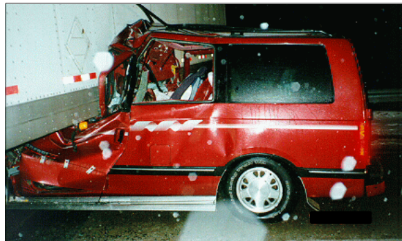
Figure 4: On-scene view of case vehicle's final rest position lodged under semi-trailer's left side