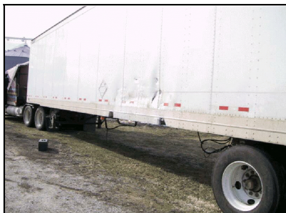
Figure 14: Left side of trailer showing area of direct contact from case vehicle