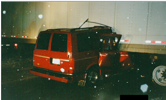
Figure 3: On-scene view of case vehicle at final rest lodged underneath semi-trailer's left side

The front (primarily greenhouse) of the case vehicle impacted, in a perpendicular orientation, the left side of the semi-trailer and underrode it ( Figures 3 and 4 ). Because of the severe underride, the case vehicle's driver air bag did not deploy. The case vehicle came to rest heading south while the tractor-trailer was heading east.