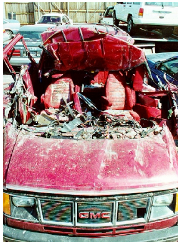
Figure 5 Front overhead view of deformation to case vehicle's greenhouse area; Note: no direct damage to bumper or grill

The interior of the case vehicle was equipped with a four-way power adjustable driver bucket seat and manually adjustable front right passenger bucket seat with adjustable head restraints, three-point lap-and-shoulder belts in the six outboard seated positions, and lap belts in the second and third center seat positions. The second and third rows had bench seats with no head restraints. The front safety belt systems were equipped with manually operated height adjusters for the D-rings. There was an air bag for the driver position only.