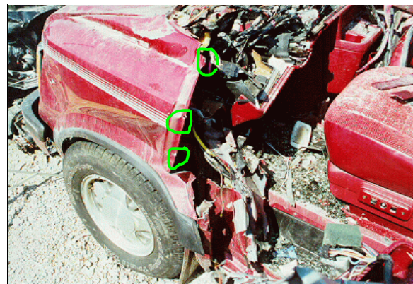
Figure 7: Additional view of case vehicle's left A-pillar failure and integrity loss; Note: rivet holes (highlighted) in sheet metal