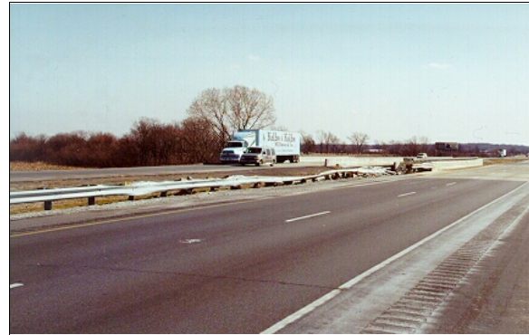
Figure 1: Southeast view of southbound roadway and median guardrail damaged by tractor-trailer

The case vehicle was traveling south in the outside southbound lane of a two-lane roadway that was part of a four-lane, divided, Interstate trafficway and intended to continue southward. The tractor-trailer combination was traveling south in the outside lane of the same southbound roadway. The tractor-trailer's driver braked due to a braking noncontact vehicle further south and, as a result, lost control on the snow covered, icy roadway. The rig rotated counterclockwise and the truck-tractor climbed onto and partially over the guardrail along the east shoulder ( Figure 1 ) while the semi-trailer swung across both southbound lanes ( Figure 2 ). The case vehicle's driver braked, attempting to avoid the crash. Based on statements by an eye witness and on-scene firefighters, because of the snow covered roadway, the color of the trailer, and possibly driver fatigue, the case vehicle's driver most likely didn't see the trailer and didn't apply his brakes until immediately prior to impact. The crash occurred in the outside through lane of the southbound roadway.