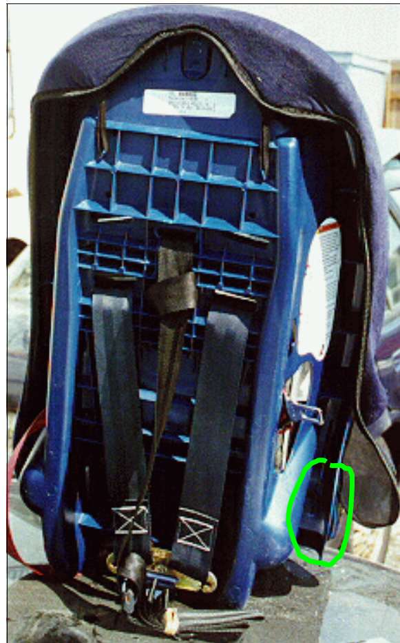
Figure 10: Back of Graco FFCSS used by case vehicle's second seated left passenger; Note: stress (highlighted) marks