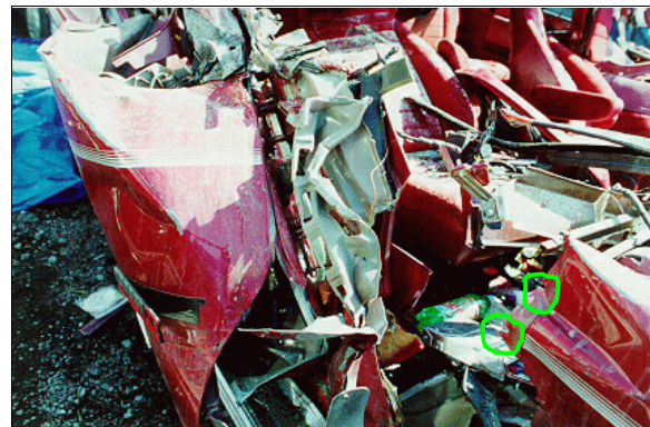
Figure 8: Right A-pillar pushed rearward against right B-pillar; Note: rivet holes (highlighted) in sheet metal