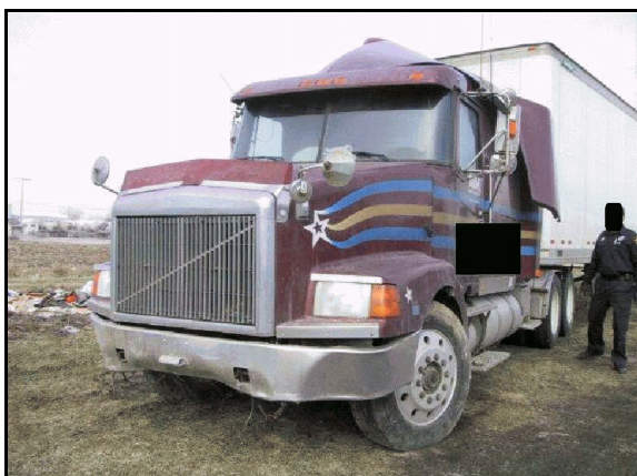
Figure 13: Tractor, front bumper damage due to guardrail impact

The other vehicle was a 1988 White GMC Volvo 6x4 truck-tractor (VIN: 4V1WDBJH7JN-----), hauling a 16.1 meter [53 feet] in length, Great Dane trailer (VIN: 1GRAA062XXB-----). Inspection of the Great Dane trailer revealed damage to the trailer’s left side ( Figure 12 ) and undercarriage from impact with the case vehicle. The White GMC tractor and the Great Dane trailer were both towed due to damage.