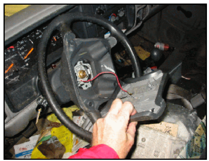
Figure 7. Behind horn membrane