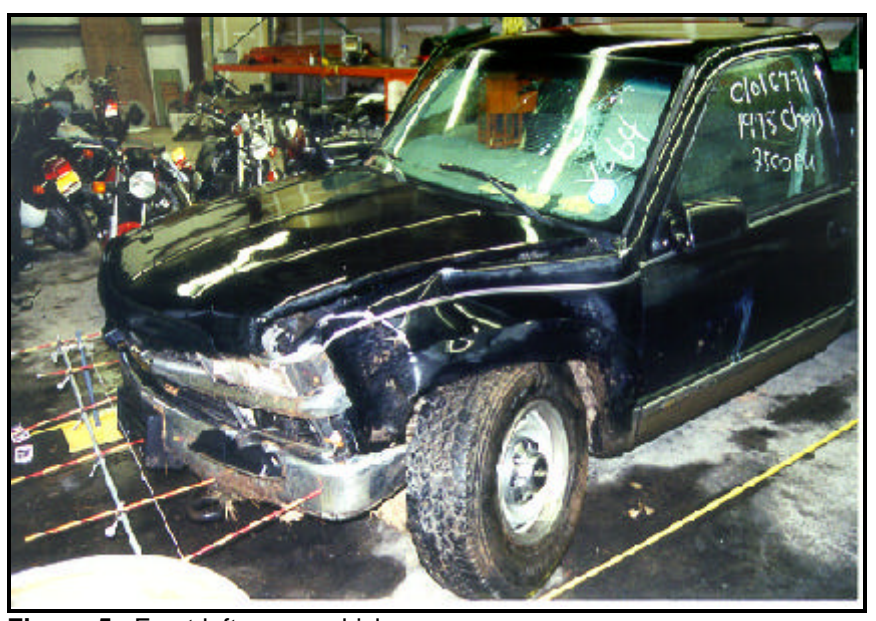
Figure 5. Front left, case vehicle