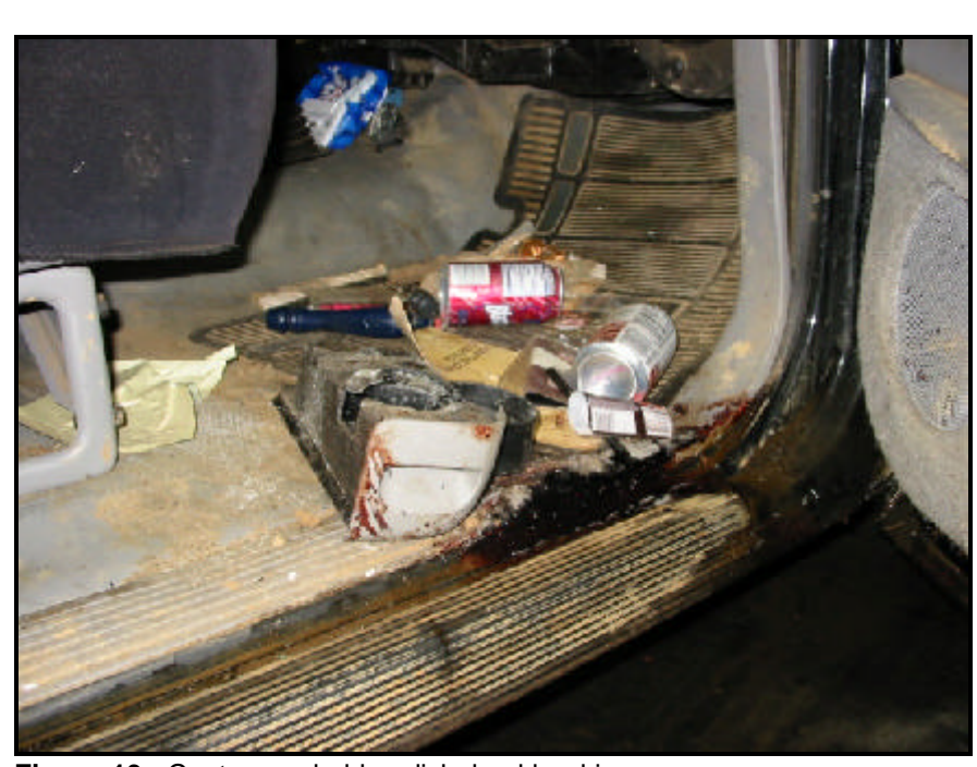
Figure 13. Center cup holder-dislodged by driver