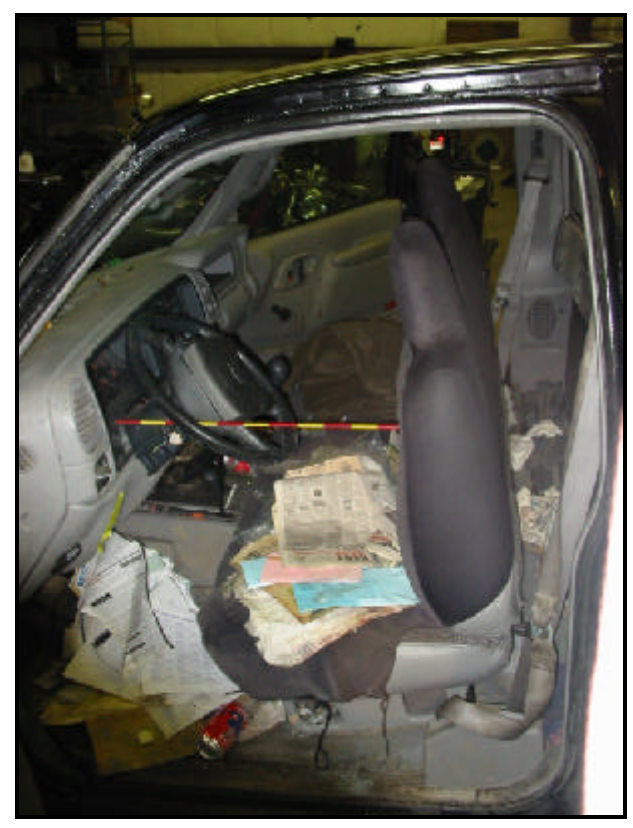
Figure 12. Driver's seated position—note seat back and deformed steering wheel