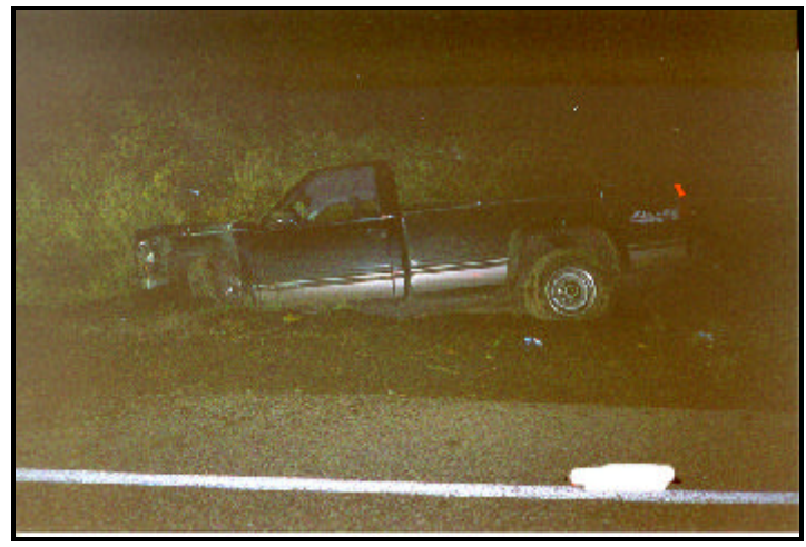
Figure 1. Final rest-south

The case vehicle was traveling eastbound at an unknown rate of speed. The driver had a blood alcohol level of 0.35%. As the case vehicle negotiated the right hand curve, it appears that the vehicle crossed into the westbound travel lanes. Approximately 91.4 m (300 ft) before the impact, the driver corrected his vehicle and brought it back into the eastbound lanes. Approximately 60.9 m (200 ft) before impact, the case vehicle's right side departed the roadway. After traveling another 30.4 m (100 ft), the front of the case vehicle struck the embankment-possibly several times. The right front tire was knocked off. The case vehicle continued on for another 30.4 m (100 ft) before the front left tire and bumper dug into the ground and the vehicle came to rest.