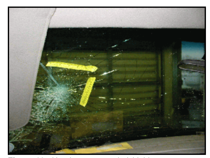
Figure 10. Head contact to windshield