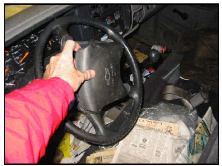
Figure 6. Horn button

The case continued to be investigated because of its borderline nature and to determine if the existence of the air bag might have mitigated the resulting fatal injuries. It is this investigator's opinion that the existence of a steering wheel mounted air bag would have greatly reduced the number of injuries sustained by the driver as well as their severity. In particular, the air bag might have prevented the driver's head from ever reaching the windshield thus mitigating the inevitable fatal injuries. The air bag would also have likely eliminated the chest and abdomen injuries.