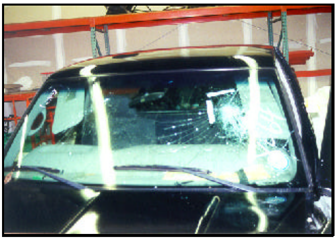
Figure 9. Exterior view of windshield contact

The seat back appears to have failed during the crash. In police photos it can be seen that the seat is no longer in its locked position. At the time of the inspection the investigator was unable to put the seat back into the latched position. The reason for the failure may have been inertial forces. There was no indication of loading from the rear.