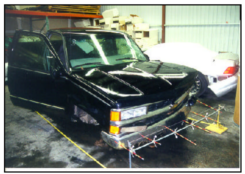
Figure 4. Front right, case vehicle