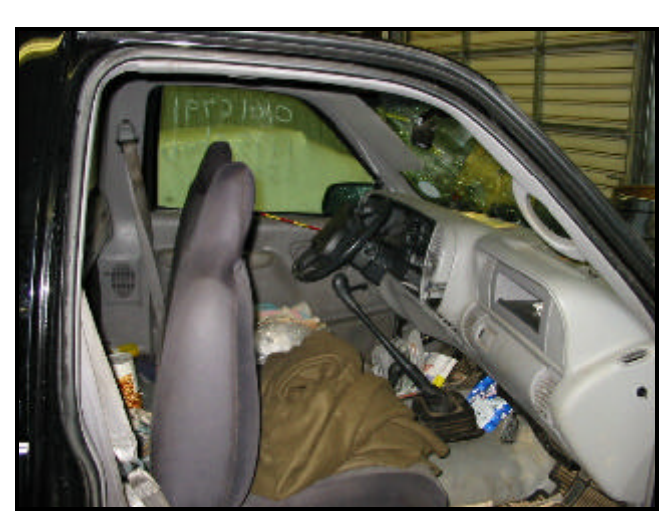
Figure 11 . Passenger side view of driver's seated position