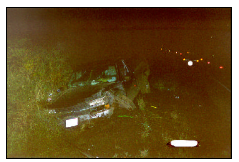
Figure 2. Final rest-east

The crash was reported by a citizen to a local police officer who was working radar in the area. He responded to the crash scene. He was the first to open the door. He found the driver face down on the passenger floor and unresponsive to verbal commands.