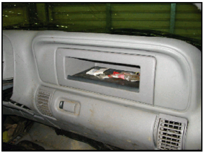
Figure 8. Front right instrument panel