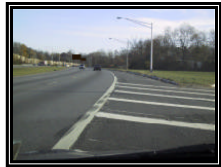
Figure 3. Eastbound view showing replaced luminaire at the crash scene