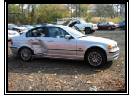
Figure 1. Damaged 1999 BMW 328i

This crash was found by the Veridian SCI team during conversation with a tow operator regarding a separate crash. The tow operator indicated that the BMW was at their facility and that all of the side impact occupant protection systems had deployed due to a right side impact. Notification was forwarded to NHTSA and an on-site effort was assigned to the Veridian SCI team on Thursday, November 1, 2001. Contact with the investigating police agency was established. A police crash report was obtained subsequent to the on-site field activities. The crash location and vehicle information was confirmed verbally with the investigating agency. A partial interview with the driver was obtained following the field investigation, and after subsequent attempts to complete the interview the driver stated that he was unwilling to further cooperate.