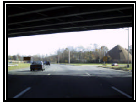
Figure 2. Eastbound approach for the BMW

The BMW 328i struck a luminaire with a frangible base ( Figure 3 ) with the right rear door area. The direction of force was in the 3 o'clock sector. The impact fractured the luminaire at the base. Due to the yielding nature of the luminaire, the impact was out of the scope of the WinSMASH program. An estimated delta-V based on the damage to the BMW was approximately 13 - 16 km/h (8 - 10 mph). The impact was sufficient to deploy the right front passenger's side air bag and the right side HPS. The impact to the BMW was located behind the vehicle's center of gravity which reversed the rotation to CW. The BMW rotated in a CW direction around the pole and caused the luminaire to fracture from its base. The left rear wheel struck the raised concrete curb on the right roadside as the BMW had rotated 180 degrees in a CW direction. The direction of force for the secondary impact to the left rear wheel was in the 9 o'clock sector. The impact to the left rear wheel resulted in the deployment of the left front driver's side air bag and the left side HPS system.