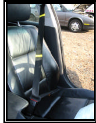
Figure 8. View of driver's lap and shoulder belt

The rear seat was configured with manual 3-point lap and shoulder belts with sliding latch plates and switchable/ALR, inertial lock/belt sensitive retractors for the outboard positions. The rear center position was equipped with a manual lap belt with a locking latch plate.