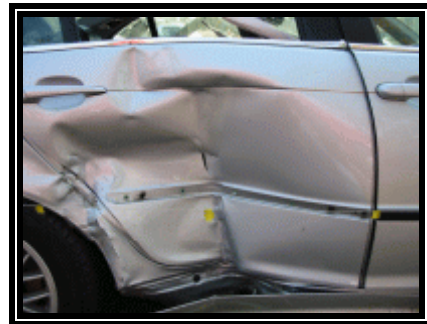
Figure 5. Direct damage showing outline of the luminaire's frangible base