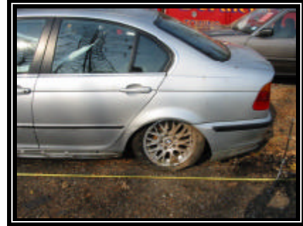
Figure 6. View of left side damage

The BMW 328i sustained left rear wheel damage as a result of the secondary curb impact ( Figure 6 ). The edge of the left rear wheel was heavily abraded from the lateral contact with the curb. The wheel and tire were coated with dirt and grass. Although the left rear suspension was damaged and the left rear aspect of the BMW was riding low on the left rear wheel, the wheel was not restricted. The rear aspect of the vehicle was shifted to the left slightly from the lateral force of the impact. The left rear quarter panel overlapped the outboard edge of the left rear wheel 9.5 cm (3.8"). An exemplar vehicle exhibited a 2.5 cm (1.0") overlap of the quarter panel. The sill trim was separated from the vehicle and the left rear door panel exhibited longitudinal abrasions on the mid-door area that measured 3.8 cm (1.5") in height. The CDC for the secondary impact was 09-LBWN-2.