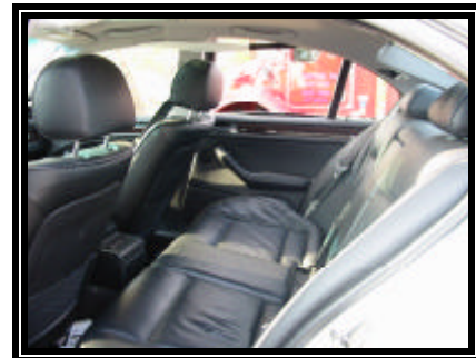
Figure 7. View of rear seat area showing the right rear door intrusion

Interior damage to the BMW 328i was minor and was attributed to passenger compartment intrusion ( Figure 7 ). The glazing in the rear right door was disintegrated from impact forces. The remaining glazing and windshield laminate was not damaged. The speaker cover on the forward aspect of the lower right front door was partially separated, although it could not be confirmed as resulting from occupant contact. The rear bench seat cushion was separated from the seat brackets at the time of the vehicle inspection. The right rear door had intruded into the rear right occupant space as a result of the side impact with the luminaire. The maximum lateral intrusion in to the rear right occupant space measured 7.6 cm (3.0") at the sill.