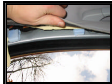
Figure 11. Clips in roof side rail used to secure the HPS

The HPS deployed from the left and right roof rails and A-pillar areas. The separation at the roof rail measured 106.7 cm (42.0") in length. The separation along the A-pillar measured 54.6 cm (21.5") in length. Five clips that measured 5.1 cm (2.0") in height and 2.5 cm (1.0") in width were used to secure the non-deployed HPS in the A-pillar and roof rail ( Figure 11 ). Two clips were located in the upper A-pillars and were spaced 15.2 cm (6.0") apart. Two clips were located at the forward edge of the front door frames and were spaced 15.2 cm (6.0") apart. The remaining clip was located aft of the B-pillars and measured a distance of 40.6 cm (16.0") aft of the fourth clip.