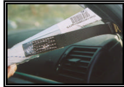
Figure 13. Forward tether strap and inflator tube for the right front HPS