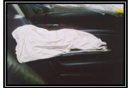
Figure 9. Driver's door-mounted side air bag

The driver's side air bag deployed from a left front door-mounted module that was located above the driver's arm rest ( Figure 9 ). The module was configured with a single cover flap that was rectangular in shape and followed the contour of the interior door panel ( Figure 10 ). The cover flap measured 25.4 cm (10.0") in length and 12.1 cm (4.8") in height. The driver's side air bag measured 40.6 cm (16.0") in length, 17.8 cm (7.0") in height at the rear aspect, and 14.0 cm (5.5") in height at the forward aspect. The air bag was not tethered internally, and was not vented by external ports. The surface of the driver's side air bag exhibited dirt and discoloration, most likely as a result of post-crash handling. Longitudinal striation marks were present on the rear aspect of the inboard surface as a result of expansion against the cover flap. There was no occupant contact evidence on the surface of the driver's side air bag or module cover flap.