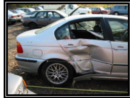
Figure 4. View of direct and induced right side damage from the luminaire impact