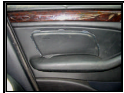
Figure 10. Driver's door-mounted side air bag cover flap

The right front passenger's side air bag deployed from the right front door-mounted module that was located above the right front passenger's arm rest. The cover flap and air bag measurements were consistent with those of the driver's side air bag. Longitudinal striation marks were present on the rear aspect of the inboard surface as a result of expansion against the cover flap. There was no occupant contact evidence on the surface of the right front passenger's air bag or module cover flap.