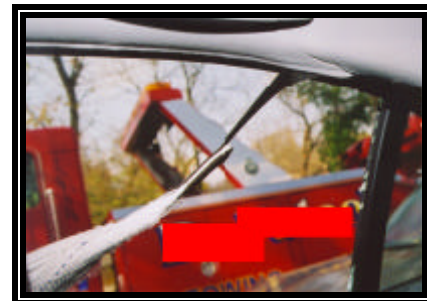
Figure 14. Rear tether strap for the right front HPS