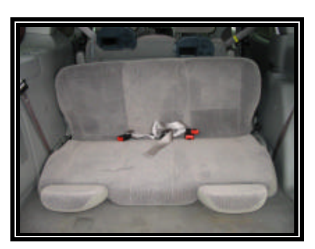
Figure 3. Displaced third seat

The Windstar was equipped with box-mounted captains chairs with integral head restraints for the driver and front right passenger positions. At the time of the vehicle inspection, the driver's seat track was adjusted to the full-forward position and the front right seat track was adjusted to the full-rear position. Both front seats traveled a total distance of 16.5 cm (6.5") fore and aft. The driver's seat back was reclined 30 degrees from vertical and the front right seat was reclined 10 degrees from vertical. The second row was configured with a two-person bench seat with adjustable head restraints. The left head restraint was adjusted 7.6 cm (3.0") above the seat back and the right