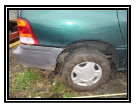
Figure 5. Right rear damage from the sideswipe impact

The impact with the utility pole resulted in moderate damage to the Windstar. The direct contact damage began 54.6 cm (21.5") to the left of center on the bumper fascia and extended to the front left corner and around the left side aspect of the fascia ( Figure 6 ). The front right aspect of the bumper fascia was fractured 82.6 cm (32.5") left of center at the left corner.