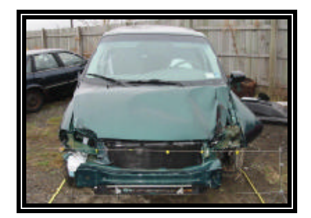
Figure 4. Frontal view of damaged Windstar

The 2002 Ford Windstar sustained moderate damage as a result of the multiple impacts ( Figure 4 ). The vehicle exhibited minor front right damage as a result of the first impact with the non-breakaway sign. Narrow direct contact abrasions were located on the front right corner of the hood and measured 9.5 cm (3.8") in width and 10.2 cm (4.0") rearward from the forward aspect. The direct contact damage on the bumper fascia began 68.6 cm (27.0") right of the centerline and extended to the front right corner. The bumper fascia was fractured 74.3 cm (29.3") right of center and the corner