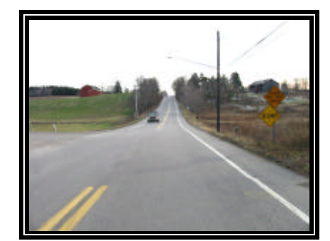
Figure 2. Southbound approach for the Windstar

The 38-year-old female driver was operating the 2002 Ford Windstar southbound on the two-lane county roadway ( Figure 2 ). As the Windstar crested the hill, the driver detected a non-contact vehicle stopped at the mouth of the intersection waiting to initiate a left turn onto the local roadway. The driver of the Ford Windstar steered right in an attempt to avoid the collision with the non-contact vehicle. The Windstar departed the right roadside in a tracking mode.