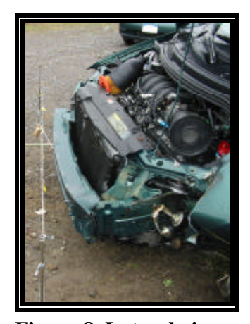
Figure 8. Lateral view of direct and induced frontal damage

The direct contact on the left corner of the bumper beam was minimal, however, the impact resulted in the induced displacement of the entire beam (Figure 8) . Direct contact abrasions were present on the left corner of the hood and the entire hood was buckled rearward. The pole impact also resulted in rearward and outward displacement of the left front fender. The aft edge of the left fender was displaced inboard of the leading edge of the partially restricted left front door. The crush resulted in incapacitating damage to the exterior fuse box, which resulted in complete power loss to the vehicle. The corner impact allowed the pole to penetrate rearward and contact the left front wheel assembly. The left front wheel was restricted against the rear aspect of the left front fender and rotated slightly CCW. The rearward left front wheel displacement reduced the left wheelbase by 42.7 cm (16.8"). The CDC for the pole impact was 12-FLEE-2. A crush profile was taken across the front bumper beam and on the upper radiator support. Based on approximate free space values, the estimated crush profile at the