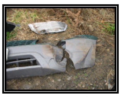
Figure 6. Damaged left aspect of front bumper fascia