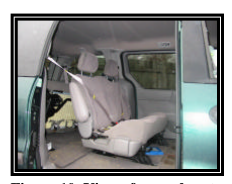
Figure 10. View of second seat restraints

rings. The second seat left D-ring was in the full-down position and the second seat right D-ring was 2.5 cm (1.0") below the full-up position at the time of the vehicle inspection. There were no abrasions on either second seat D-ring or latch plate. The left position 3-point lap and shoulder belt was permanently anchored to the floor. The second seat right seat belt was anchored to the right rear side aspect of the seat with a latch plate and buckle mechanism. Multiple creases were noted on the webbing indicative of a child safety seat installation, and both second seat belts exhibited multiple lateral fold patterns on the webbing which were not consistent with occupant positions and did not appear to be crash related.