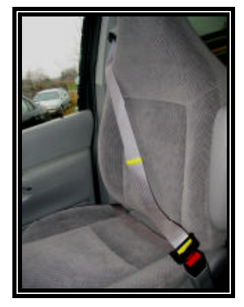
Figure 9. View of front right manual restraint

The front seat positions in the 2002 Ford Windstar were equipped with manual 3-point lap and shoulder belts and inertial lock/belt sensitive, load limiting retractors. The driver's manual restraint was configured with a sliding latch plate and the remaining manual restraints were configured with lightweight locking (cinching) latch plates. The front right lap and shoulder belt was also equipped with a switchable/automatic locking retractor (ALR). Both front manual restraints were configured with retractor pretensioners located in the lower B-pillars. Although both front seat restraints were restricted in the used position and it is highly likely that both front seat belt pretensioners fired, it could not be confirmed with certainty due to their position in the retractors. The driver's adjustable D-ring was in the full-down position and the front right D-ring was 2.5 cm (1.0") below the full-up position at the time of the vehicle inspection. The driver's D-ring and latch plate were abraded from occupant loading and pretensioner