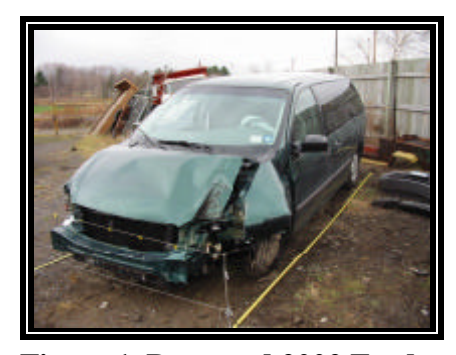
Figure 1. Damaged 2002 Ford Windstar

This on-site investigation focused on the Advanced Occupant Protection System (AOPS) in a 2002 Ford Windstar. The Windstar was occupied by a 38-year-old female driver, a 12-yearold male front right passenger, an 8-year-old male second seat left passenger, and a 1-year-old female seated in an unspecified CSS. The driver and children were restrained by the manual 3-point lap and shoulder belts. The Windstar was involved in a run-off-road crash and struck a non-breakaway sign post, a telephone junction box, and a utility pole ( Figure 1 ). The impact fractured the utility pole. Impact also resulted in the firing of the front seat belt pretensioners and the deployment of the driver's frontal air bag in the Windstar. A weight sensor was present in the front right seat of