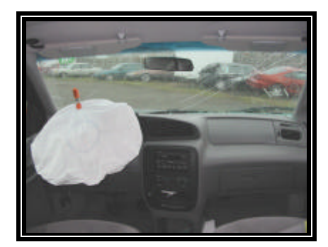
Figure 11. Deployed driver's air bag

The driver's air bag deployed as a result of the utility pole impact ( Figure 11 ). The air bag deployed from the center of the steering wheel from asymmetrical H-configuration module cover flaps. The top flap measured 15.2 cm (6.0") in width at the top aspect and 7.6 cm (3.0") in height. The width at the tear seam measured 16.8 cm (6.6"). The bottom flap measured 10.2 cm (4.0") in width at the bottom aspect and 4.4 cm (1.8") in height. The driver's air bag measured 53.3 cm (21.0") in diameter in its deflated state. The air bag was vented by two circular ports that measured 2.5 cm (1.0") in diameter and were located in the 12 o'clock sector 7.0 cm (2.8") from the seam. The air bag was tethered by two internal straps at the 12 and 6 o'clock positions that measured 11.4 cm (4.5") in width.