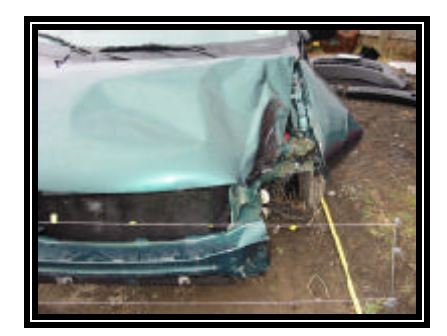
Figure 7. Direct damage from pole impact

The direct contact on the hood began 45.7 cm (18.0") left of center and extended laterally 38.1 cm (15.5") to the left front fender ( Figure 7 ). The combined direct and induced damage involved the entire frontal width of the Windstar. The multiple frontal impacts and overlapping nature of combined direct and induced frontal damage necessitated a single crush profile. The total combined direct and induced damage length measured 125.1 cm (49.3") along the bumper beam. Crush measurements were documented at the level of the bumper beam and at the upper radiator support. The residual maximum crush was located at the front left corner of the bumper beam at C1 and was approximately 13 cm (5"). The maximum crush