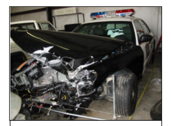
Figure 4. Front left view of damaged Crown Victoria

The 2003 Ford Crown Victoria sustained moderate frontal damage as a result of the impact with the Dodge Intrepid. The direct contact damage involved the entire frontal width of the vehicle ( Figures 4 and 5 ). The combined direct and induced damage measured 79 cm (31") across the bumper beam and the maximum crush measured 57 cm (22") and was located at C2. The left fender and left frame rail were pulled inward as a result of the Intrepid's momentum across the front of the Crown Victoria. The lateral displacement measured approximately 51 cm (20") at the forward edge of the left front fender. The hood was displaced to the right and buckled rearward and upward on the right side. Direct contact abrasions were present on the leading edge of the left corner of the hood. The grille, bumper fascia, and head lamps were separated from the vehicle. Six crush measurements were documented along the front bumper beam of the Crown Victoria and were as follows: C1 = 45 cm (18"), C2 = 57 cm (22"), C3 = 56 cm (22"), C4 = 36 cm (14"), C5 = 22 cm (9"), C6 = 8 cm (3"). The Collision Deformation Classification (CDC) for the frontal impact with the Dodge Intrepid was 10-FDEW-2.