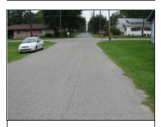
Figure 3. Northbound approach for the 2000 Dodge Intrepid

The front aspect of the Crown Victoria impacted the right side aspect of the Dodge Intrepid. Impact resulted in moderate damage to both vehicles and was sufficient to deploy the redesigned frontal air bags in the Intrepid and the driver's air bag in the Crown Victoria. The damage algorithm of the WinSMASH program calculated a total delta-V of 21 km/h (13 mph) for the Crown Victoria and a total delta-V of 23 km/h (14 mph) for the Intrepid. The longitudinal and lateral components for the Crown Victoria were -7 km/h (-4 mph) and 20 km/h (12 mph), respectively. The longitudinal and lateral components for the Intrepid