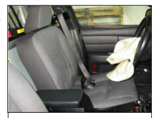
Figure 9. View of driver's safety belt in the Crown Victoria

The 2003 Ford Crown Victoria was equipped with manual 3-point, continuous loop, lap and shoulder belts with sliding latch plates. The driver's safety belt (Figure 9) was configured with a belt-sensitive, emergency locking retractor (ELR). The remaining safety belts were configured with belt-sensitive, switchable ELR/automatic locking retractors (ALR). The front seat manual restraints utilized adjustable Drings that were both in the full-down positions. The rear outboard restraints retracted into the inboard aspects of the C-pillars, and the center safety belt retracted into the retractor housing located on the center aspect of the rear deck above the seat back.