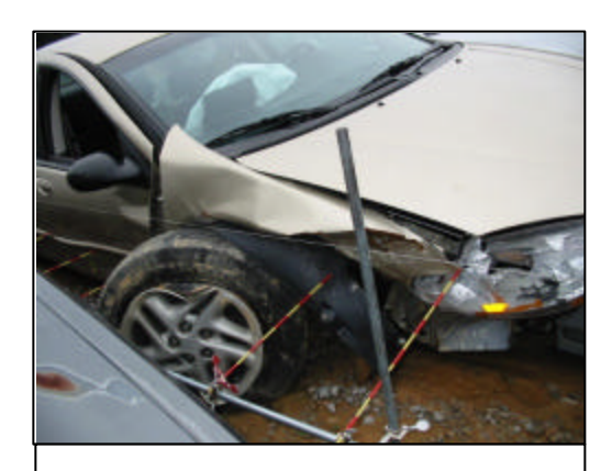
Figure 8. Close-up of right front damage

The secondary impact with the concrete curb resulted in a small fracture and abrasion on the left front wheel cover and scuffing on the sidewall of the left front tire. from contact with the curb. The CDC for the curb impact was 12-FLWN-3.