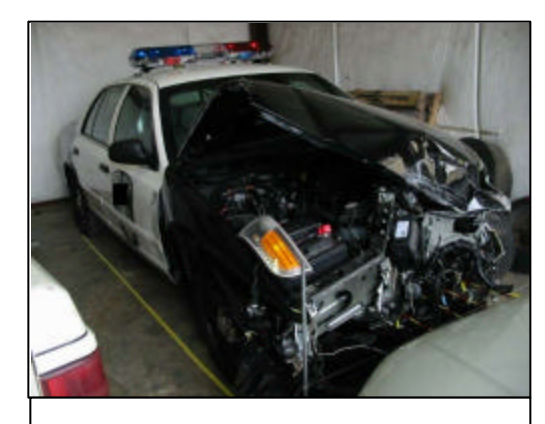
Figure 5. Front right view of damaged Crown Victoria