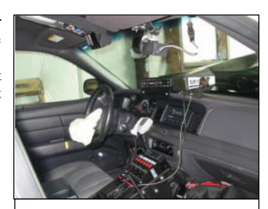
Figure 6. Interior view of the Crown Victoria

Interior damage to the Ford Crown Victoria was minor ( Figure 6 ). There was no integrity loss and no damage to the laminated windshield or vehicle glazing. There was no passenger compartment intrusion. Occupant contact was identified on the left front door armrest from probable interaction with the driver's left arm.