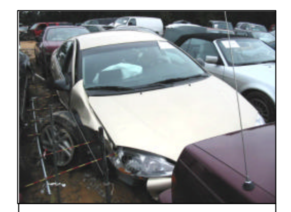
Figure 7. Front right view of damaged Dodge Intrepid