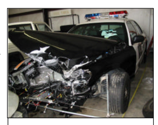
Figure 1. Damaged 2003 Ford Crown Victoria

This remote investigation focused on the performance of the Advanced Occupant Protection System (AOPS) in a 2003 Ford Crown Victoria police vehicle. The AOPS consisted of dual-stage frontal air bags, a front left seat track sensor, a front right passenger seat sensor for front right passenger air bag suppression, retractor pretensioners, and an Event Data Recorder (EDR). The Crown Victoria ( Figure 1 ) was involved in an intersection crash with a 2000 Dodge Intrepid. The crash resulted in moderate frontal damage to the Crown Victoria and was sufficient to deploy the first stage of the driver's air bag and driver's seat belt pretensioner. The Crown Victoria was occupied by a 63-year-old