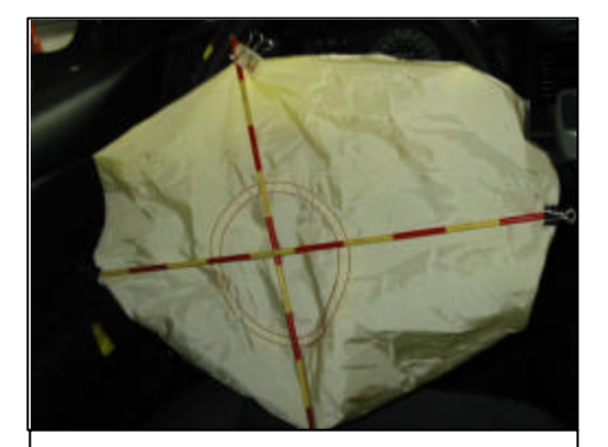
Figure 10. View of the deployed driver's air bag

The 2003 Ford Crown Victoria was equipped with dual-stage frontal air bags for the driver and front right passenger positions. The air bag system was equipped with a front left seat track position sensor. The front right seat was equipped with a sensor in the front right passenger seat cushion that was designed to suppress the front right passenger's air bag based on the weight of the front right occupant. The EDR "System Status At Deployment" section showed an air bag "Fire" command for Unbelted Stage 1 and Belted Stage 1, which suggested that the first stage of the driver's air bag would have deployed whether or not the driver was utilizing the safety belt. Given the restraint usage by the driver and the unoccupied front right seat, the EDR