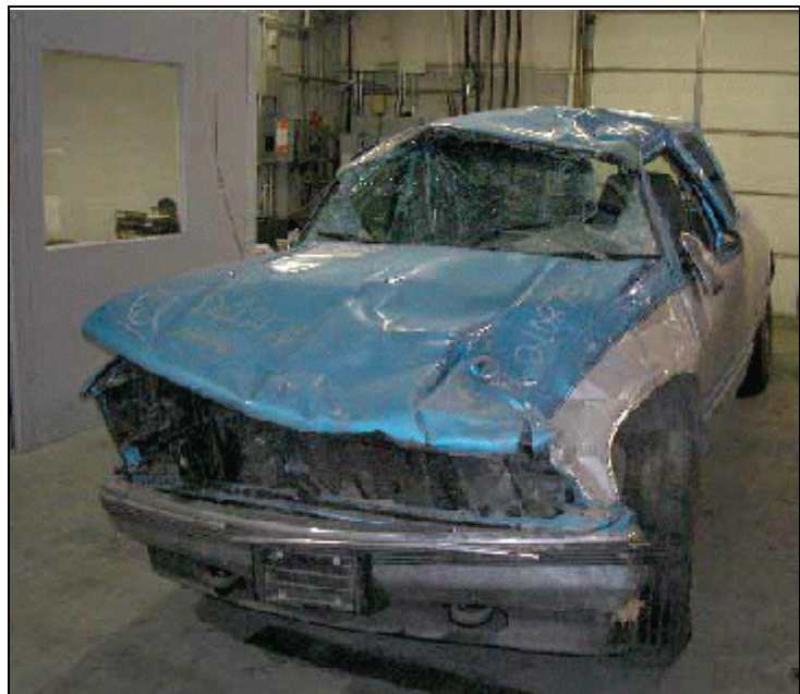
Figure 3. Front left, case vehicle