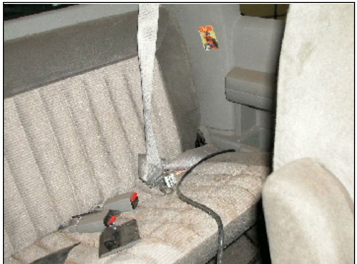
Figure 6. Left rear seat