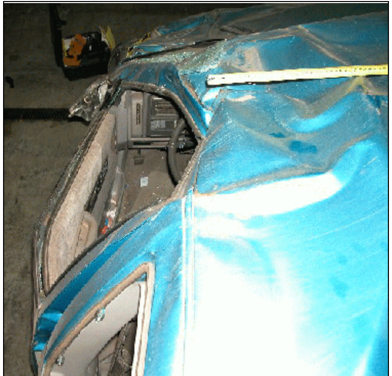
Figure 10. Top view, shows occupant loading to left door

The 7-year-old male right rear occupant was seated in a forward facing fashion. He was wearing the available lap and shoulder belt. This occupant reacted to the steering maneuvers by first shifting to the right, then to the left. His side-to-side movement was likely limited to some degree by the vehicle structure on the right and the middle child safety seat. As the vehicle tripped and completed the first 3/4 roll, he would have responded by pitching sharply to the left. There were no indications of occupant contact.