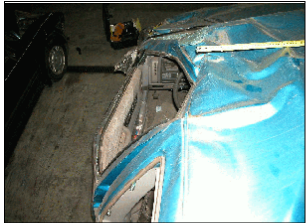
Figure 5. Top view, showing lateral crush to roof rail and outward bowing of the driver's door