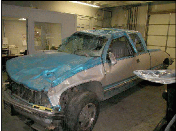
Figure 4. Left side, case vehicle

The rear left and rear middle occupants were transported to the hospital by ambulance in their respective child seats. They were examined and released that same day.