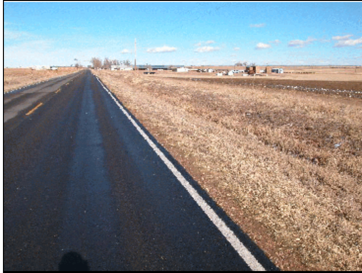
Figure 2. Area of rollover

The case vehicle traveled off the right side of the roadway. The driver steered left and returned to the roadway. The vehicle continued into the opposing travel lane. The driver steered right and traveled off the right side of the roadway. The driver steered again to the left, but the two right side tires tripped and the vehicle began a right side leading rollover about the longitudinal axis (00TDDO2). Police report that the vehicle rolled two complete turns before coming to rest on its wheels facing west.