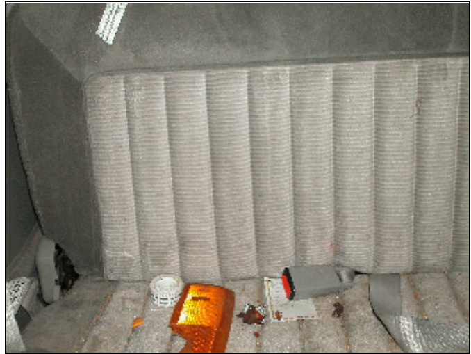
Figure 7. Right rear seat

The child seats were never located. The driver purchased new seats since the crash and does not know what had become of the seats. The child seats were not with the vehicle at the time of the inspection. The salvage facility indicated that it is their policy to destroy any unaccounted for child seats so that they cannot be reused. The driver did not know the makes and models of the old seats, but did indicate that she was the original owner of each. A child safety seat questionnaire was completed.