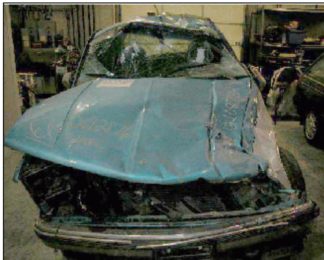
Figure 9. Front, case vehicle

Description: 1993 GMC Sierra extended cab pickup VIN: 2GTEK19K8P1xxxxxx Odometer: Unknown (electronic display) Engine: 5.7L/V8 Reported Defects: None Cargo: Two child seats Damage Description: Major rollover damage to roof, left side, truck bed. Vehicle towed from scene due to damage. Vehicle declared a total loss by insurance company. CDC: 00TDDO2 Delta V: Total Unknown Longitudinal Unknown Latitudinal Unknown Energy Unknown