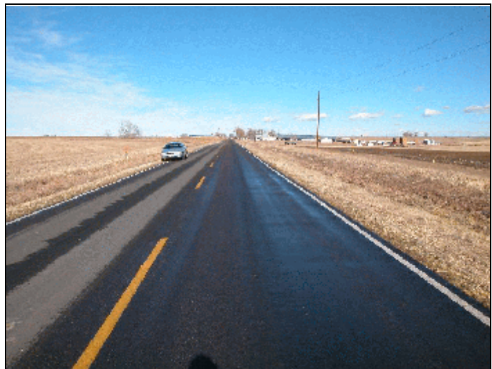
Figure 1. Approach to area of rollover, facing north

The case vehicle is a 1993 GMC Sierra 1500 four-wheel drive pick-up driven by a restrained 28-year-old female (155 cm/61 in, 52 kg/115 lbs). The driver was seated in a fabric covered bucket seat. The seat had been adjusted to the middle track position. There were three of her children also in the vehicle in the rear bench seat.