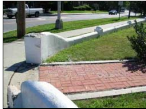
Figure 4. View of struck wall

the Explorer struck the ground during the rollover event. During the rollover event, the front right passenger's right arm was partially ejected through the right front window. The Explorer rolled onto its roof and left side across the southwest corner of the intersection toward the cemetery walkway and concrete wall. The Explorer rolled onto the southwest corner with its left side and struck the south edge of the concrete wall (at the walkway) with the left rear side aspect, which fractured the struck portion of the wall. The Explorer rolled to an upright attitude and the undercarriage (gas tank and muffler, forward of the rear axle) struck the north edge of the wall (at the walkway). The Explorer came to rest straddling the brick walkway and opening in the wall ( Figure 4 ). The Nissan Pathfinder rotated CCW and came to rest near the center aspect of the intersection.