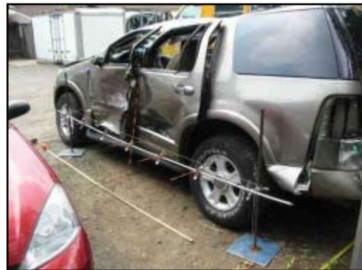
Figure 5. Left side damage to the Ford Explorer

The 2002 Ford Explorer sustained moderate left side damage as a result of the initial impact with the 1991 Nissan Pathfinder ( Figure 5 ). The direct contact damage began 110 cm (43") forward of the left rear axle and extended 115 cm (45") forward along the left side. The maximum crush measured 15 cm (6") and was located at C5; 194 cm (76") forward of the left rear axle. The left front door and left rear door sustained lateral crush, paint transfers and longitudinal abrasions. The direct contact damage was concentrated below the beltline and on the mid and lower aspects of the left doors. The cladding on the front left door was separated and the cladding on the left rear door was partially separated. Both left side doors were slightly displaced, although it appeared that rescue attempts with hydraulic tools might have contributed to the longitudinal deformation and displacement. The combined direct and induced damage began 60 cm (24") forward of the left rear axle and extended 240 cm (94") forward along the left side. Six crush measurements were