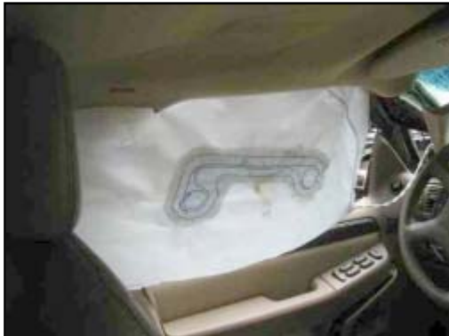
Figure 12. Left side IC (front aspect)

The 2002 Ford Explorer was equipped with side impact inflatable curtains (IC) that were designed to deploy in the event of a side impact. The left side IC deployed as a result of the initial side impact and the right IC deployed during the rollover event as the right side of the Explorer impacted the ground. The IC’s ( Figures 12 and 13 ) deployed downward from the left roof side rail through a separation in the outboard aspect of the headliner that measured 145 cm (57”) in length between the left A- and C-pillars. Each IC was rectangular in shape and measured 150 cm (59”) in length and 37 cm (15”) in height. Each IC was tethered on the forward aspect by rope-type tethers. The right side IC tether had been cut by rescue personnel. There was no occupant contact evidence on either IC.