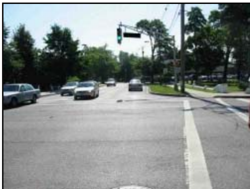
Figure 2. Eastbound approach for the Ford Explorer

The 54-year-old male driver of the 2002 Ford Explorer was operating the vehicle in an eastbound direction on the two-lane roadway on approach to the four-leg intersection ( Figure 2 ). The three-phase traffic signal was in the green phase for east/west traffic. The driver of the 1991 Nissan Pathfinder was operating the vehicle in a southbound direction on approach to the intersection ( Figure 3 ). The three-phase traffic signal was in the red phase for north/south traffic. As the Explorer was passing through the intersection, the driver of the Pathfinder disregarded the red traffic signal and proceeded into the intersection.