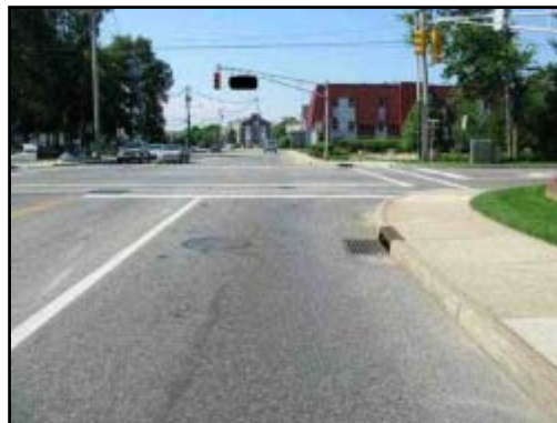
Figure 3. Southbound approach for the Nissan Pathfinder