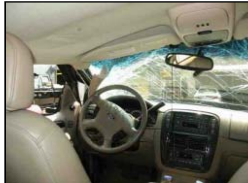
Figure 10. View of driver's seating area and vertical intrusion

The 2002 Ford Explorer sustained moderate interior damage as a result of passenger compartment intrusion and occupant contact. Integrity loss occurred in the holed windshield and the front and rear side windows. The knee bolster was displaced and exhibited a scuff mark from contact with the driver’s left knee. The intrusion of the roof on the left aspect ( Figure 10 ) allowed the driver’s head to contact the headliner, evidenced by a scuff mark above the driver’s position. The left front interior door panel was displaced around the release handle, possibly a result of contact with the driver’s left leg. The intruded roof contacted the top aspect of the driver’s head restraint. Multiple passenger compartment intrusions were documented by the NASS researcher as follows: