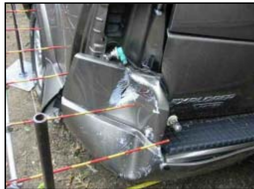
Figure 7. Close-up of left rear damage from wall contact

The left rear corner impact with the concrete wall resulted in minor damage to the left rear bumper corner and left rear quarter panel ( Figure 7 ). The direct contact began at the left rear bumper corner and extended 30 cm (12”) forward along the left side plane. The direction of force was non-horizontal and resulted in the lateral and upward displacement of the left rear bumper corner. There was no structural involvement. The combined direct and induced damage began at the left rear bumper corner and extended 93 cm (37”) forward. The left rear tail light assembly was separated. The CDC for the left rear corner impact to the concrete wall was 00-LBEE-3.