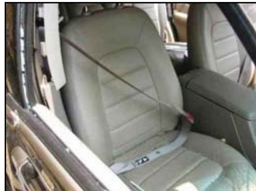
Figure 11. View of front right passenger's safety belt

The 2002 Ford Explorer was configured with manual 3-point lap and shoulder belts for the front seat positions. Both were configured with sliding latch plates and adjustable D-rings that were in the full-down positions. The driver's safety belt was configured with an Emergency Locking Retractor (ELR) and the front right passenger's safety belt was configured with a switchable ELR/Automatic Locking Retractor (ALR). Both front safety belts were configured with buckle pretensioners that did not actuate in this crash. The NASS researcher did not document any loading evidence on the safety belt webbing for the front seat occupants. The NASS researcher documented a scuff mark on the driver's lap belt, and scuff marks on the front right passenger's lap and shoulder belts. Minor deformation was noted to the driver's and front right passenger's shoulder belts from occupant loading in the NASS photographs.