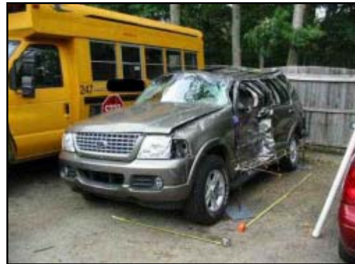
Figure 1. Damaged 2002 Ford Explorer

Notification of the crash was provided to the General Dynamics SCI team by the General Dynamics NASS Zone Center during a quality control review of the case. A summary of the crash was forwarded to NHTSA and the case was assigned as a remote investigative effort on April 14, 2004. The SCI effort involved the review of the NASS EDS file and preparation of a narrative report.