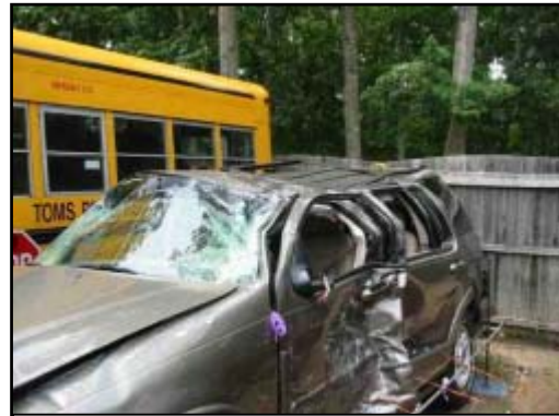
Figure 6. Rollover damage

The Explorer sustained moderate damage as a result of the subsequent rollover. Both right side tires were debanded and gouges were present on both alloy wheels from direct contact with the roadway surface. Angled abrasions were present on the entire length of the right side plane. Heavy lateral abrasions were present on the top aspect of the right A-pillar and right roof side rail. The roof sustained abrasions and the luggage rack was fractured and partially separated. The left aspect of the windshield header and the left roof side rail were crushed vertically from the rollover event ( Figure 6 ). The windshield sustained fractures and was holed on the top right aspect as a result of the left A-pillar and windshield header deformation. The top aspects of the left front and left rear doors were deformed vertically as a result of the rollover. The CDC for the rollover event was 00-TDDO-3.