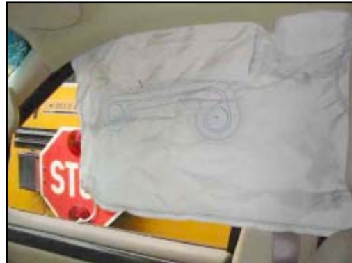
Figure 13. Right side IC (front aspect)