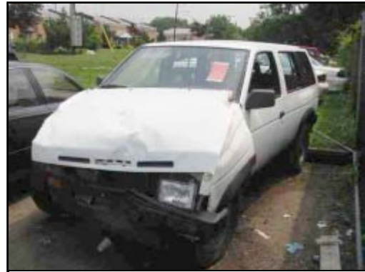
Figure 9. Damaged 1991 Nissan Pathfinder

The 1991 Nissan Pathfinder sustained moderate frontal damage as a result of the impact with the Ford Explorer. The direct contact damage began on the front right bumper corner and extended laterally across the entire frontal plane. Although the NASS researcher was unable to document a frontal crush profile, the maximum bumper crush was estimated to be 38 cm (15”). The entire frontal structure was shifted to the left due to the forward momentum of the Ford Explorer. The hood also sustained longitudinal buckling as a result of the frontal impact. The CDC for the impact with the Ford Explorer was 01-FDEW-2. The CDC was incremented by 80 to account for the end shift to the left, and the revised CDC was 81-FDEW-2. Six crush measurements were estimated along the front bumper from NASS photographs as follows: C1 = 0 cm, C2 = 10 cm (4”), C3 = (8”), C4 = 25 cm (10”), C5 = 30 cm (12”), C6 = 38 cm (15”).