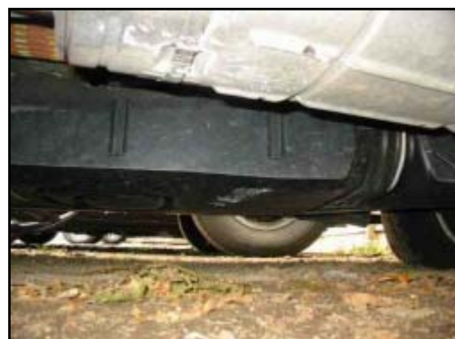
Figure 8. View from left side showing contact to fuel tank and muffler

The Explorer sustained minor undercarriage damage as a result of the undercarriage contact with the landscape wall as it came to rest.