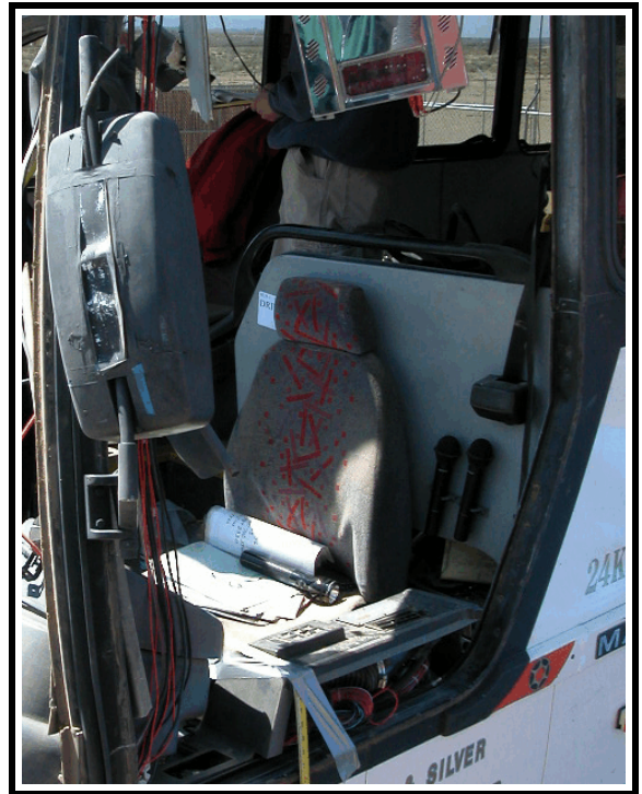
Figure 11. Driver seated position

The 41-year-old female seated in bus row 1 in the left window seat was not restrained. At impact, she initiated a forward trajectory and engaged the wall that separates the driver from the passengers with her arms and knees. She sustained an indirect femur fracture and an indirect ulna fracture, in addition to minor contusions and lacerations to her lower and upper extremities. She was removed from the vehicle by rescue personnel due to her injuries. She was transported to a local trauma center by air. She arrived with a GCS score of 15. She was hospitalized for 11 days.