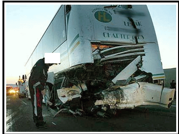
Figure 2. Other vehicle (Bus 2)