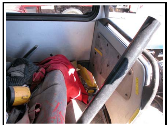
Figure 12. Contacts to separating wall–row 1, left seat–Occupant 2

The 53-year-old female seated in bus row 2 in the left aisle seat was not restrained. At impact, she initiated a forward trajectory and engaged the seat base in front of her with her right lower leg, causing a comminuted tibia/fibular fracture. She was entrapped in the vehicle by seats that came loose during the crash. She was transported from the scene to a local trauma center where she was hospitalized for four days.