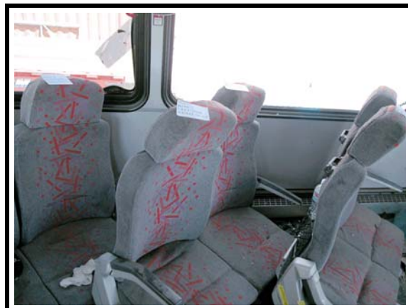
Figure 13. Typical seat movement

The 72-year-old female seated in bus row 4 right aisle seat. She was not restrained. At impact, she initiated a forward trajectory and engaged the seat back with her left shoulder, causing a left shoulder dislocation. She was transported to an area trauma center where she was hospitalized for one day.