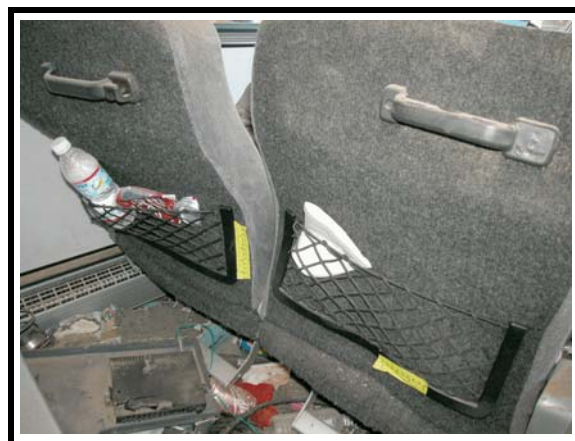
Figure 14. Common injury contact pattern (seat back and seat base)

The 72-year-old female seated in bus row 5 left aisle seat was not restrained. At impact, she initiated a forward trajectory and engaged the seat back with her right leg and knee. She sustained lateral and medial meniscus tears to the right knee and a displaced/comminuted fracture to the right tibia. She was transported to an area trauma center where she was hospitalized for nine days.