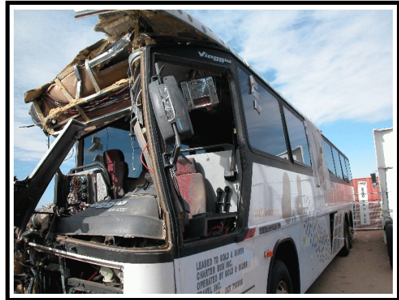
Figure 3. Front left, case vehicle

All the passenger seat units (with the exception of the left side row 14 seat unit and the right side row 12 unit) failed to one extent or another (see Table 2). There were three types of failures: complete separation on the outboard side, partial separation on the inboard side, and complete separation on the inboard side. All the failed seats separated on the outboard side. This caused the seat to begin to pivot forward (clockwise on the left, counterclockwise on the right) about the floor mounted stanchion. In most cases the seat rotated at least 45 degrees. Many of the seats showed evidence of occupant loading from the rear. As the movement continued, the stanchions began to separate from the floor. It appears that nine of the seat units completely separated from the vehicle.