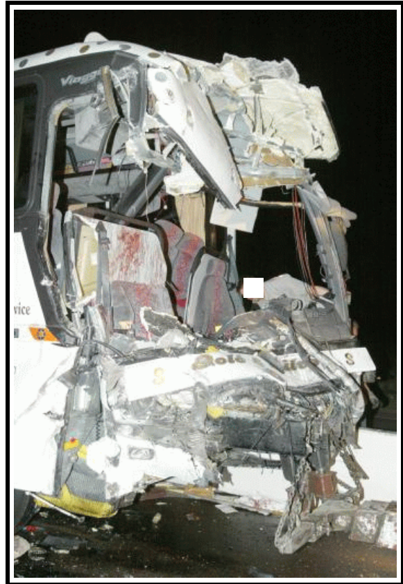
Figure 1. Case vehicle (Bus 1)