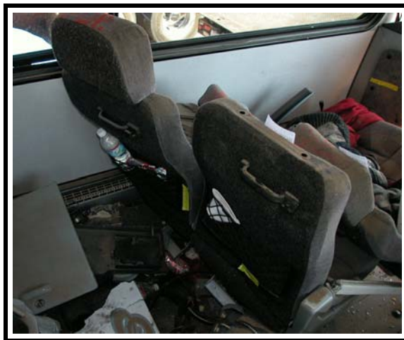
Figure 9. Example of occupant loading from the rear