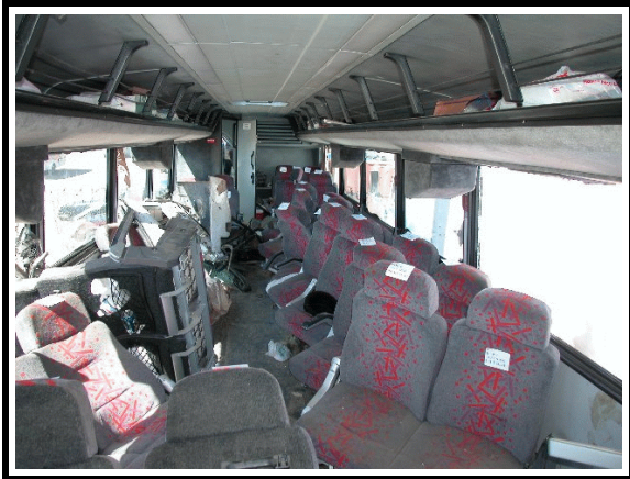
Figure 7. Looking towards rear of bus (shows seat rotation)