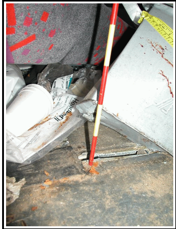
Figure 5. Inboard seat unit pedestal, partial separation

The passenger seats were composed of a seat frame containing two individual seat positions; each position had a seat bottom cushion, an integral headrest, and an armrest. The seat frame was attached to an aluminum track on the interior sidewall by two C-clamps. A single pedestal offset from the frame center was attached to the floor track by two T-bolt fasteners. The seating was designed so that the seating arrangement can be changed (number of seats and distance between rows). The seats can essentially be moved forward and backward after the bolts are loosened.