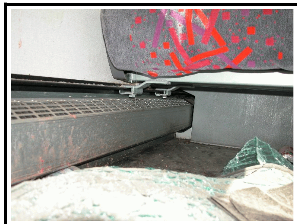
Figure 6. Outboard seat unit attachment