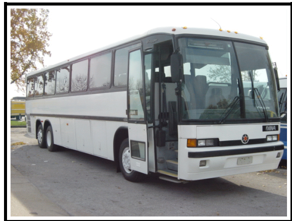
Figure 4. Exemplar view of case vehicle