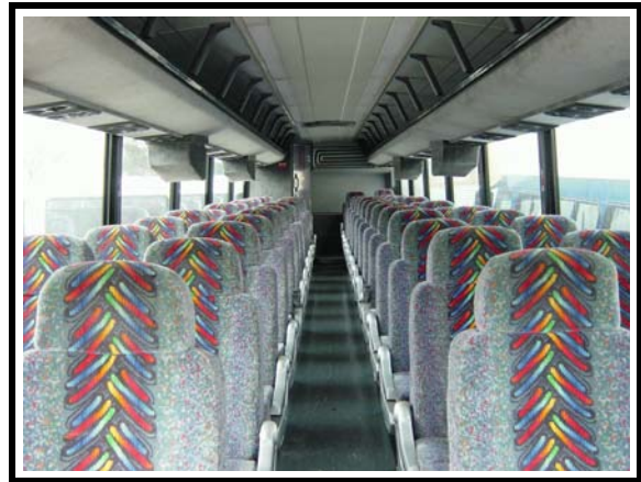
Figure 8. Exemplar view, looking towards rear of bus