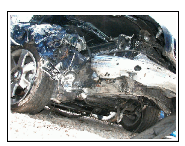
Figure 6. Front right, case vehicle (impact 1)

The case vehicle sustained direct contact damage from the first impact that began at the front right bumper corner and extended 36.0 cm (14.2 in) along the front. The residual crush measured on the bumper reinforcement bar was as follows: C1=0 cm (0 in), C2=0 cm (0 in), C3=0 cm (0 in), C4=44.0 cm (17.3 in). The maximum crush was into the pocket beyond the end of the bumper corner and measured 118 cm (46.4 in). The right side wheelbase was shortened by 69.0 cm (27.2 in). There was minor contact damage to the right passenger area from contact with a tree/bushes. There was intrusion into the passenger compartment from the initial impact through the right instrument panel, right toe pan, and right A pillar.