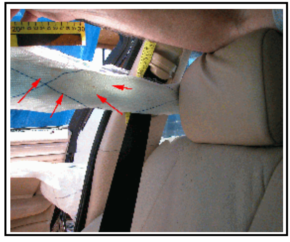
Figure 13. Make-up contacts to ITS and B pillar

switchable retractor that was in ELR mode. The shoulder belt upper anchorage was adjusted to the full down position. Both feet were presumed to be on the floor. The driver was actively steering the