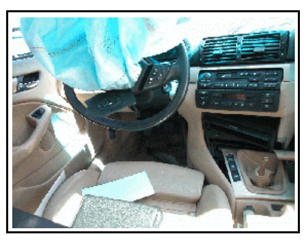
Figure 11. Driver's seated position

The 21-year-old female front right occupant was seated in a forward facing fashion. She was seated in a leather covered bucket seat; the seat had been adjusted to the mid track position. She was using the available type 2 lap and shoulder belt with a