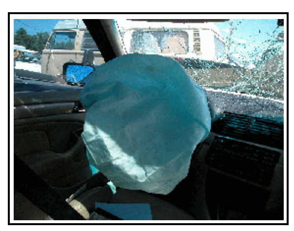
Figure 8. Driver's air bag