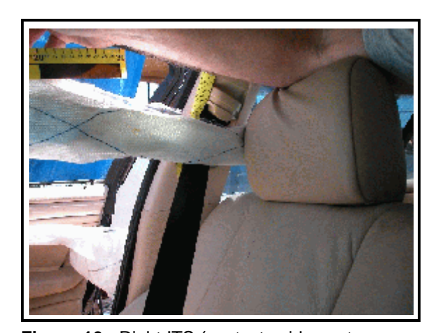
Figure 10 . Right ITS (contact evidence to structure and B pillar)

the bottom, and 19.0 cm (7.5 in) high. There was no contact evidence on the cover flap or air bag.