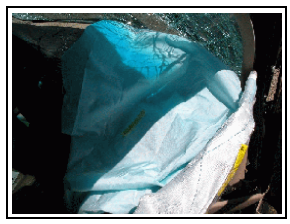
Figure 9. Front right passenger air bag

The side air bag was door mounted. The trapezoid shaped cover measured 23.0 cm (9.0 in) wide by 11 cm (4.3 in) high. The air bag measured 43.0 cm (16.9 in) wide at the top, 25.0 cm (9.8 in) wide at