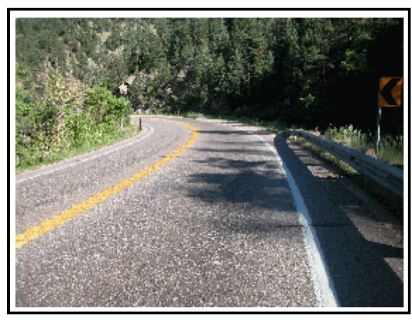
Figure 1 . Approach to area of road departure/off road impact (south)

This single vehicle crash occurred in June, 2003 at 0100 hours in a mountainous area of Colorado. The crash occurred off-road. The north/south asphalt roadway approaching the roadway departure is two-way, curved to the left, and has a positive 2.5% grade. The curve had a radius of 55.4 m (182.0 ft) and a critical speed of 67.4 km/h (41.9 mph)<sup>1</sup>. The roadway was wet. It was dark at the time of the crash and there were no streetlights available. To the right of the roadway is a dirt shoulder followed by a grass/dirt embankment with a 37% downgrade. The speed limit is 64 km/h (40 mph).