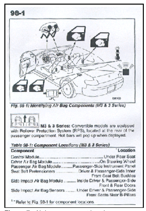
Figure 7 . Air bag component locations