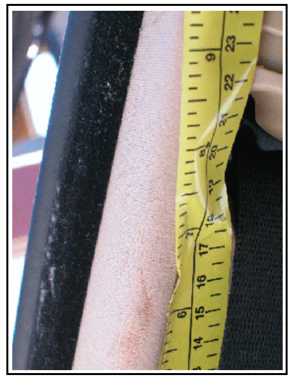
Figure 15 . Close up of contact to middle of B pillar