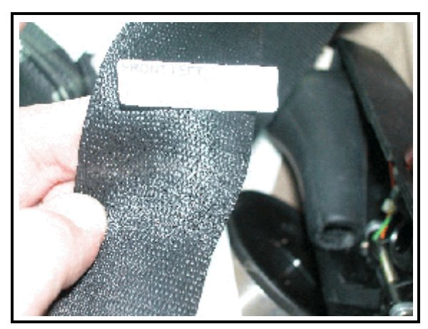
Figure 12. Loading evidence on front left seat belt