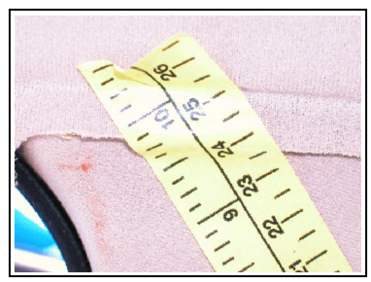
Figure 16. Close up of contact to top of B pillar