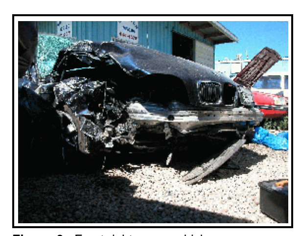
Figure 3. Front right, case vehicle

The driver and front right passenger air bags deployed and the front seat belt pretensioners fired at this point. The front right passenger door mounted side air bag and right side ITS also deployed.