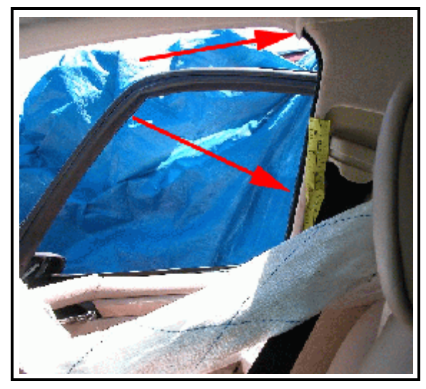
Figure 14. Make up contacts to B pillar