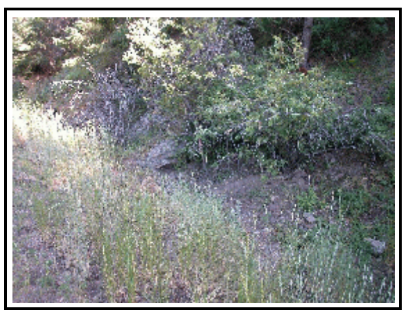
Figure 2. Impact area/final rest

The total velocity change calculated by the barrier algorithm of the WinSmash collision model was 33.0 km/h (20.5 mph)<sup>2</sup>. The longitudinal and lateral delta V components were -25.3 km/h (-15.7 mph) and -21.2 km/h (-13.2 mph), respectively.