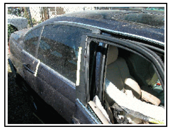
Figure 5. Right side of vehicle (impact 2)