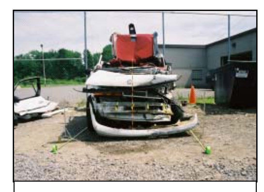
Figure 6. Frontal view of the damaged Dodge Grand Caravan