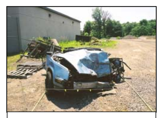
Figure 9. Frontal view of damaged Pontiac 6000

The 1988 Pontiac 6000 sustained severe damage (Figures 9 and 10) as a result of the frontal impact with the Dodge Grand Caravan. The direct damage on the bumper fascia began 11.4 cm (4.5") left of the centerline and extended 69.9 cm (27.5") to the front left corner. The bumper fascia was fractured and completely separated from the vehicle. The hood sustained direct contact abrasions and was crushed and buckled rearward. The front bumper beam exhibited two vertical fractures that were located 27.9 cm (11.0") and 54.6 cm (21.5") left of the centerline. The maximum crush at the front left corner measured 116.8 cm (46.0"). The combined direct and induced damage involved the entire frontal width of the Pontiac 6000. The vehicle frame was buckled and deformed laterally between the B- and C-pillars. The front half of the vehicle was deflected to the right, and the magnitude of the lateral deflection on the right side between the right B-pillar and right C-pillar measured 39.4 cm (15.5"). The right front fender was deflected significantly to the left. The left front wheel was crushed rearward and restricted. The entire left sill was buckled and the left front door was deformed, buckled, and pulled outward from the top aspect by rescue personnel. The frontal crush and frame deflection resulted in a 68.0 cm (26.8") reduction of the left wheelbase and a 9.0 cm (3.5")