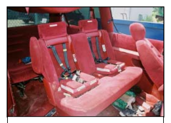
Figure 13. Lateral view of second row integrated CSS's

The 1994 Dodge Grand Caravan was equipped with two integrated forward-facing CSS's (Figure's 13 and 14) in the second row bench seat. The CSS seat cushions folded forward from the bench seat back and the CSS head restraints rotated upward from the seat back. The CSS head restraints measured 20.3 cm (8.0") in height, 29.8 cm (11.8") in width, and 5.7 cm (2.3") in thickness in the stowed position. In the used position, the CSS head restraint measured 15.2 cm (6.0") in height. A label was present on the CSS head restraint that read, "This headrest is not intended for use by an adult." A 7.6 cm (3.0") long nylon loop was present on the right aspect of each CSS that protruded from under the head restraints in the stowed position, which released the CSS seat cushions and head restraints from the seat back. The CSS head restraint locked into position when fully extended, and could be released to re-stow by pulling on the spring-loaded nylon loop. The CSS seat cushions measured 27.9 cm (11.0") in width, 33.0 cm (13.0") in length, and 7.6 cm (3.0") in height. The CSS cushions extended 21.6 cm (8.5") forward from the seat back. Horseshoe-shaped removable fabric pads were affixed to each seat cushion with Velcro fasteners, which measured 1.9 cm (0.8") thick. The