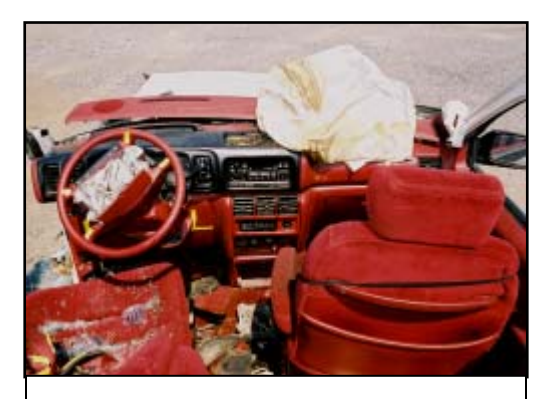
Figure 7. Overall view of damaged front seating positions

The 1994 Dodge Grand Caravan sustained moderate interior damage as a result of passenger compartment intrusion and occupant contact. Figure 7 shows the overall front seating positions and related interior damage. The left front door was jammed shut and removed by rescue personnel. The remaining doors were operational. Damage to the windshield and glazing from crash forces could not be determined. The left and right side glazing surrounding the A- and B-pillars was completely removed by rescue personnel to facilitate the removal of the left front door and the folding of the roof. The knee bolster was displaced and deformed on both sides of the steering