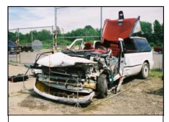
Figure 5. Damaged Dodge Grand Caravan

The 1994 Dodge Grand Caravan ( Figures 5 and 6 ) sustained severe damage as a result of the frontal impact with the Pontiac 6000. The direct damage began 5.1 cm (2.0") left of the centerline and extended 78.7 cm (31.0") to the front left bumper corner. Abrasions and paint transfers were present on the left aspect of the bumper fascia and the bumper fascia was separated from the vehicle. The bumper beam and upper and lower radiator supports were crushed rearward. The maximum crush at the bumper beam was located at the front left corner and measured 94.0 cm (37.0"). The front left aspect of the hood was deflected down and rearward from direct contact and the entire hood was rotated slightly clockwise (CW). The left rear aspect of the hood was separated. The left front fender was completely separated and the left front wheel sustained direct contact, evidenced by tears on the sidewall of the tire and abrasions on the alloy wheel. The frontal crush resulted in a 43.0 cm (16.9") reduction of the left wheelbase. Due to the post impact engagement and rotation, direct contact abrasions and paint transfers extended along the left side of the Grand Caravan beginning at the left front corner and terminating at the left B-pillar, 123.0 cm (48.4") aft of the damaged left front axle. The combined direct and induced damage involved the entire frontal width of the Grand Caravan. The bumper