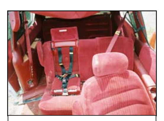
Figure 12. View of second row restraints

The second row two-person bench seat ( Figure 12 ) was configured with manual 3-point lap and shoulder belts for each seating position. Both had fixed D-ring anchors, ELR's, and cinching latch plates. The right side safety belt was configured with a steel spring clasp on the lower anchor of the lap belt portion. A plastic sleeve that measured 25.4 cm (10.0") in length and 5.1 cm (2.0") in width was located adjacent to the clasp on the webbing. The clasp engaged with one of two steel rings labeled "A" and "B". The "A" ring was located on the floor on the rear right corner aspect of the second row bench seat. The "B" ring was located on the