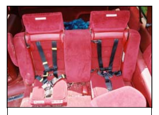
Figure 14. Overhead view of the integrated CSS's