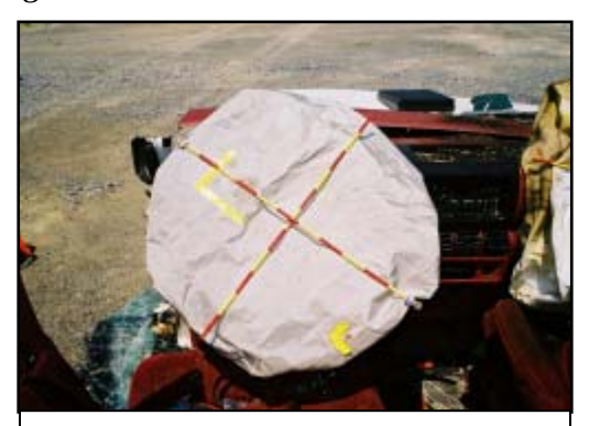
Figure 16. Deployed driver's air bag

The 1994 Dodge Grand Caravan was equipped with frontal air bags for the driver and front right passenger positions that deployed as a result of the frontal impact. The driver's air bag ( Figure 16 ) deployed from the center of the steering wheel hub from symmetrical H-configuration cover flaps. The cover flaps measured 5.7 cm (2.5") in height and 17.8 cm (7.0") in width. The driver's air bag measured 66.0 cm (26.0") in diameter. A fluid transfer (possibly body fluid) was present on the face of the driver's air bag that was vertically centered, located 7.6 cm (3.0") below the horizontal centerline, and measured 10.2 cm (4.0") in length. A small circular body fluid transfer was located 22.9 cm