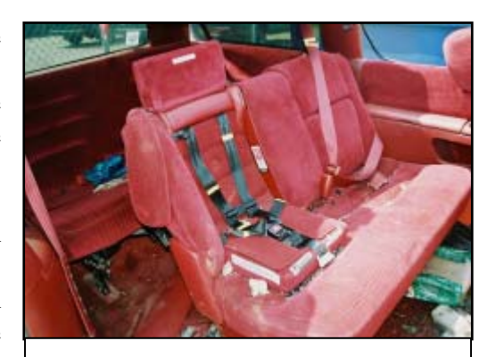
Figure 1. Integrated CSS in the 1994 Dodge Grand Caravan

This on-site investigation focused on the performance of an integrated forward-facing child safety seat (CSS) that was present in a 1994 Dodge Grand Caravan. The Grand Caravan was occupied by a 62-year-old male driver, a 33-year-old male front right passenger, a 32-year-old female left second seat passenger, and a 13-month-old female child passenger who was restrained in the second bench seat's right side integrated CSS ( Figure 1 ). All of the adult passengers were restrained by the manual 3-point lap and shoulder belts. The Grand Caravan was involved in an angled offset head-on collision with a 1988 Pontiac 6000 that crossed the centerline of a two-lane roadway. The impact resulted