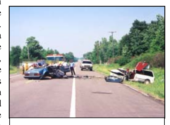
Figure 4. On-scene police photograph of crash site and final rest positions