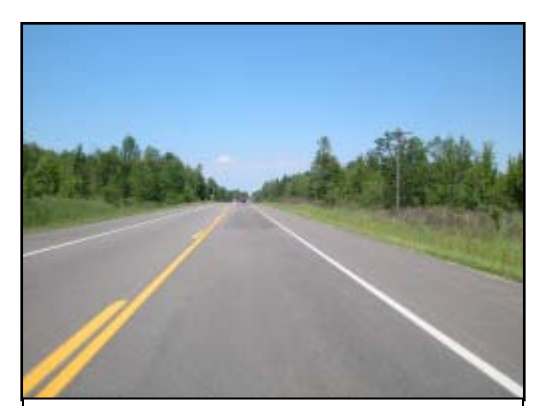
Figure 2. Eastbound approach for the Grand Caravan

The Grand Caravan impacted the Pontiac 6000 in an angled, offset, head-on configuration. The impact resulted in severe damage to both vehicles, and resulted in the deployment of the frontal air bag system in the Grand Caravan. The directions of force were in the 12 o'clock sectors for both vehicles. The damage algorithm of the WinSMASH program computed a total delta-V of 54.0 km/h (33.6 mph) for the Grand Caravan and a total delta-V of 76.0 km/h (47.2 mph) for the Pontiac 6000 based on the respective crush profiles. The vehicles remained engaged and rotated in a counterclockwise (CCW) direction. Due to the continued engagement and rotation of the vehicles, direct contact from the Pontiac 6000 extended down the left side of the Grand Caravan. Two curved tire marks from the Grand Caravan's front tires were present on the asphalt shoulder from the post-impact rotation and travel to final rest. The vehicles separated and the Grand Caravan came to rest on the grassy roadside facing northwest. The Pontiac 6000 came to rest straddling the centerline facing southeast. Final rest positions are shown in Figure 4 .