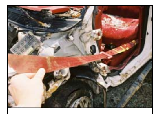
Figure 11. View of driver's cut safety

The front seating positions in the Dodge Grand Caravan were configured with manual 3-point lap and shoulder belts. Both front seat safety belts were cut by rescue personnel to facilitate the cutting of the B-pillars, folding of the roof, and extrication of the driver. The driver's safety belt was configured with a sliding latch plate, adjustable D-ring, and an emergency locking retractor (ELR). The retractor was jammed in the used position, and rescue personnel cut the driver's safety belt webbing 167.6 cm (66.0") above the lower anchorage ( Figure 11 ). The remaining webbing, which extended from the retractor, measured 50.8 cm (20.0") from the opening