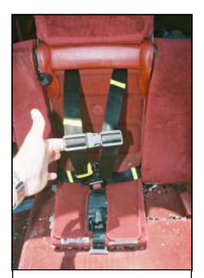
Figure 15. Close-up of harness straps of the right side integrated CSS

A 13-month-old female child was restrained in the right side integrated CSS. The left side integrated CSS was not used in this crash. At the time of the vehicle inspection, the right side CSS head restraint was found in the stowed position, and it was not known if it was engaged at the time of the crash. The harness system (Figure 15) was adjusted such that the length of the harness webbing measured 67.3 cm (26.5") between the harness slots and the lower anchors. The adjustment tab was adjusted to a residual length of 12.7 cm (5.0"). It should be noted that the left side CSS harness system (not used in this crash) was adjusted to the same parameters, and did not show signs of historical use. The pre-crash position of the harness retainer clip was unknown. The harness retainer clip did not exhibit any abrasions or deformation. Minor stretch marks were present on the harness webbing. The loading to the right harness strap began 12.1 cm (4.5") above the lower anchor and extended upward 45.1 cm (17.8"). The loading to the left harness strap began 5.1 cm (2.0") above the lower anchor