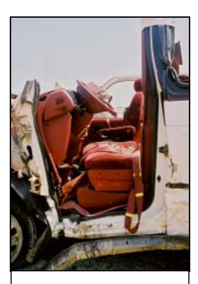
Figure 8. View of displaced driver's seat and related intrusions

column from contact with the driver's knees. The tilt steering column was compressed forward and jammed in the full-up position. The plastic cover on the bottom aspect of the steering column was fractured. The steering wheel rim was compressed forward slightly, evidenced by minor separation at the 2, 4, and 8 o'clock spoke locations. The brake pedal arm was cut and the brake pedal removed by rescue personnel to facilitate extrication of the driver. The accelerator pedal was compressed between the left aspect of the center console and the intruded left toe pan. The driver's seat was displaced left and rotated CCW on the seat base. The right instrument panel sustained a diagonal linear impression located 22.9 cm (9.0") inboard of the right instrument panel corner that measured 4.0 cm (1.5") in length. Figure 8 shows the longitudinal intrusions into the front seating positions. The floor intruded vertically from induced buckling on the left side front and second seat position areas, and measured 8.9 cm (3.5") vertically at the forward aspect of the driver's seat. Lateral intrusions included the left side panel forward of the left A-pillar,