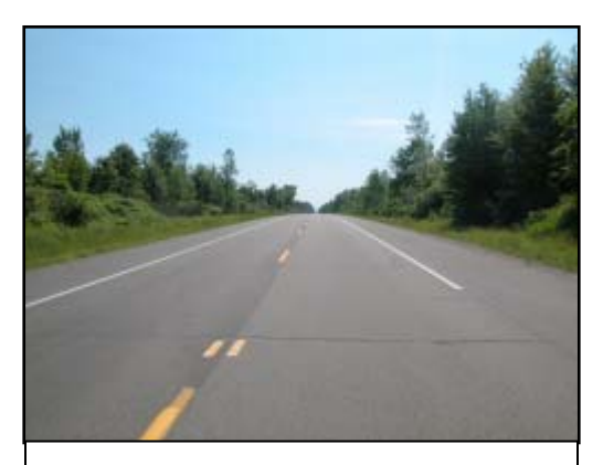
Figure 3. Westbound approach for the Pontiac 6000