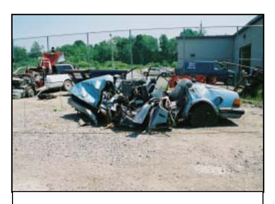
Figure 10. Left side view of damaged Pontiac 6000