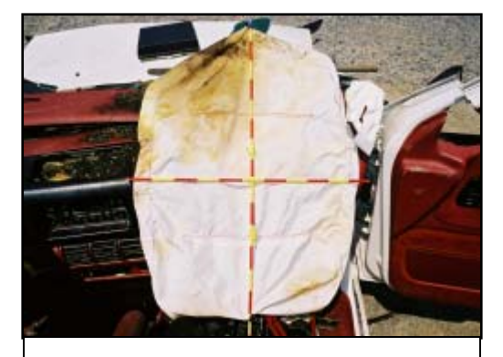
Figure 17. Deployed front right passenger's air bag

The front right passenger's air bag ( Figure 17 ) deployed from a top-mount module with a single cover flap design. The cover flap was rectangular in shape and measured 14.6 cm (5.8") in height and 30.5 cm (12.0") in width. The front right passenger's air bag measured 66.0 cm (26.0") in height and 45.7 cm (18.0") in width. The air bag was vented back through the module, as there were no vent ports located on the air bag. The air bag was tethered by two internal straps that measured 29.8 cm (11.75") in width and were located 15.2 cm (6.0") above and below the horizontal centerline of the air bag. At the time of the inspection, the top aspect of the front right passenger's air bag was