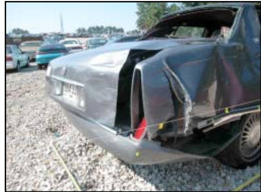
Figure 11. Close-up of the right rear damage from the Ranger

A red paint transfer from the Cadillac's pinstripe was located on the left front fender of the Ranger, which supported the right side plane damage (Figure 11). The right rear quarter panel was fractured and deformed around the taillight. The CDC for the impact with the Ford Ranger was 05-RBES-1. Although the third impact with the Ford Ranger resulted in overlapping damage to the right rear quarter panel, six crush measurements were documented along the right side of the DeVille, resulting in a single crush profile for both events. Six crush measurements were documented along the right rear aspect of the Cadillac and were as follows: C1 = 0.0 cm, C2 = 0.0 cm, C3 = 0.0 cm, C4 = 7.0 cm (2.8"), C5 = 14.0 cm (5.5"), C6 = 8.1 cm (3.2").