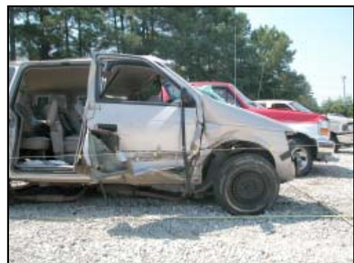
Figure 6. Right side damage showing sill deformation