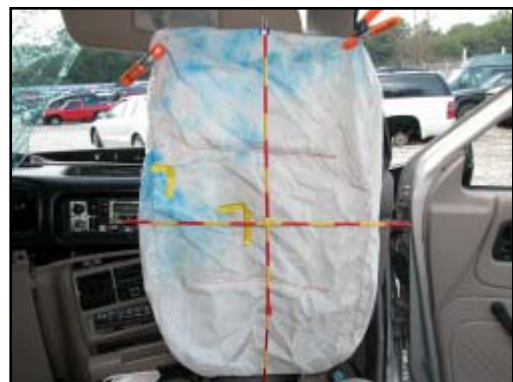
Figure 18. Deployed front right passenger's air bag

The front right passenger's air bag ( Figure 18 ) deployed from a top-mount module with a single cover flap design. The cover flap had been removed prior to the vehicle inspection and was not present in the vehicle. The front right passenger's air bag measured 66.0 cm (26.0") in height and 45.7 cm (18.0") in width. The air bag was vented through the porous bag membrane, as there were no vent ports located on the air bag. The air bag was tethered by two internal straps that measured 27.9 cm (11.0") in width and were located 12.7 cm (5.0") above and below the horizontal centerline of the air bag. The top panel and top and left side aspect of the face of the air bag exhibited blue discoloration. At the time of the vehicle inspection, the air bag and was found under the fractured