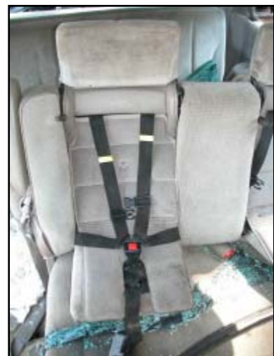
Figure 16. Second row right side integrated CSS

The left side integrated CSS was not used in this crash. A 3-year-old male child was restrained in the right side integrated CSS ( Figure 16 ). At the time of the vehicle inspection, the right side CSS head restraint was found in the upright position. The harness system was adjusted such that the length of the harness webbing measured 53.3 cm (21.0”) between the harness slots and the lower anchors. The adjustment tab was adjusted to a residual