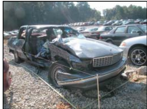
Figure 9. View of right side damage to the DeVille

The secondary sideslap impact with the Voyager resulted in moderate right rear damage to the Cadillac ( Figure 10 ). The combined direct and induced damage began at the right B-pillar and extended rearward 238.8 cm (94.0") to the right rear bumper corner. The right rear door panel and rear quarter panel sustained minor lateral crush and abrasions. A silver paint transfer was present on the right C-pillar of the DeVille from direct contact with the Voyager during the sideslap. The CDC for the sideslap event was 03-RDEW-1. Damage to the right rear quarter panel was also present from the third impact with the Ford Ranger. White paint transfers were present on the right rear corner and extended around the tail light onto the face of the trunk.