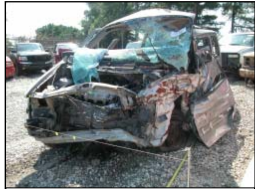
Figure 1. Damaged 1994 Plymouth Voyager

This on-site investigation focused on the performance of an integrated forward-facing child safety seat (CSS) and the frontal air bag system that was present in a 1994 Plymouth Voyager. The Voyager ( Figure 1 ) was occupied by a restrained 44-year-old female driver, a restrained 56-year-old male front right passenger, and a 3-year-old male passenger who was restrained in the integrated CSS in the second row right side. The Voyager was involved in an angled frontal collision with a 1994 Cadillac DeVille that hydroplaned and crossed the centerline of a four-lane roadway in a counterclockwise (CCW) yaw. The impact resulted in severe damage to the Voyager and was sufficient to