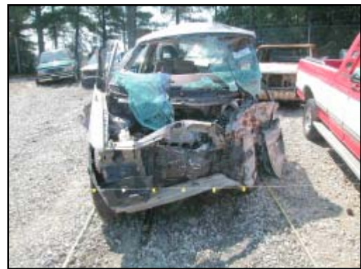
Figure 2. Frontal view of the damaged Voyager

The 1994 Plymouth Voyager sustained severe damage as a result of the multiple impacts. The direct contact damage from the initial impact with the Cadillac began on the front left corner of the bumper fascia and extended laterally 92.7 cm (36.5") across the frontal plane ( Figure 4 ). The direct contact extended vertically from the bumper fascia to the hood, and direct contact abrasions extended 31.8 cm (12.5") rearward from the