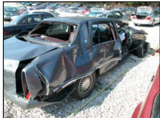
Figure 10. View of right rear damage to the DeVille

The secondary sideslap impact with the Voyager resulted in moderate right rear damage to the Cadillac ( Figure 10 ). The combined direct and induced damage began at the right B-pillar and extended rearward 238.8 cm (94.0") to the right rear bumper corner. The right rear door panel and rear quarter panel sustained minor lateral crush and abrasions. A silver paint transfer was present on the right C-pillar of the DeVille from direct contact with the Voyager during the sideslap. The CDC for the sideslap event was 03-RDEW-1. Damage to the right rear quarter panel was also present from the third impact with the Ford Ranger. White paint transfers were present on the right rear corner and extended around the tail light onto the face of the trunk.