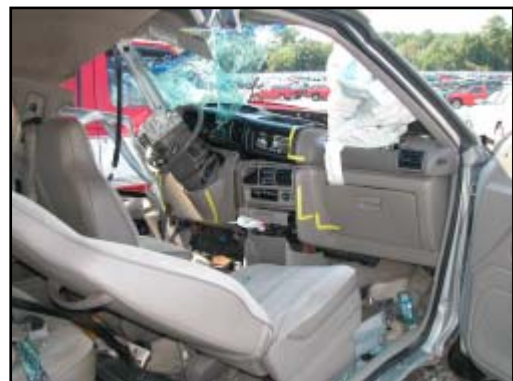
Figure 8. Interior view of front right passenger's position

The front right position also sustained interior damage ( Figure 8 ). A heavy abrasion was present on the right aspect of the upper center instrument panel from expansion of the air bag as it was compressed against the instrument panel by the front right occupant. The abrasion measured 2.5 cm (1.0") in width and 14.0 cm (5.5") in height. Two air bag-related scuff marks were located on the outboard aspect of the lower center instrument panel, immediately inboard of the glove box door. The upper scuff mark measured 5.1 cm (2.0") in width and 12.7 cm (5.0") in height. The lower scuff