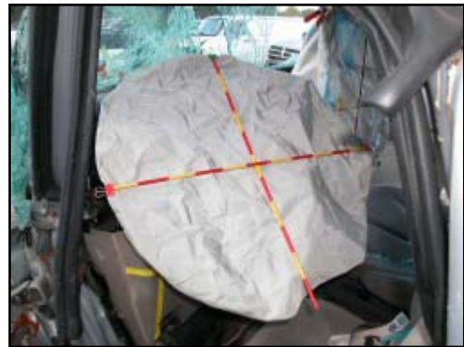
Figure 17. Deployed driver's air bag

The 1994 Plymouth Voyager was equipped with frontal air bags for the driver and front right passenger positions that deployed as a result of the frontal impact. The driver's air bag ( Figure 17 ) deployed from the center of the steering wheel hub from symmetrical H-configuration cover flaps. The cover flaps measured 5.7 cm (2.5") in height and 17.1 cm (6.8") in width. The driver's air bag measured 61.0 cm (24.0") in diameter. The driver's air bag was vented by two circular ports located at the 12 o'clock position on the rear of the air bag. The vent ports measured 2.5 cm (1.0") in diameter and were located 7.0 cm (2.8") from the circumferential seam and were spaced 5.1 cm (2.0") apart. The air bag was not tethered. The face of the air bag did not exhibit any contact evidence. The rear aspect of the air bag exhibited a moderate semi-circular scuff mark on the bottom left quadrant from compression against the steering wheel rim. The scuff mark measured 2.5 cm (1.0") in width and 22.9 cm (9.0") in length.