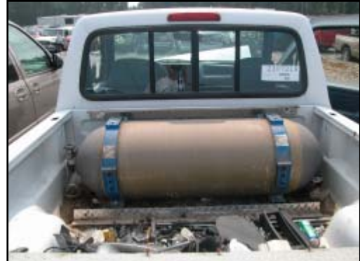
Figure 14. CNG cylinder in the bed of the Ford Ranger

The 1994 Ford Ranger pickup truck was equipped with a commercial aftermarket conversion CNG fuel system ( Figure 14 ), which augmented the vehicle's OEM unleaded fuel system. The Ranger was purchased in December 1994 as a new vehicle for business use. The CNG fuel system was installed by NGV Southeast Technology Center shortly after the vehicle was purchased. A company representative stated that the Ranger had a range of approximately 209 km (130 miles) per tank of CNG, and was refueled with CNG daily. The company was equipped with a CNG compressor, which was installed onto a quick disconnect fitting in the vehicle's grille for refueling, once the tank valve was opened. The company representative stated that there was no routine maintenance performed on the CNG system other than periodic adjustments of the timing system, and that the CNG storage tank had not been pressure tested.