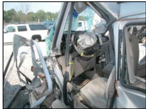
Figure 7. Interior view showing intrusions and contacts in the driver's position

The Plymouth Voyager sustained severe interior damage as a result of passenger compartment intrusion and occupant contact. The driver's space was reduced as a result of intrusion ( Figure 7 ). The left, right, and bottom aspects of the steering wheel rim were deflected forward from driver loading. The maximum deflection measured 15.2 cm (4.0") at the 6 o'clock position. An abrasion was present on the bottom aspect of the steering wheel rim that began at the spoke located at the 8 o'clock position and extended CCW 15.9 cm (6.3"). The top of the steering wheel rim was engaged against the top aspect of the left instrument panel. The intrusion of the left instrument panel combined with the driver's forward loading resulted in steering column compression and upward deflection. The outboard corner of the knee bolster sustained an area of longitudinal scuff marks from engagement against the displaced left front door. The scuff marks measured 3.4 cm (2.5") in width and 21.6 cm (8.5") in height. A scuff mark was centered on the top aspect of the knee bolster from the driver's knee that measured 14.0 cm (5.5") in width and 16.5 cm (6.5") in height. The driver's seat track was jammed as a result of the crash, and the seat cushion was buckled longitudinally and rotated inboard 10 degrees.