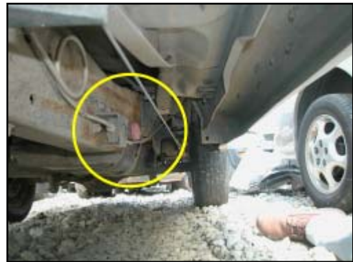
Figure 15. View looking rearward of aluminum tubing and ball valve on the left frame rail

The CNG system consisted of a pressurized fiberglass-wrapped, aluminum, cylinder that was rated to 3,000 PSI. A valve was present on the left aspect of the cylinder (relative to the vehicle) with a pressure gauge fixed to the valve assembly that was rated to 700,000 kPa (10,000 PSI). A section of 0.6 cm (1/4") diameter aluminum tubing delivered the CNG to the engine compartment through the pickup truck bed, forward along outboard aspect of the left frame rail, and to a pressure regulator in the engine compartment. A ball-valve ( Figure 15 ) was present on the aluminum delivery tubing and was located 149.9 cm (59.0") forward of the left rear axle and was vertically centered on the outboard left frame rail. The CNG flowed through a regulator, through a filter, into a Combined Computer and Metering Valve (Compuvalve), and into a multi-point injection system.