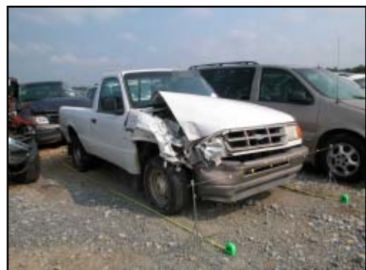
Figure 13. Front right damage to the Ranger

The Ford Ranger (Figure 13) also sustained moderate front right damage as a result of the secondary impact with the Voyager. The direct contact damage began at the right front bumper corner and extended 50.0 cm (19.7") laterally to the left. Silver paint transfers and abrasions were present on the bumper and on the forward left aspect of the hood. The front right corner of the bumper was crushed rearward, as well as the right front fender. The combined direct and induced damage involved the entire frontal width of