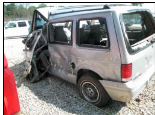
Figure 5. Left side sideslap damage

The Voyager sustained moderate right side damage as a result of the impact with the Ford Ranger. The direct damage began 3.0 cm (1.2") forward of the right front axle and extended 133.0 cm (52.4")