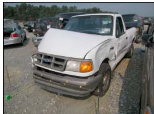
Figure 12. Left side damage to the Ranger

The Ford Ranger pickup truck (Figure 12) sustained moderate left side damage as a result of the initial sideswipe impact with the Cadillac DeVille. The direct contact damage began at the left front bumper corner and extended rearward 278.0 cm (109.4") along the left side. A red paint transfer from the pinstripe on the right rear quarter panel of the Cadillac was present on the rear aspect of the left front fender. The left front fender and left door sustained abrasions and lateral deformation. The combined direct and induced damage began at the left front bumper corner and extended rearward 305.0 cm (120.1"). Minor inward deflection was noted on the left rear quarter panel forward of the left rear axle. The CDC for the initial sideswipe impact with the DeVille was 11-LDES-1. Six crush measurements were documented along the left side aspect and were as follows: C1 = 0.0 cm, C2 = 1.9 cm (0.8"), C3 = 6.1 cm (2.4"), C4 = 7.4 cm (2.9"), C5 = 10.2 cm (4.0"), C6 = 27.9 cm (11.0").