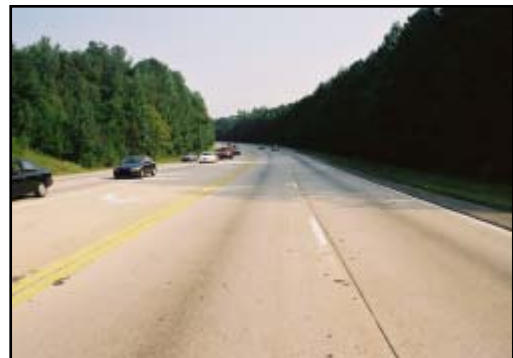
Figure 3. Eastbound approach for the Cadillac DeVille