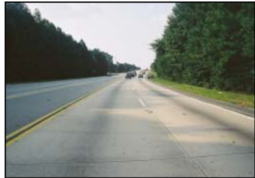
Figure 2. Westbound approach for the Plymouth Voyager and Ford Ranger

The 44-year-old female driver was operating the Plymouth Voyager on the inboard westbound lane and entered the slight right curve ( Figure 2 ). Her pre-crash travel speed was unknown. The 34-year-old male driver of the 1994 Cadillac DeVille was operating the vehicle at a high rate of speed in the inboard eastbound lane ( Figure 3 ). As the DeVille descended the slight downgrade and entered the left curve on approach to the crash site, the vehicle began to hydroplane on the wet roadway surface. The driver lost control of the vehicle and the DeVille initiated a CCW yaw. The Cadillac departed the travel lane and crossed the paved median while it continued to rotate. The DeVille had rotated a total of approximately 110 degrees in a CCW direction, exposing its right side, when it encroached into the inboard westbound lane into the path of the oncoming Plymouth Voyager. It was unknown if the driver of the Voyager attempted any avoidance maneuvers prior to the crash. The 1994 Ford Ranger was traveling behind the Voyager in the outboard lane.