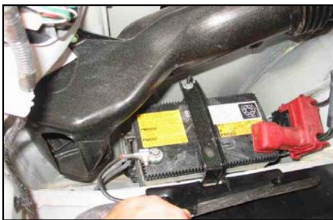
Figure 9 - Hybrid engine battery.

There was no intrusion of the battery pack area or damage to the area of the left side harness. The engine compartment was not damaged. This crash did not expose a risk to the driver. There was no evidence of damage or procedures initiated by the first responders to the crash site.