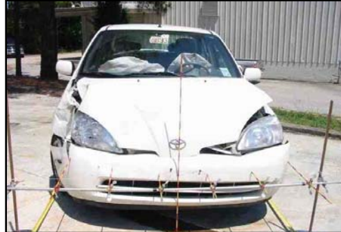
Figure 3 - Frontal damage to the 2002 Toyota Prius.

The 2002 Toyota Prius sustained moderate damage as a result of the impact with the 1992 Nissan pickup truck ( Figure 3 ). The NASS vehicle inspection reported that the maximum crush as at the right front bumper corner and measured 18 cm (7.1"). The SCI revised direct contact damage extended from the left bumper corner to the right bumper corner and measured