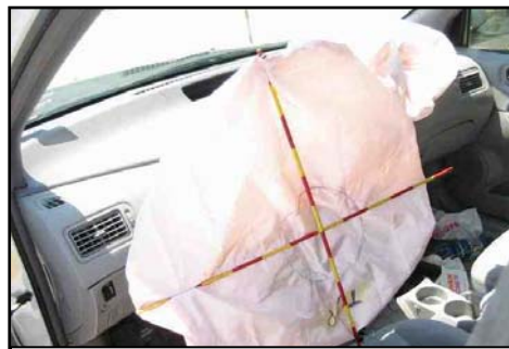
Figure 7 - Driver's air bag.

The 2002 Toyota Prius was equipped with redesigned frontal air bags for the driver and front right seating positions. The Prius was also equipped with side impact air bags mounted in the front seat backs. The frontal air bags deployed as a result of the impact with the 1992 Nissan truck. The driver’s air bag ( Figure 7 ) deployed through a tri-fold module cover flap