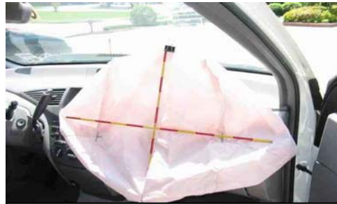
Figure 8 - Right front passenger air bag.

The front right air bag ( Figure 8 ) deployed from a top-mount H-configuration module cover flap with the upper flap measuring 20 cm (7.9”) in width and 7 cm (2.8”) in height and the bottom flap measuring 21 cm (8.3”) in width and 8 cm (3.1”) in height. The deployed right air bag measured 68 cm (26.8”) horizontally and 48 cm (18.9”) vertically in its deflated state. The bag was vented by two ports located at the lateral aspects of the bag in the 10 and 2 o’clock positions.