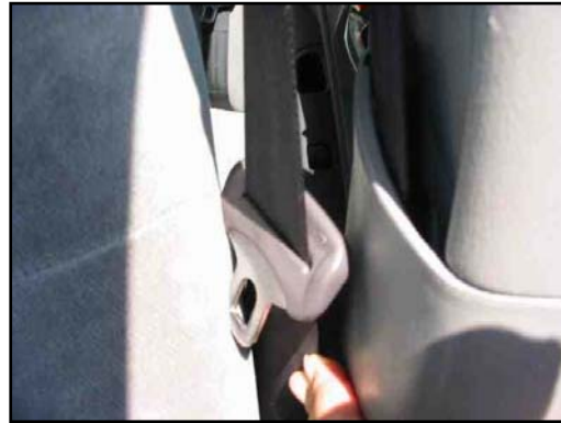
Figure 6 - Right front seat belt latch plate and restricted belt along the B-

The rear belt systems consisted of sliding latch plates and switchable ELR/ALR configurations in all three positions. There was no evidence of belt usage on the right rear safety belt’s latch plate, webbing, or seatbelt housing and appears to have not been used