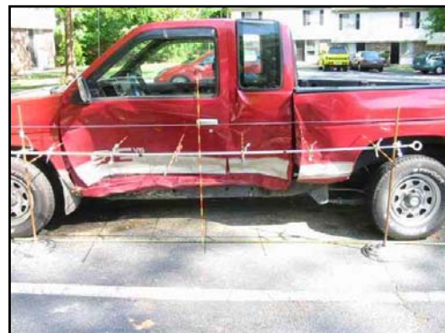
Figure 4 - Left side damage to 1992 Nissan Pick-Up.

The 1992 Nissan pickup truck sustained moderate damage as a result of the impact with the 2002 Toyota Prius ( Figure 4 ). The NASS inspection reported that the maximum crush to the Nissan was located 250 cm (98.4") forward of the left rear axle and measured 20 cm (7.9") in depth. The direct contact damage reportedly began 96 cm (37.8") forward of the rear left axle and measured 130 cm (51.1") in width.