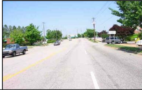
Figure 2 - Overall view of north/south roadway.

This crash occurred on a five-lane, north/south roadway in a residential area during daylight hours ( Figure 2 ). The roadway was configured with two northbound and two southbound lanes separated by a center left lane turn bay. The roadway was surfaced with asphalt and was delineated by solid yellow lines contiguous to the turn bay and broken white lines separating the four north/south lanes. The travel lanes were 3.5 m (11.5') in width and the center turn bay was 3.8 m (12.5') wide; paved shoulders that were 0.5 m (1.6') in width bordered the roadway.