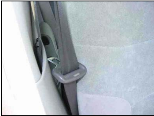
Figure 5 - LF latch plate and restricted belt along the B-pillar.

The 2002 Toyota Prius was equipped with 3-point continuous loop safety belt systems for all five seating positions. It should be noted that the NASS investigation determined that the three occupants in the Prius, seated in the front left, front right, and rear right positions, were restrained by the 3-point manual safety belts. The SCI reinvestigation does not support belt use. The driver’s safety belt was configured with a sliding latch plate, Emergency Locking Retractor (ELR), and an adjustable D-ring, which was in the full-down position at the time of the NASS inspection. The front right belt was configured with a sliding latch plate, a switchable ELR/Automatic Locking Retractor (ALR), and an adjustable D-ring, which was in the full-down position. Both frontal safety belts were restricted in an unused position taught along the B-pillar as a result of the retractor pretensioner actuation. It was determined by the SCI reinvestigation as not used during the crash ( Figures 5 and 6 ).