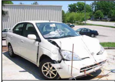
Figure 1 - Subject vehicle 2002 Toyota Prius.

This remote investigation focused on the performance of the alternative fuel system that was present in a 2002 Toyota Prius ( Figure 1 ). The Prius was equipped with a hybrid drive train, which consisted of a 1.5-liter gasoline engine coupled with an electric motor. The vehicle was designed to run on battery power, gasoline, or a combination of both dependant on throttle input and desired speed. The 2002 Toyota was