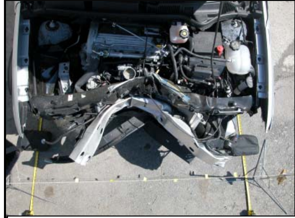
Figure 5: Overhead view of the frontal damage.