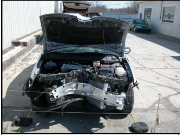
Figure 4: Front view of the Saturn.