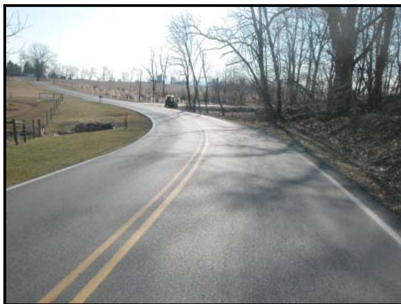
Figure 3: Eastbound trajectory view 55 m (180 ft) from impact.

This single vehicle run-off-road/fixed object crash occurred during the daylight hours in February 2004. At the time of the crash, weather was snow/sleet and rain. The asphalt road pavement was police reported as icy. The crash occurred on a two-lane east/west rural road at the exit of a small radius left curve for eastbound traffic. The radius of the curve measured 85 m (280 ft). A stand of small diameter trees located 3 m (10 ft) from the edge of the travel lane bordered the road. A 36 cm (14 in) diameter tree located at the end of the tree stand was the point of impact. At the beginning of the curve, the road had a negative grade (estimated greater than 2 percent) in the eastbound direction. The grade transitioned to level in the area of the impact. A north/south two lane road located 23 m (75 ft) east of the point of impact intersected the primary road from the south forming a three leg intersection. The speed limit in the area of the crash was 56 km/h (35 mph). Figure 2 is an eastbound trajectory view approaching the crash site. Figure 3 is a view of the point of impact.