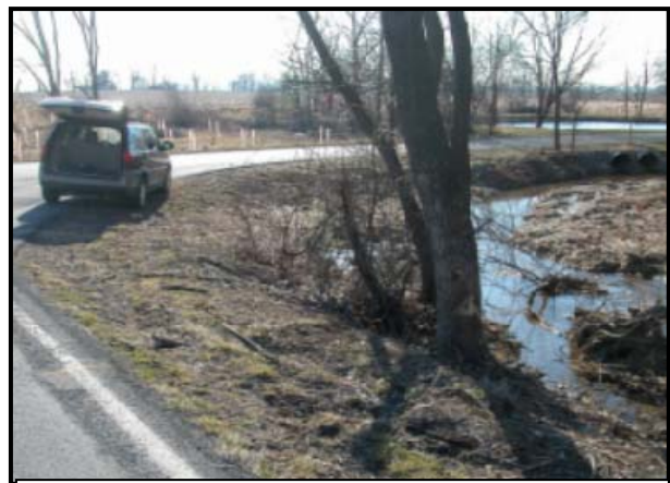
Figure 2: View of the point of impact.