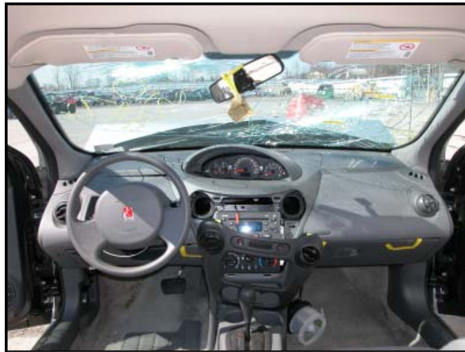
Figure 6: Interior view.

Figure 6 is an interior view of the Saturn. The vehicle's interior damage consisted of the identified (unrestrained) occupant interior contacts. There was no intrusion or damage related to the exterior force of the impact. There was no deployment of the vehicle's frontal air bags.