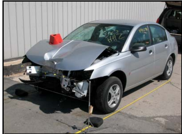
Figure 1: 2004 Saturn Ion.

This on-site investigative effort focused on the performance of the Advanced Occupant Protection System (AOPS) in a 2004 Saturn Ion, Figure 1 . The Saturn was involved in a fixed object frontal impact with a tree. The Saturn was equipped with an AOPS that consisted of dual-stage frontal air bags and retractor pretensioners for the front safety belts. The AOPS was not commanded to deploy in the moderate severity frontal crash. Additionally, the vehicle was equipped with an Event Data Recorder (EDR) that had the capabilities to record both pre-crash vehicle systems and crash related data. That data was downloaded during the inspection as a supplement to the investigation. The 23 year old male driver and 25 year old male front right passenger were unrestrained at the time of the crash and were not injured. Neither occupant requested medical attention nor were they transported.