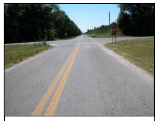
Figure 2. Westbound approach for the 1991 Chevrolet Lumina

The front of the Toyota Tundra pickup truck impacted the left side aspect of the Chevrolet Lumina minivan. The impact was severe and was sufficient to deploy the