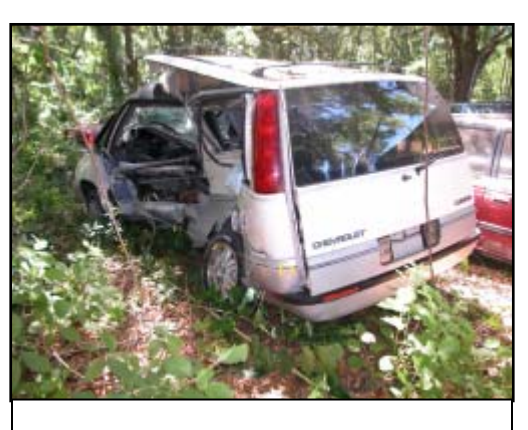
Figure 1. Damaged 1991 Chevrolet Lumina

This on-site investigative effort focused on the fatal injury mechanisms of a 3-year-old male child passenger that was restrained in a forward-facing convertible child safety seat (CSS), which was positioned in a 1991 Chevrolet Lumina APV minivan ( Figure 1 ). The Lumina was also occupied by an unrestrained 53-yearold female driver, a restrained 10-year-old female front right passenger, and an unrestrained 7–year-old female rear left passenger. The driver brought the Lumina to a controlled stop at a four-leg intersection, which was controlled by stop signs for east/west traffic. A 2000 Toyota Tundra pickup truck with a utility trailer in tow was traveling northbound on approach to the intersection at a police-reported speed of 72 km/h (45