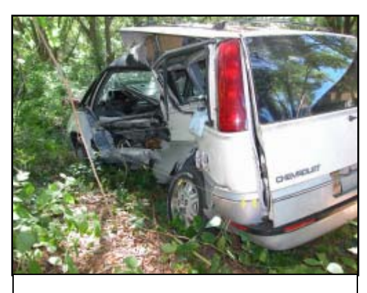
Figure 4. View of left side damage

The 1991 Chevrolet Lumina APV sustained severe left side damage as a result of the impact with the Toyota Tundra pickup truck ( Figure 4 ). The direct contact damage began 78.0 cm (30.7") rear of the left front axle and extended 180.3 cm (71.0") rearward along the left side plane. The maximum crush measured 78.1 cm (30.8") and was located 194.9 cm (76.8") rear of the left front axle. The composite body panels were fractured in multiple locations as a result of the direct contact. The left front exterior door panel was completely separated, although the reinforcement bar and latch/striker assembly showed no signs of failure. The left side