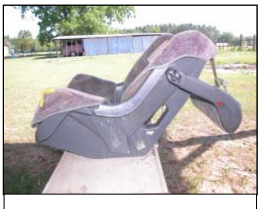
Figure 13. Left side view of the CSS

The CSS sustained minor damage as a result of the crash (Figure 13). Scuff marks and abrasions were present on the left side aspect of the plastic shell, and the left arm of the tray shield was partially separated at the seams. White scuff marks from contact with the intruding left side panel of the Lumina were present on the outboard left front aspect of the CSS on the overlapping fabric. The transfers began 2.5 cm (1.0") from the front corner and measured 3.8 cm (1.5") in length and 2.5 cm (1.0") in height. Due to the lateral nature of the crash, loading to the harness straps and harness slots was minimal. Faint abrasions were present on the rear left aspects of both harness slots. Body fluid (blood) was present on the left aspect of the CSS fabric