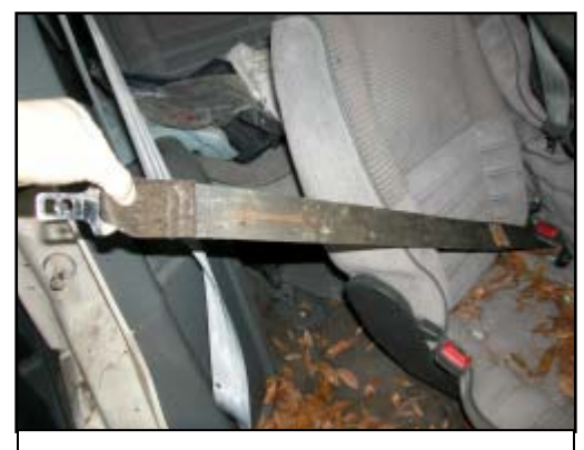
Figure 11. View of fully extended lap belt for the second row center position

The second row was configured with manual 3-point lap and shoulder belts for the outboard seating positions. The right safety belt was configured with a locking latch plate, an unknown retractor type, and was compatible with an optional full-width bench seat, which was not in use. A crease in the webbing at the Dring supported historical non-use. The second row left safety belt was configured with an unknown retractor type and a sliding latch plate, and was restricted in a partially stowed position at the time of the vehicle inspection, due to induced damage from the impact. One twist in the webbing was present between the latch plate and fixed D-ring. The second row center seat was