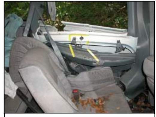
Figure 9. View of occupant contact on the left side panel

Faint clear fluid-like residue was present at multiple locations on the headliner, although it could not be determined if this was related to any of the occupants. Body fluid (blood) from the 3-year-old child was present on the left side panel adjacent to the second row seats ( Figure 9 ). The transfer was located 54.6 cm (21.5") aft of the left B-pillar and extended 19.1 cm (7.5") rearward on the plastic panel and 13.3 cm (5.3") rearward on the sheet metal at the beltline. The transfer began at the bottom of the window frame and extended downward 21.6 cm (8.5").