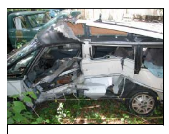
Figure 5. Overhead view of left side damage and roof separation

The lateral crush resulted in the separation of the roof from the left roof side rail (Figure 5). The separation began at the left B-pillar and extended rearward to the left rear corner of the roof side rail. From the separation at the B-pillar, the composite roof sustained a lateral fracture that measured 50.8 cm (20.0") in length from the roof side rail. The maximum vertical separation of the roof measured 36.2 cm (14.3") and was located 10.2 cm (4.0") forward of the B-pillar centerline. The left rear body panel was deformed and fractured as a result of direct and induced fracture as a result of the crush to the forward aspect. Six crush measurements were documented along the left side aspect at the mid-door