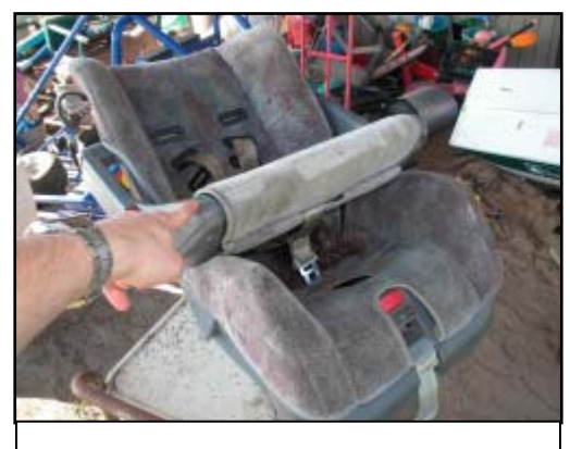
Figure 12. Century convertible CSS

A convertible Century CSS ( Figure 12 ) was positioned in the second row middle seat and secured by the lap belt with the ALR. It appeared to be consistent with a Century STE 3000, but it could not be confirmed. The labeling on the CSS had been removed, and the model number and date of manufacture were unknown. A warning on the plastic shell stated: "Do not use this car seat after December 2004." The CSS was configured with an adjustable plastic tray shield that was positioned in the full-rear position (relative to the CSS). The parents stated that the CSS was purchased new approximately seven years ago, and had been used for the other children in the family. The parents also stated that the owner's manual had been consulted when the