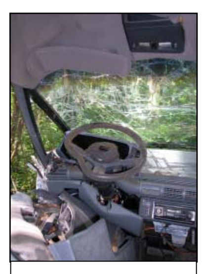
Figure 6. View of deformation and intrusion into the driver's position

The Chevrolet Lumina sustained severe interior damage as a result of passenger compartment intrusion (Figure 6). The driver's plastic knee bolster was compressed laterally, partially separated, and fractured below the steering column. The left face of the knee bolster also exhibited a transfer from contact with the composite body panel of the left front door. The lower left quadrant of the steering wheel rim was deformed 7.0 cm (2.8") inward and exhibited a crease in the area of the deformation as a result of direct contact with the intruded left front door. The intrusion also resulted in the lateral deflection of the steering column to the right and the 0.3 cm (1/8") forward displacement of the right shear capsule. The left instrument panel sustained fractures and displacement due to intrusion. The left front interior door panel and armrest were fractured in multiple locations and located 7.6 cm (3.0") left of the vehicle centerline. The driver's seat cushion and outboard seat track were rotated 90 degrees inboard about their longitudinal axis as a result of the sill crush