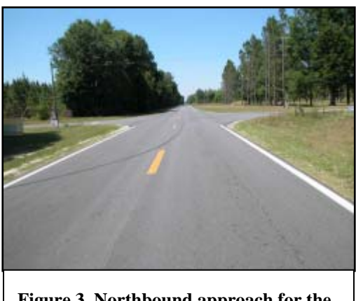
Figure 3. Northbound approach for the 2000 Toyota Tundra

frontal air bags in the Toyota Tundra. Due to the pre-crash speed of the pickup truck and the weight of the loaded trailer, the pickup truck's momentum far exceeded that of the Lumina. The damage algorithm of the WinSMASH program computed a total delta-V of 59.0 km/h (36.7 mph) for the Lumina based on the documented crush profile. The WinSMASH-computed delta-V for the Toyota Tacoma pickup truck was 21.0 km/h (13.0 mph) based on the crush profile that was estimated from photographs. The momentum of the loaded trailer caused the Class III trailer hitch to rotate forward 90 degrees, and the front aspect of the trailer overrode the pickup truck bed.