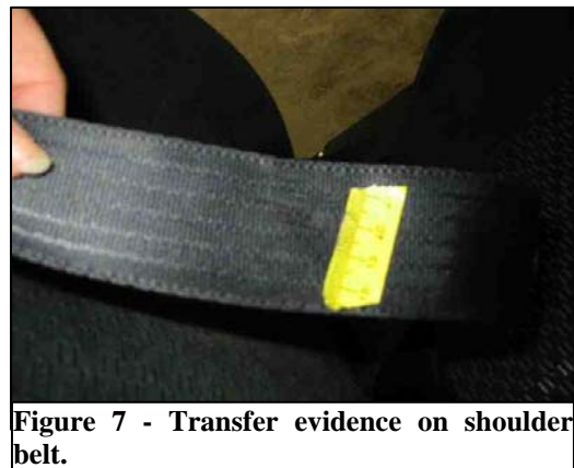
Figure 7 - Transfer evidence on shoulder belt.

The 2005 Nissan Altima was configured with manual 3-point lap and shoulder belts and sliding latch plates for all five seating positions. The driver's belt exhibited loading evidence in the form of minor scuffing and stretching on the webbing indicating that the restraint was in use during the crash ( Figure 7 ). The driver's seat was equipped with an Emergency Locking Retractor (ELR), a retractor pretensioner, and an adjustable D-ring, which was in the full-up position. The front right seat was equipped with a retractor pretensioner and adjustable D-ring, which was in the full-up position. The