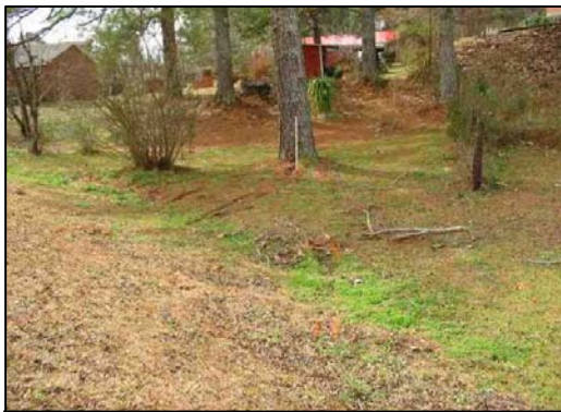
Figure 4 - Foot of slope; area of undercarriage impact.

The Nissan traveled in a northwesterly direction approximately 25 meters (75') descending down the slope until it bottomed out as the roadside environment leveled ( Figure 4 ). The front aspect of the undercarriage struck the ground in a non-horizontal configuration. The vehicle continued tracking in a northwesterly direction on the wooded roadside an additional 5 meters (15') before striking a large pine tree of an unreported diameter with its front right corner ( Figure 5 ). The direction of force for the impact with the tree was 12 o'clock. An SCI revised damage algorithm of the WinSMASH program computed a total delta-V of 27 km/h (16.8 mph). The specific longitudinal and lateral velocity change was -27 km/h (-16.8 mph) and 0 km/h, respectively. Following the impact, the Nissan rotated clockwise around the tree approximately 90 degrees and came to rest facing in a northerly direction. The impact deployed the frontal air bag system and actuated the pretensioners in the Nissan.