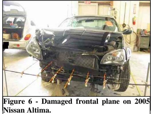
Figure 6 - Damaged frontal plane on 2005 Nissan Altima.

The 2005 Nissan Altima sustained moderate damage as a result of the impact with the pine tree ( Figure 6 ). The direct contact damage began at the right front bumper corner and measured an SCI revised 51 cm (20") in length.* The combined direct and induced damage encompassed the width of the front bumper and measured 160 cm (63"). The NASS investigation revealed that the maximum crush was located 33 cm (13") right of the vehicle's centerline and measured 34 cm (13.4") in depth. The damage profile was measured to the bumper beam and was adjusted for the missing bumper cover and energy absorption material. The crush profile consisted of six equidistant crush measurements that were as follows: C1 = 0 cm, C2 = 6 cm (2.4"), C3 = 17 cm (6.7"), C4 = 25 cm (9.8"), C5 = 34 cm (13.4"), C6 = 23 cm (9.1"). The SCI revised Collision Deformation Classification (CDC) was 12-FREW-2.*