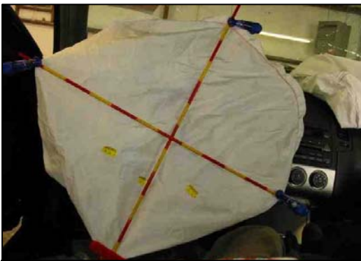
Figure 8 - Driver's air bag.

The front right air bag deployed from a top-mount module configured with a single rectangular vinyl cover flap hinged at the top aspect ( Figure 9 ). The cover flap measured 28 cm in width and 6 cm (2.4") in height. The air bag measured 60 cm (23.6") in height and 65 cm (25.6") in width in its deflated state. The air bag was vented by two circular ports located in the 3 and 9 o'clock positions. The air bag was not tethered and no loading evidence was identified on the air bag membrane.