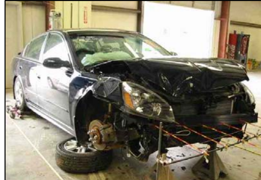
Figure 1 - Damaged 2005 Nissan Altima.

This remote investigation focused on the injury sources to a 45-year old restrained female driver of a 2005 Nissan Altima ( Figure 1 ). The Nissan was equipped with an Advanced Occupant Protection System (AOPS) that consisted of dual stage frontal air bags and front safety belt pretensioners. The Nissan was involved in a moderate severity crash with a pine tree. The vehicle departed the roadway and descended down a slope where it bottomed out as the roadside leveled, and then continued