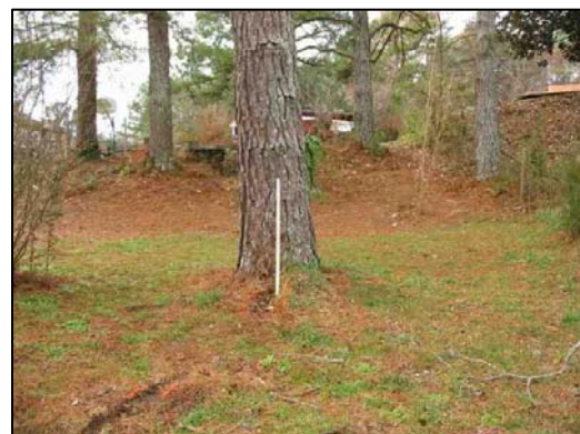
Figure 5 - Point of impact with pine tree.