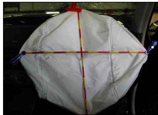
Figure 9 - Front right air bag.