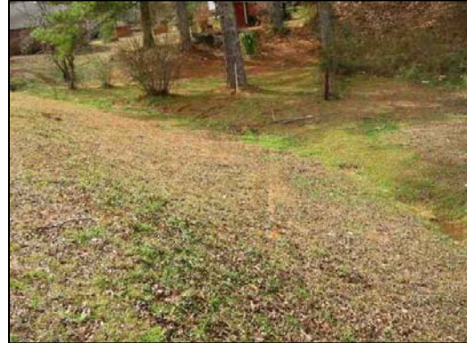
Figure 3 - Slope leading to point of impact.