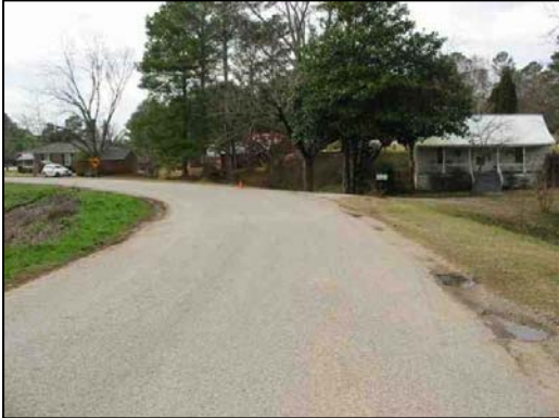
Figure 2 - Westbound approach of Nissan Altima.