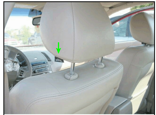
Figure 11: Driver's active head restraint; the small black tag (arrow) reads "Active Head Restraint"

The driver's active head restraint ( Figure 11 ) did not show any evidence of its action because the system is entirely mechanical. The padded head restraint is connected to a pressure plate in the backrest of the seat. The system uses the force of the occupant's body against the seat back to move the head restraint forward, and when this force is relaxed the system returns. There was probably some slight movement of the driver's active head restraint when the driver rebounded into his seat as the case vehicle rotated counterclockwise to final rest.