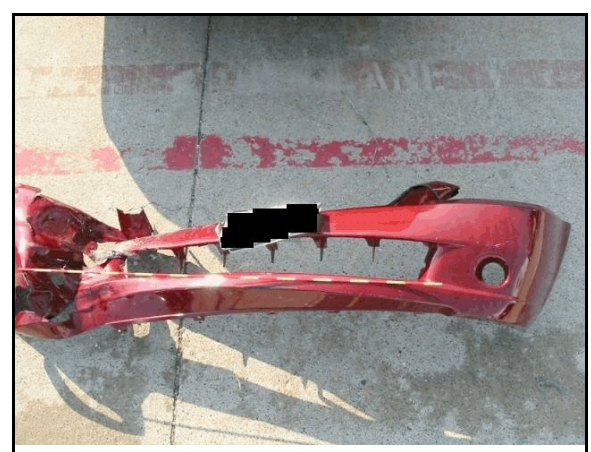
Figure 5: Case vehicle's front bumper cover, which was torn off during the collision events

The crush measurements were taken along the steel bumper because the bumper cover was torn off. Maximum crush was documented as 32 centimeters [12.6 inches] at C5, slightly to the