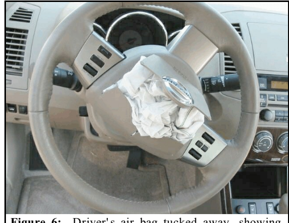
Figure 6: Driver's air bag tucked away, showing cover flaps

The case vehicle was equipped with driver and front right passenger advanced air bags with dual-stage inflators, and with retractor pretensioners and active head restraints for the two front seats. In addition, the front right bucket seat was equipped with an occupant weight sensing system in the seat cushion. The driver was the only occupant in the case vehicle, and only the driver's air bag deployed.