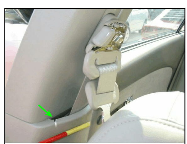
Figure 10: Passenger's unused safety belt taut against right B-pillar; note, trim panel torn (arrow) by the force of the retractor pretensioner