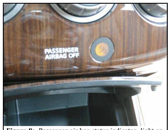
Figure 8: Passenger air bag status indicator, light on shows air bag automatically suppressed

The case vehicle was equipped with retractor-type safety belt pretensioners for the two front seats that actuated for both seats. The driver's safety belt, which was in use at the time