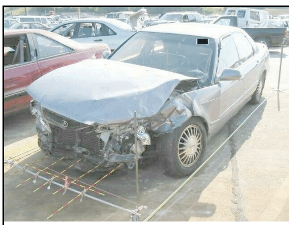
Figure 13: Acura's front and left side

The Acura sustained direct contact damage across its entire front (Figures 12 and 13), with the heaviest damage at the front left corner. The left fender was crushed inward with substantial induced damage extending to the left A-pillar, the left side of the engine hood was crushed inward and bent downward, the left headlamp/turn signal assembly and grille were shattered and broken away, and the bumper cover was torn off. The steel bumper was crushed rearward against the bottom of the radiator and the radiator was crushed rearward against the engine. The right headlamp/turn signal assembly was shattered but did not break away and the leading edge of the right fender was crushed rearward. The wheelbase was shortened by 12 centimeters [4.7 inches] on the left and was unchanged on the right. The left front wheel/tire assembly was displaced rearward and was restricted against the trailing edge of the left wheel well. The right front wheel was restricted by deformed body panels in the right wheel well. The hood shifted rearward and impacted the windshield, causing extensive cracking, and there was no other glazing damage.