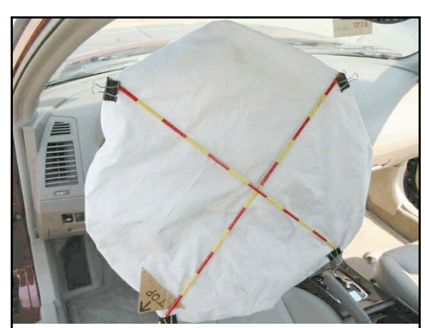
Figure 7: Front of driver's air bag, top of air bag is oriented at the 7:00 sector