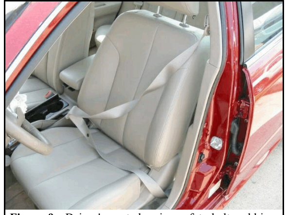
Figure 9: Driver's seat showing safety belt webbing extended because it was in use when it was locked by the actuated retractor pretensioner

of the crash, was locked with the webbing extended (Figure 9). There was no passenger in the front right seat position and the safety belt webbing was pulled taut against the right B-pillar (Figure 10).