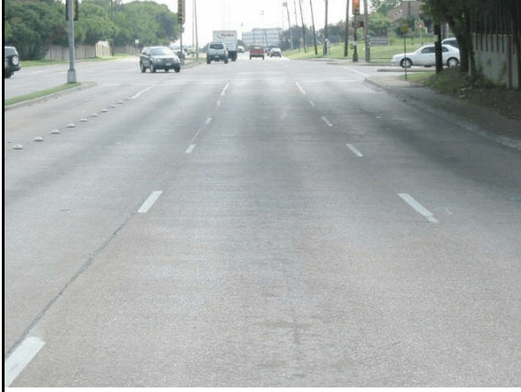
Figure 2: Acura's eastbound approach toward intersection, intending to go straight

driver and front right passenger air bags both deployed. The case vehicle rotated counterclockwise