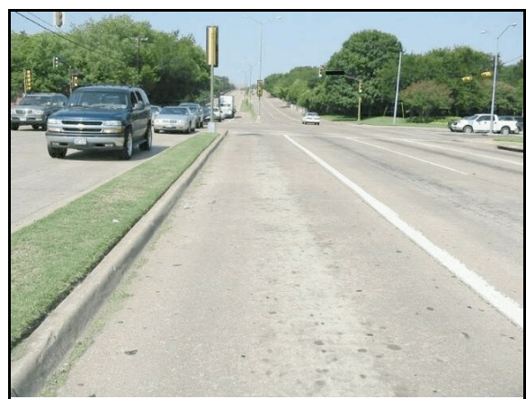
Figure 1: Case vehicle's westbound approach toward intended left turn at intersection

The front of the case vehicle impacted the front of the Acura, causing the case vehicle's driver air bag (only) to deploy. The Acura's