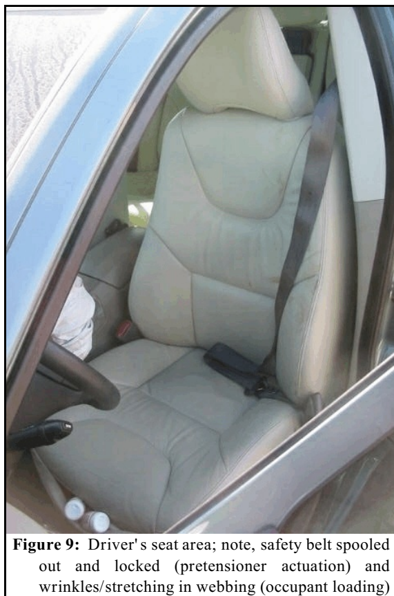
Figure 9: Driver's seat area; note, safety belt spooled out and locked (pretensioner actuation) and wrinkles/stretching in webbing (occupant loading)