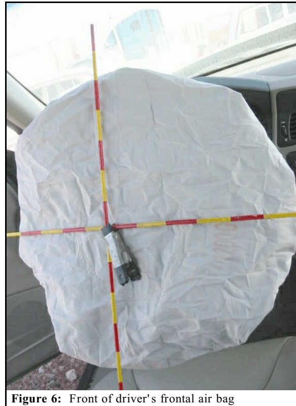
Figure 6: Front of driver's frontal air bag

The front right passenger's air bag was located in the top of the instrument panel on the right ( Figure 7 ). This air bag had a two-stage inflation system, but, because the case vehicle did not have a downloadable Event Data Recorder, it is not known if this was a one-stage or a two-stage