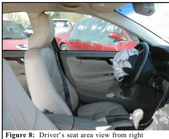
Figure 8: Driver's seat area view from right

The driver's medical records indicate that she suffered from advanced osteoporosis in the cervical and thoracic regions of her spinal column. Normal lordotic 5 curvature was preserved in the cervical region but slight kyphotic 5 curvature was evident in the thoracic region and the soft tissue silhouette in the radiographic images showed the outline of a slight “dowager's hump” 5 . With this pre-existing medical condition, her cervical and thoracic spine would be structurally weakened due