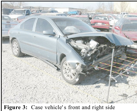
Figure 3: Case vehicle's front and right side

The case vehicle was a 2004 Volvo S60 front wheel drive, four-door, five-passenger sedan (VIN: YV1RS61TX42-----), equipped with a 5-cylinder 2.4 liter gasoline engine and an automatic transmission with a console-mounted selector lever. Four-wheel anti-lock brakes and traction control were standard on this model. The case vehicle was equipped with: manual, three-point, lap-and-shoulder safety belts with retractor pretensioners for the four outboard seat positions; dual-stage frontal air bags; seat back-mounted side impact air bags and active head restraints for the two front seats; roof rail-mounted side curtain air bags that provide inflatable protection for the front and back outboard seat locations; and a tilt-and-telescope steering column. 1 Its wheelbase was 272 centimeters [106.9 inches] and its odometer reading is not known. The case vehicle was towed due to disabling damage.