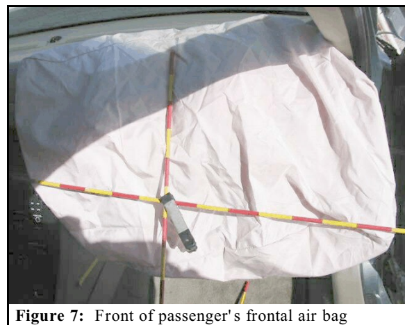
Figure 7: Front of passenger's frontal air bag