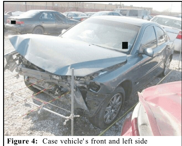
Figure 4: Case vehicle's front and left side

The case vehicle sustained direct contact damage across its entire front from the impact with the concrete wall (event #2). The ground leading from the roadway to the wall had a positive slope and the case vehicle's bumper was crushed rearward to the leading edges of the front tires while the upper radiator support and the leading edge of the hood had lesser crush, reflecting the up-sloping angle at which the case vehicle engaged the wall ( Figures 3 and 4 ). The bumper cover was torn off and the grille and both headlamp/turn signal assemblies were shattered and broken away. The leading edge of the hood had slight direct contact and was bent downward and creased, more so on the right. The leading edges of both fenders were crushed rearward. The right fender was also bent outward and had induced damage extending to the right A-pillar. The rocker panel below the right front door was displaced. The wheelbase was shortened by 9 centimeters [3.5 inches] on the right and lengthened by 5 centimeters [2.0 inches] on the left. The left rear tire was deflated, the right front tire was restricted by deformed body panels and there was no other wheel or tire damage. There was no glazing damage.