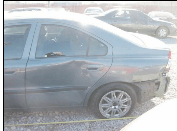
Figure 5: Case vehicle's left rear door, showing minor damage from first impact

The case vehicle's first impact, with the tractor-trailer, involved minor denting and scraping on the left rear door panel. Maximum crush was measured as 5 centimeters [2 inches] at C3, slightly forward of the left rear door handle. The rear bumper cover was torn off, perhaps as a result of snagging on the tractor-trailer's right side components. The CDC was determined to be 09-LPEW-1 (270 degrees) . This impact is out of scope for the WinSMASH reconstruction program. This was an impact of minor severity (1-13 km.p.h. [1-8 m.p.h.]) for the case vehicle.